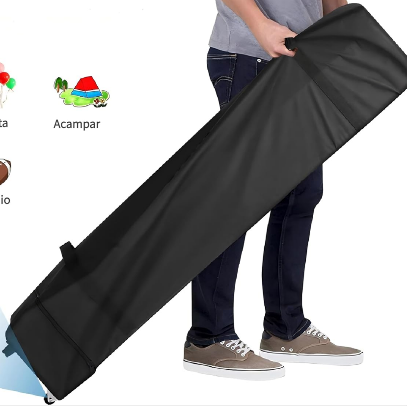
Image 7.1: The wheeled carry bag facilitates easy transport and storage.