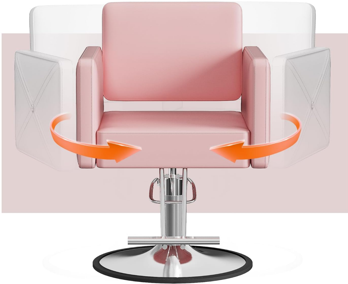
Figure 4: Demonstration of the chair's 360-degree smooth swivel and locking feature.