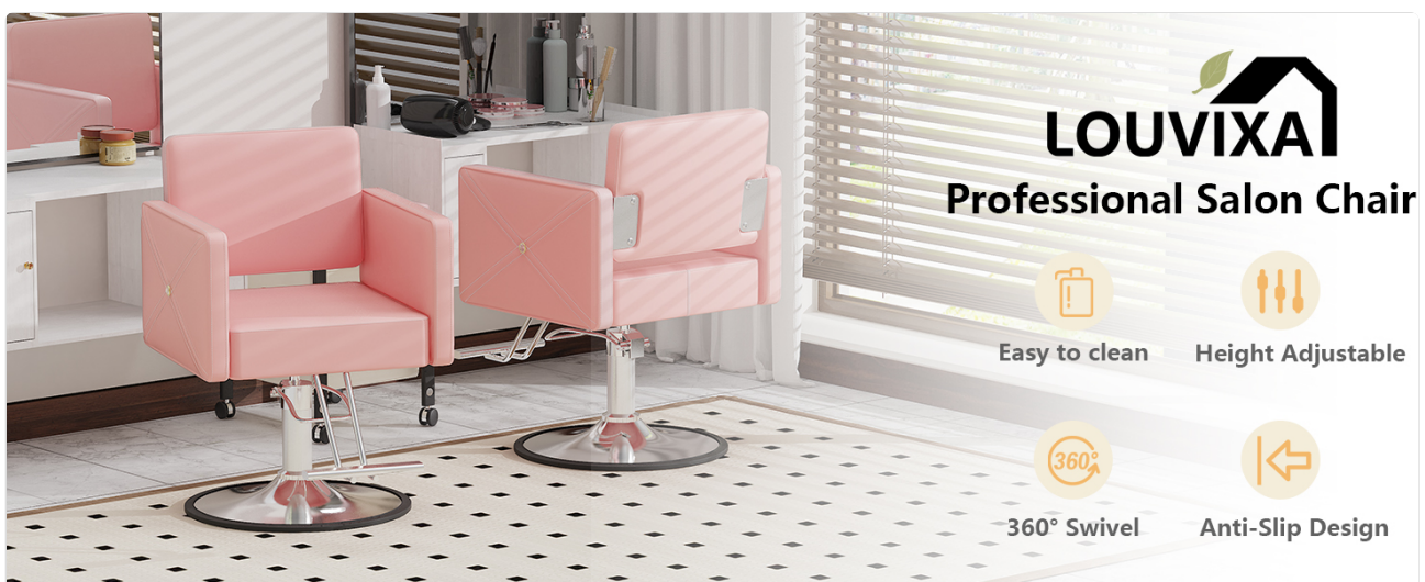
Figure 1: Assembly steps for the LOUVIXA Barber Salon Chair.