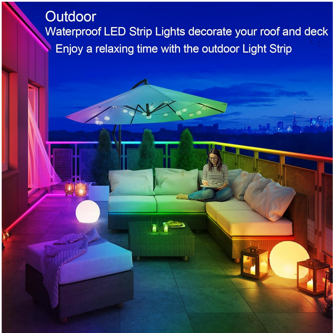
Image 8: LED strip lights enhancing the ambiance of an outdoor balcony.

Enjoy a relaxing time with the outdoor Light Strip