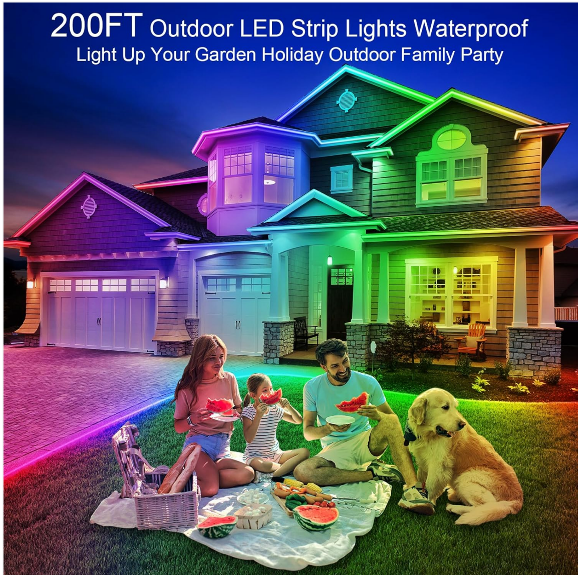
Image 7: Outdoor LED strip lights illuminating a family gathering in a garden.