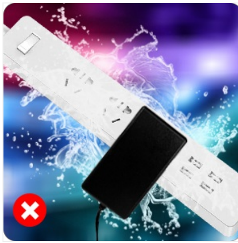
Image 2: The power adapter and controller are not waterproof and must be protected from moisture.