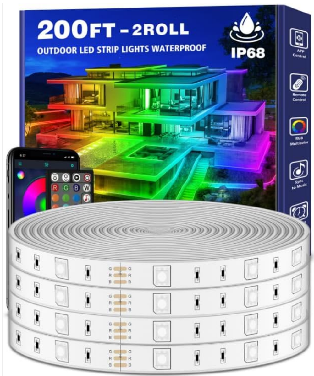
Image 1: LETIANPAI 200ft Outdoor LED Strip Lights product packaging and coiled lights.