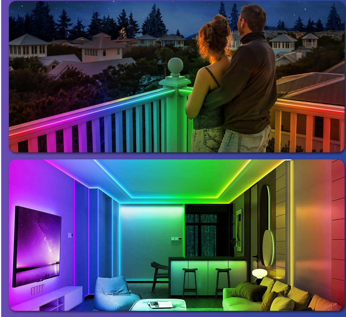
Image 9: Examples of both indoor and outdoor applications for the LED strip lights.