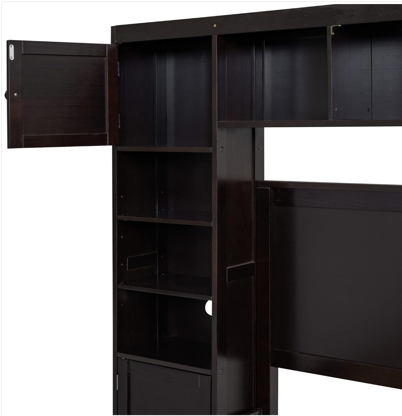
Figure 4: Detailed view of the headboard's integrated shelving units and cabinet doors.