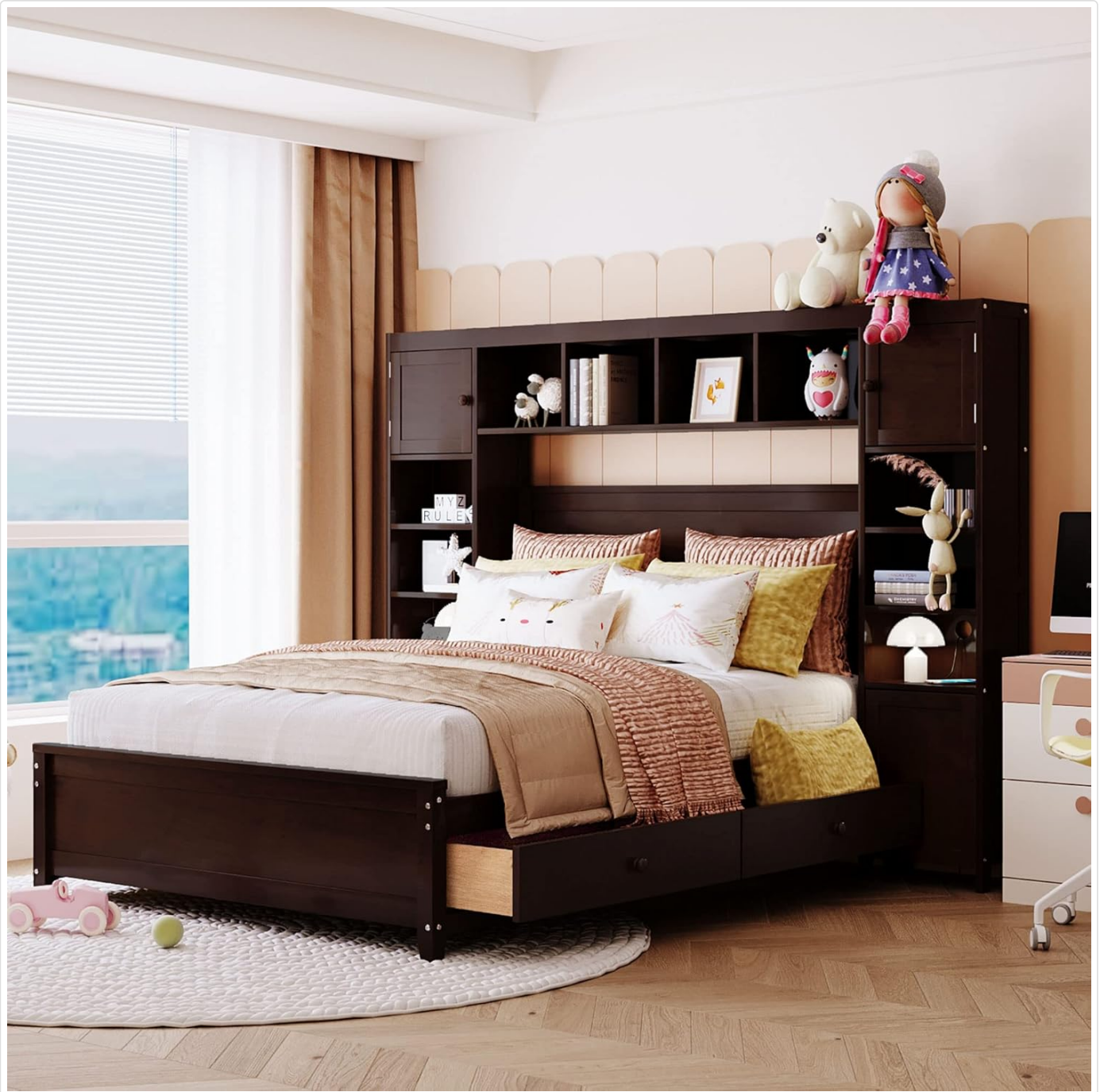
Figure 1: The Polibi Full Size Bed Frame with integrated headboard and storage drawers.

Assembly of the Polibi Full Size Bed Frame requires careful attention to detail. It is recommended that two adults perform the assembly. All necessary tools and clear instructions are provided within the packaging.