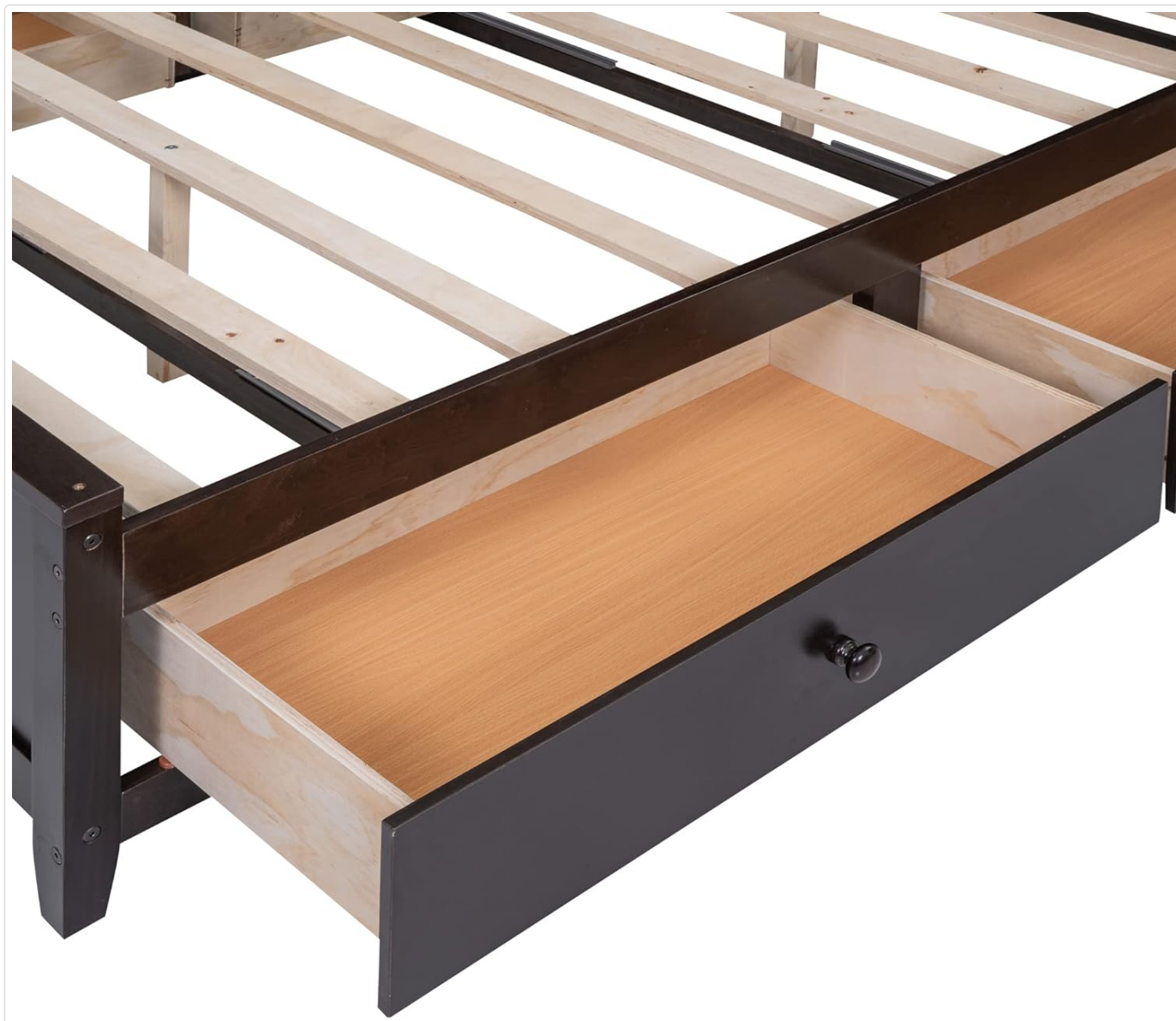
Figure 6: Detailed view of one of the under-bed storage drawers, highlighting its construction and smooth operation.