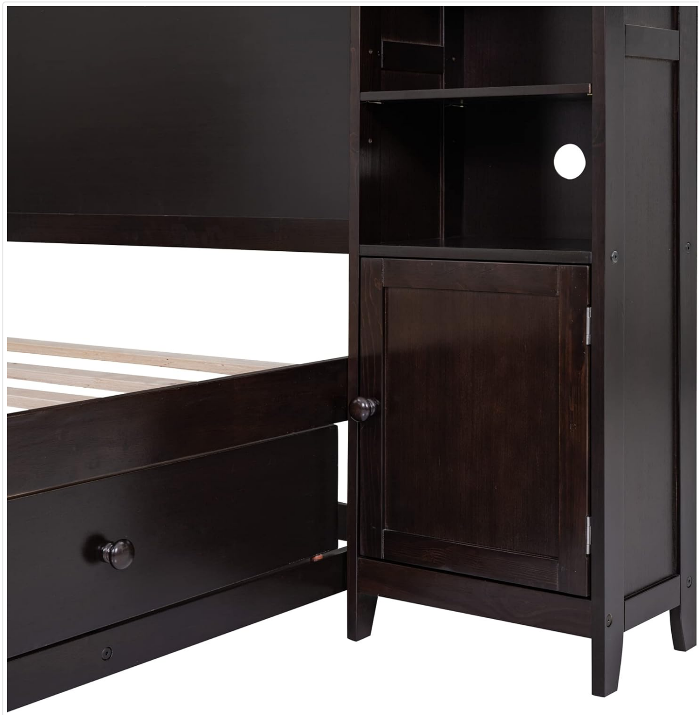
Figure 5: Close-up of a headboard cabinet and the wireable charging position hole, designed for cable management.