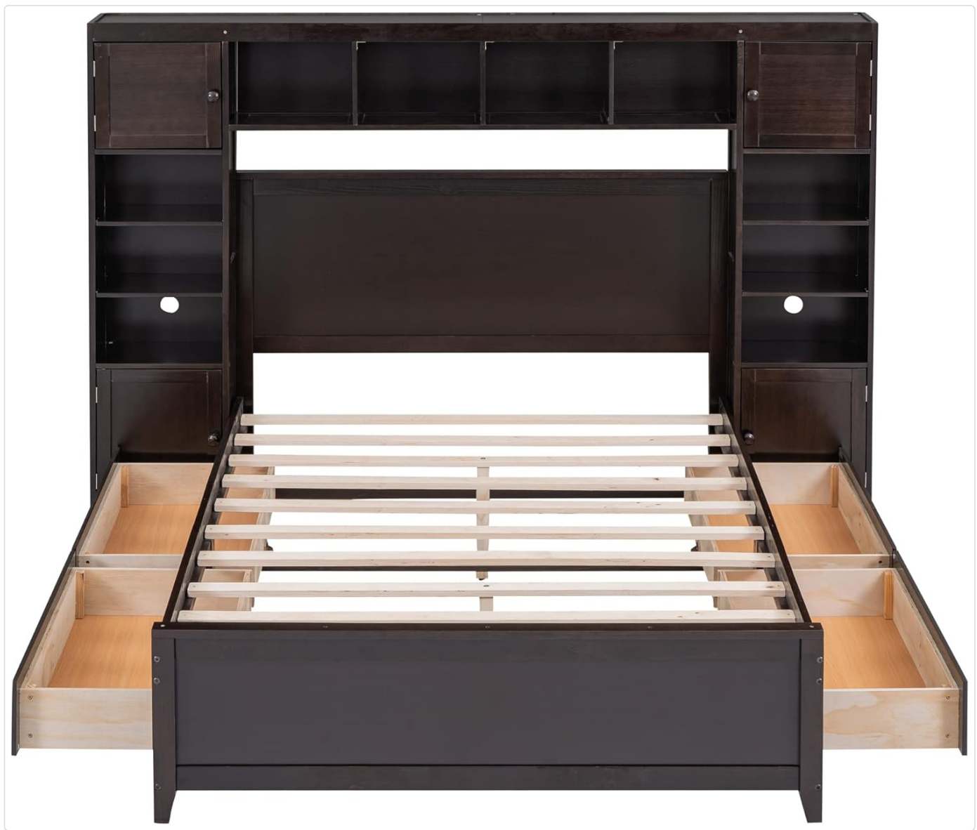
Figure 3: View of the bed frame with all four storage drawers extended, showcasing the under-bed storage capacity.