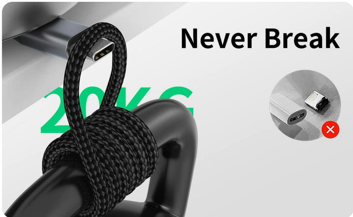
Image 5: Illustration highlighting the cable's durability, showing it can withstand over 45,000 bends.