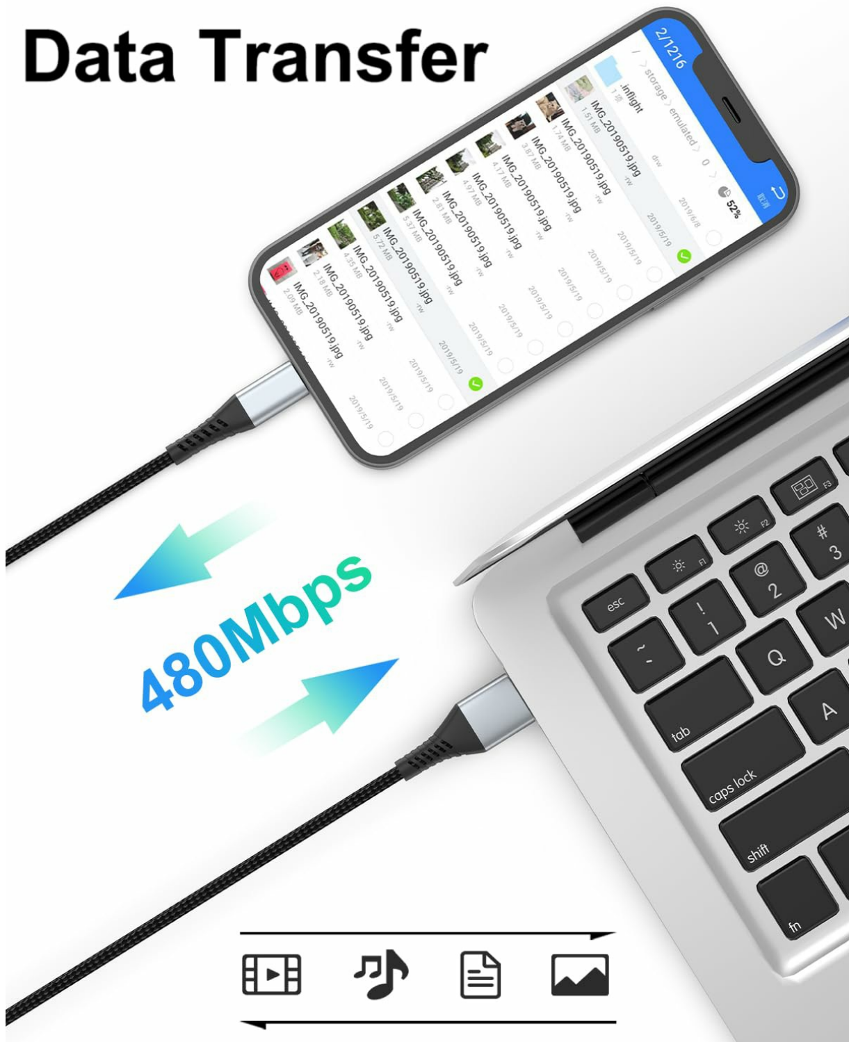
Image 4: Depiction of data transfer at 480Mbps, showing files moving between an iPhone and a laptop.