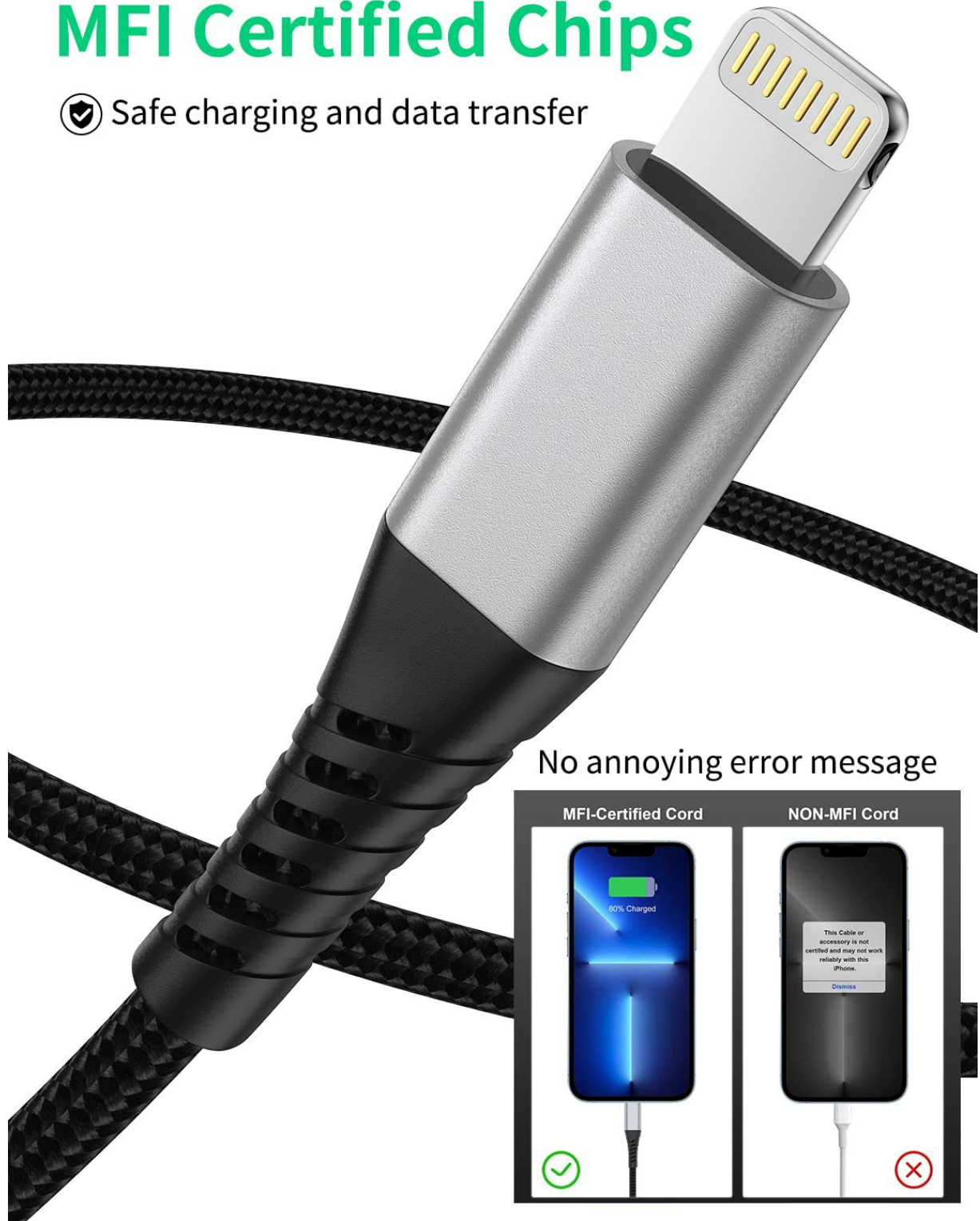
Image 2: Illustration of the MFi certified chip ensuring safe charging and data transfer without error messages.