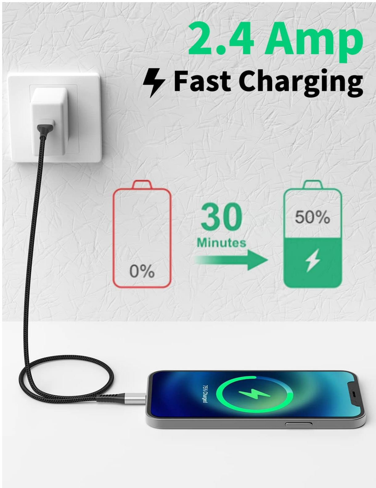
Image 3: Visual representation of fast charging capability, showing a device reaching 50% charge in 30 minutes.