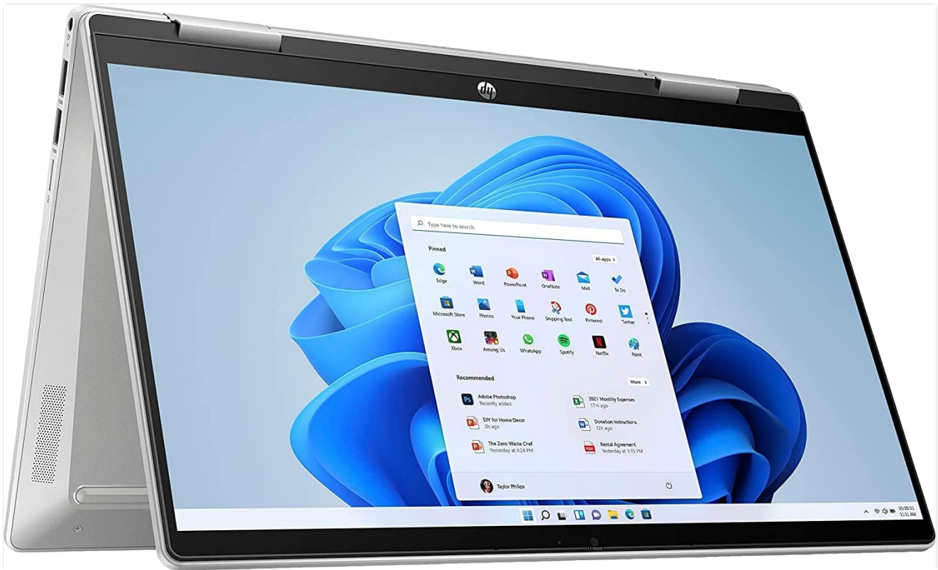
Figure 3.3: The HP Pavilion x360 laptop in tablet mode, demonstrating its portability and touch functionality.