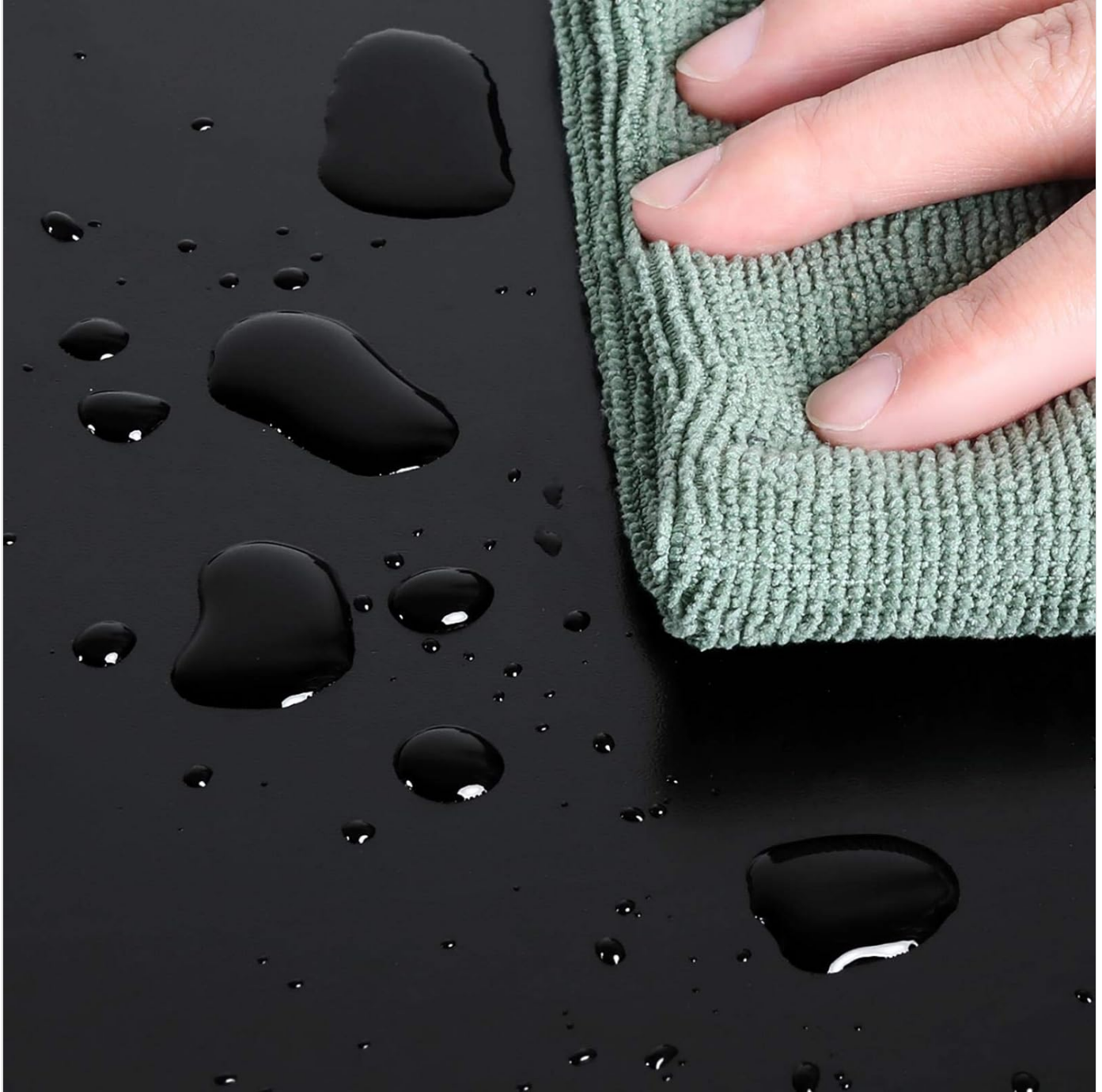
Image: Demonstrates the easy-to-clean surface of the desk, showing water resistance.