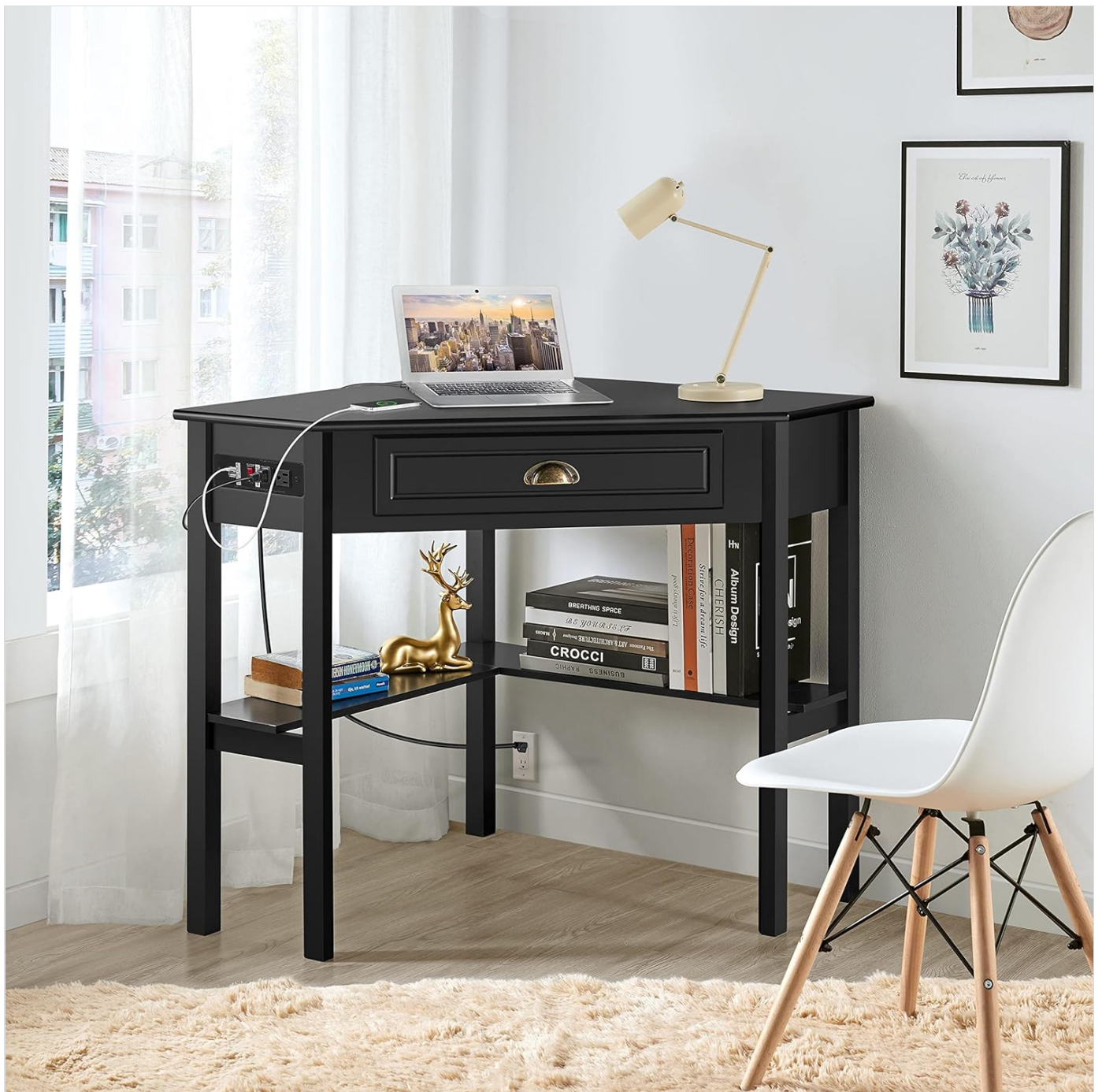
Image: The fully assembled L-shaped desk, showcasing its compact design and integrated storage.