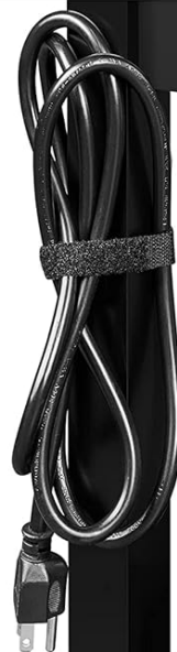
Image: A close-up view of the integrated power outlet with 2 USB and 2 AC ports, and the wire management hook & loop fastener.

Hoop & loop fastener for cord organizing