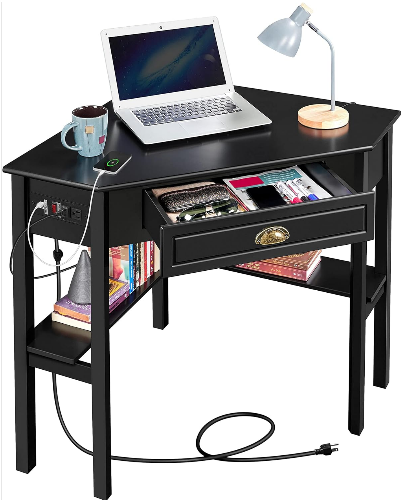
Image: The desk with its drawer open, showing ample storage space for various items.