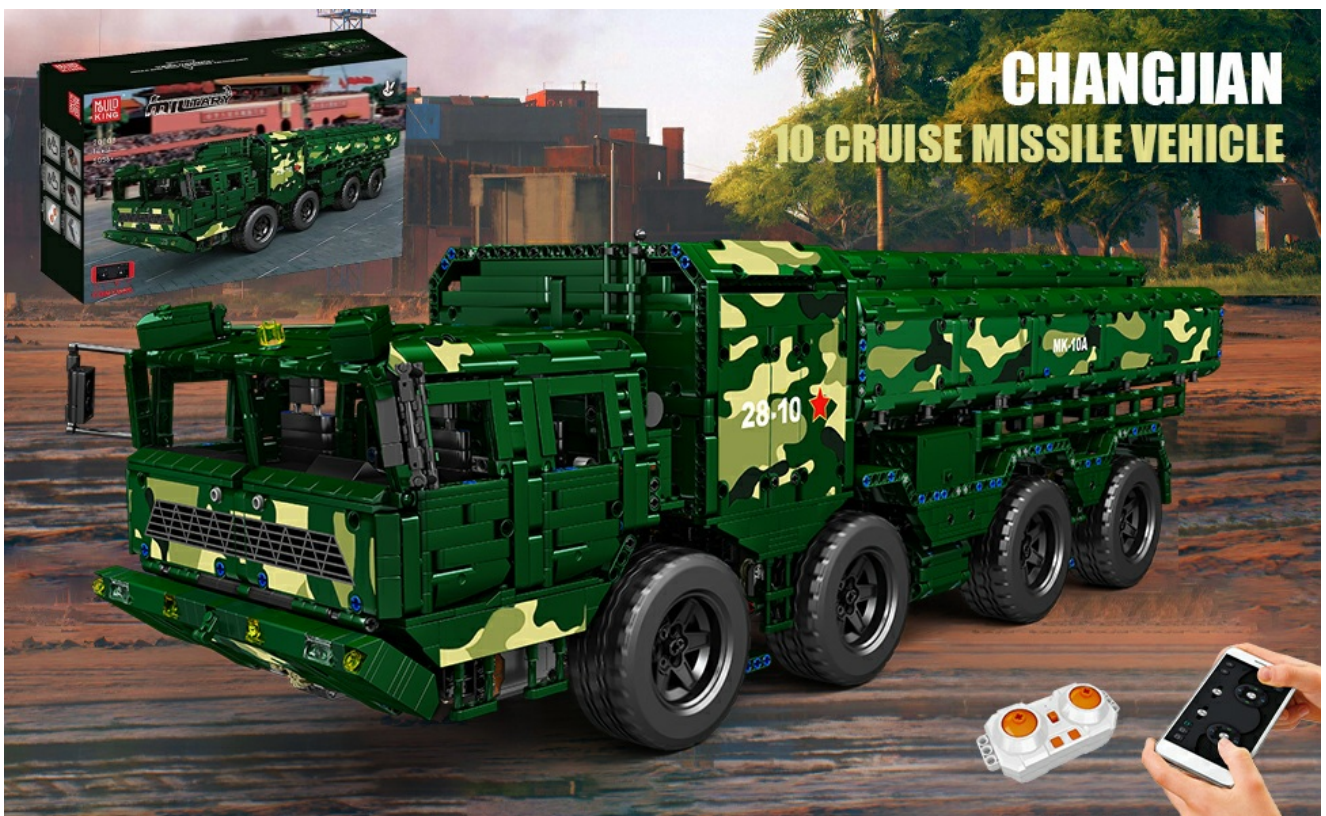
Image: The Mould King 20008 Technik CJ-10 Missile Vehicle, showcasing its impressive size and remote control capabilities.

Thank you for choosing the Mould King 20008 Technik CJ-10 Missile Vehicle Building Block Set. This comprehensive kit allows you to construct a detailed military-style missile vehicle with advanced remote and app-controlled functions. This manual provides essential information for assembly, operation, maintenance, and troubleshooting to ensure an optimal experience with your 4848-piece model.