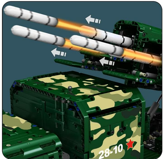
Image: The missile bay in a raised position, with missiles shown in a simulated launch sequence.