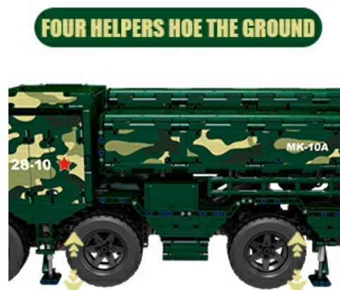
Image: The four stabilizers extending from the vehicle's chassis to provide stability.