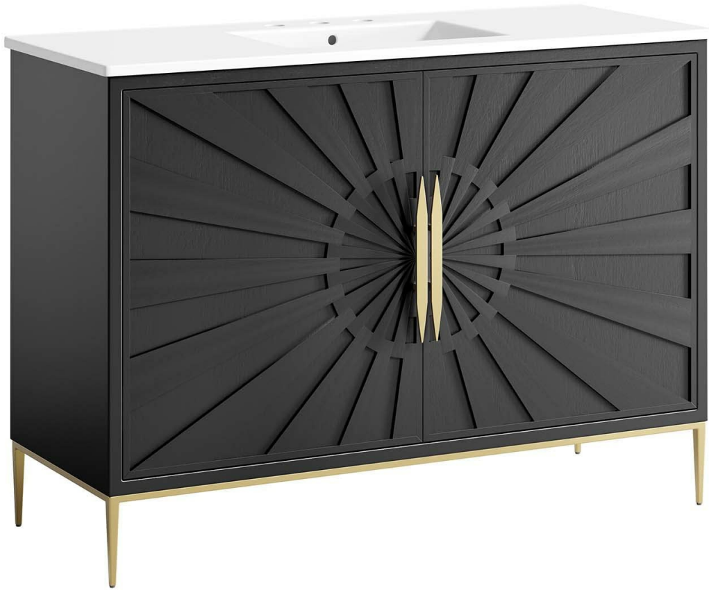
Image: The Modway Awaken 48-inch Bathroom Vanity Cabinet in White Black, featuring a ceramic sink and gold hardware.

The Awaken vanity cabinet is designed to enhance your bathroom space with its modern aesthetic. It features clean lines, a radial design on the doors, and a durable construction of solid wood and MDF. The vanity includes a ceramic sink basin with an integrated countertop and offers ample storage behind its detailed doors.