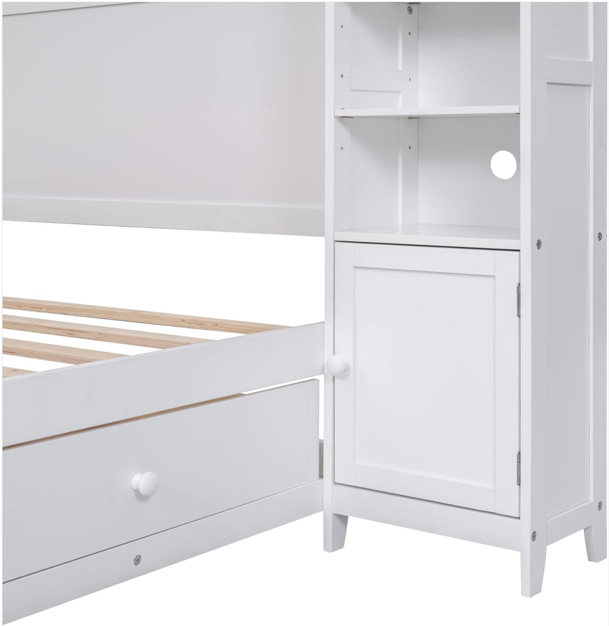
Image: A close-up of the headboard's integrated cabinet and shelf unit, highlighting the open shelves and a closed cabinet door.