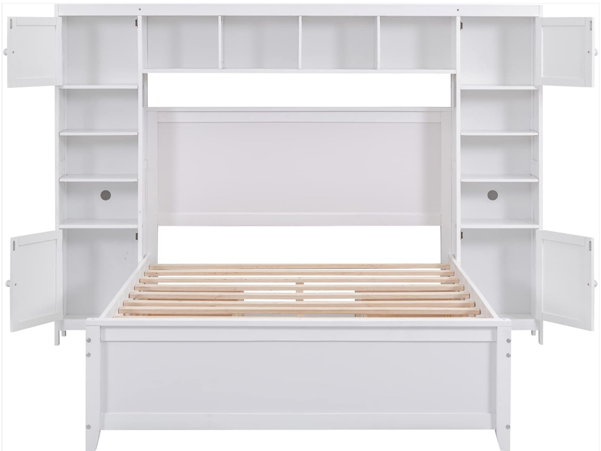
Image: Front view of the Merax Full Size Platform Bed, showcasing the headboard with its cabinet doors open, revealing internal shelving for storage.