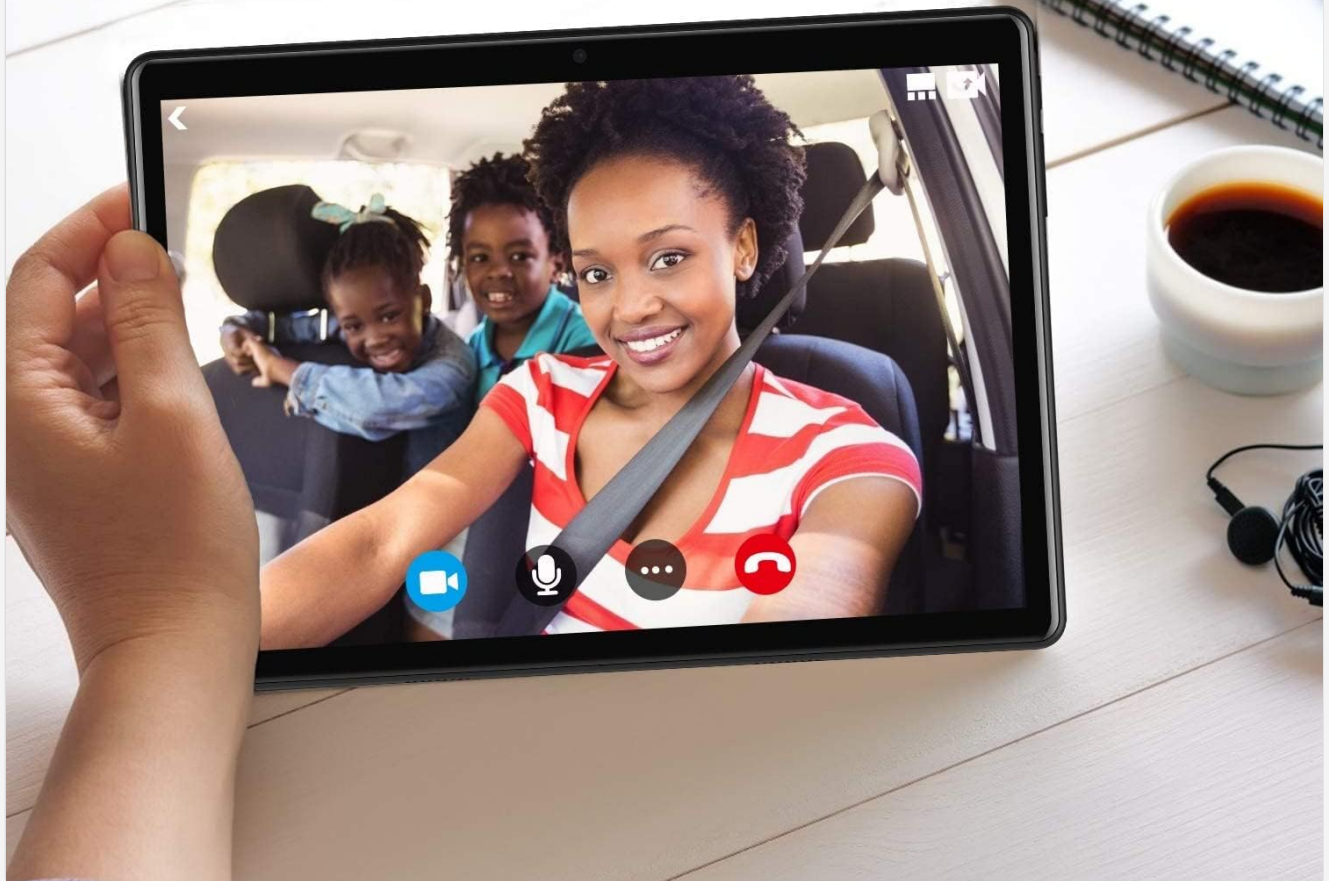
Image: A user holding the DUODUOGO P6 tablet, taking a selfie with the front-facing camera, demonstrating its use for video calls and self-portraits.