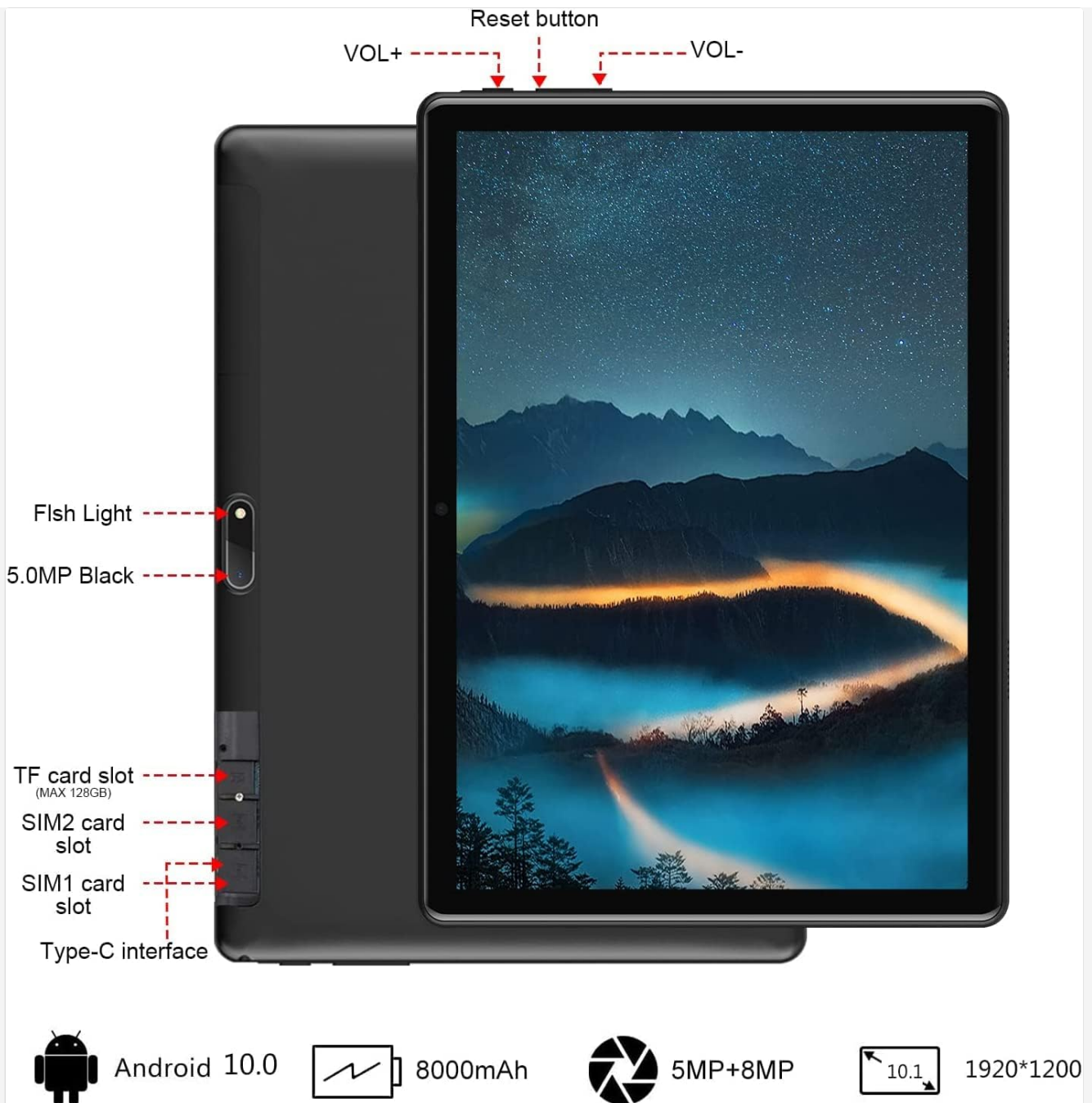
Image: A diagram illustrating the various ports and buttons on the DUODUOGO P6 tablet. Labels indicate the volume up (VOL+) and volume down (VOL-) buttons, reset button, front camera (5.0MP), rear camera (8.0MP) with flash, TF card slot (supports up to 128GB), SIM1 card slot, SIM2 card slot, and Type-C interface.