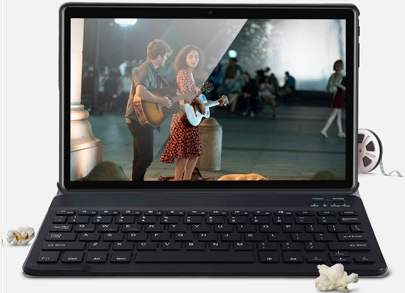
Image: The DUODUOGO P6 tablet, attached to its keyboard, displaying a high-definition video on its 10.1-inch IPS screen, emphasizing its visual quality.

10.1-inch large-size narrow-edge high-definition IPS full viewing angle screen. Fully fitted work clothes make the screen fresh and transparent. 1920x1200 pixels, more restored image quality and color.