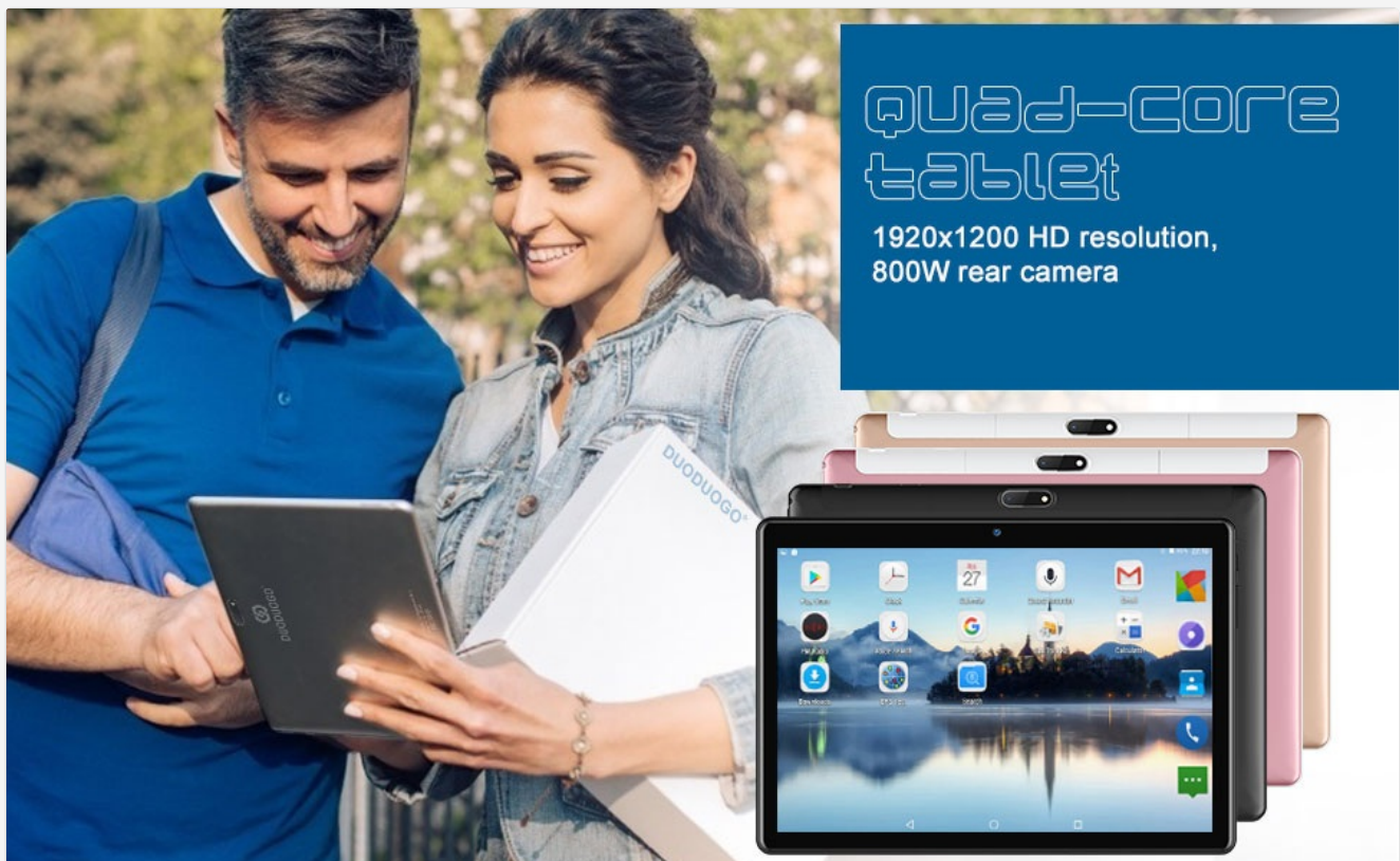
Image: The DUODUOGO P6 tablet screen showing the Android 10 operating system interface with various app icons, demonstrating

Your tablet runs on the GMS-certified Android 10.0 operating system, providing a smooth user experience and access to the Google Play Store for applications. The new notification center and ad-blocking functions enhance usability.