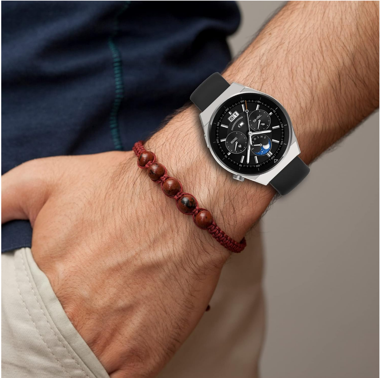
Image: A smartwatch with a black silicone band worn on a wrist, demonstrating a comfortable fit.