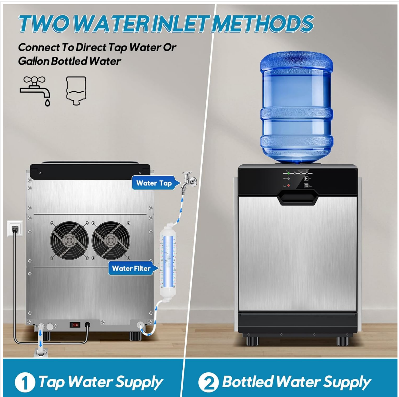
Figure 4.1: Dual Water Inlet Methods. This image illustrates how to connect the ice maker to either a direct tap water supply with an inline filter or use a 5-gallon bottled water supply.