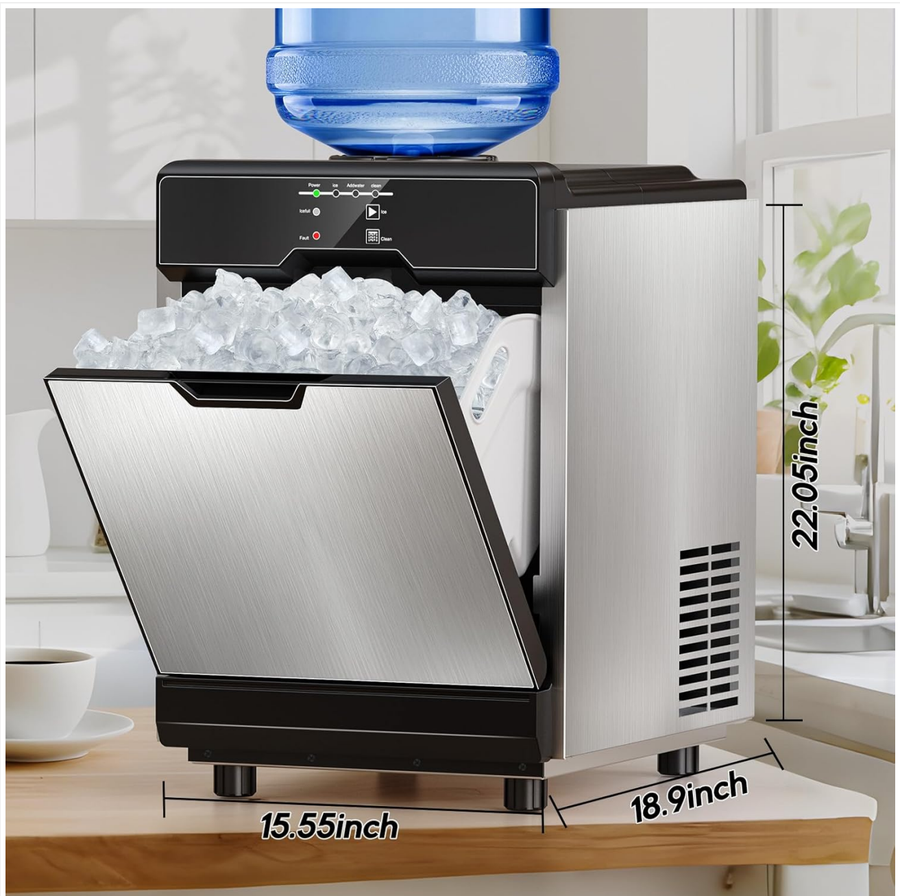
Figure 8.1: Product Dimensions. This image shows the ice maker with its depth (18.9 inches), width (15.55 inches), and height (22.05 inches) clearly labeled.