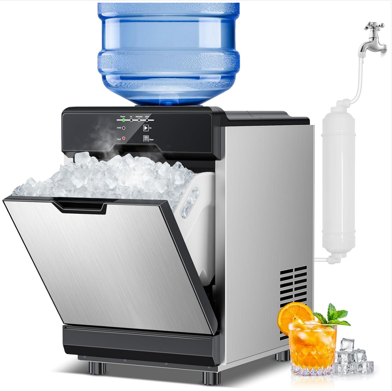
Figure 2.1: Hothope Nugget Ice Maker Countertop Model IM-S2-A. This image displays the ice maker with a 5-gallon water bottle on top, an open ice basket filled with nugget ice, and a water filter connected to a tap on the right side.