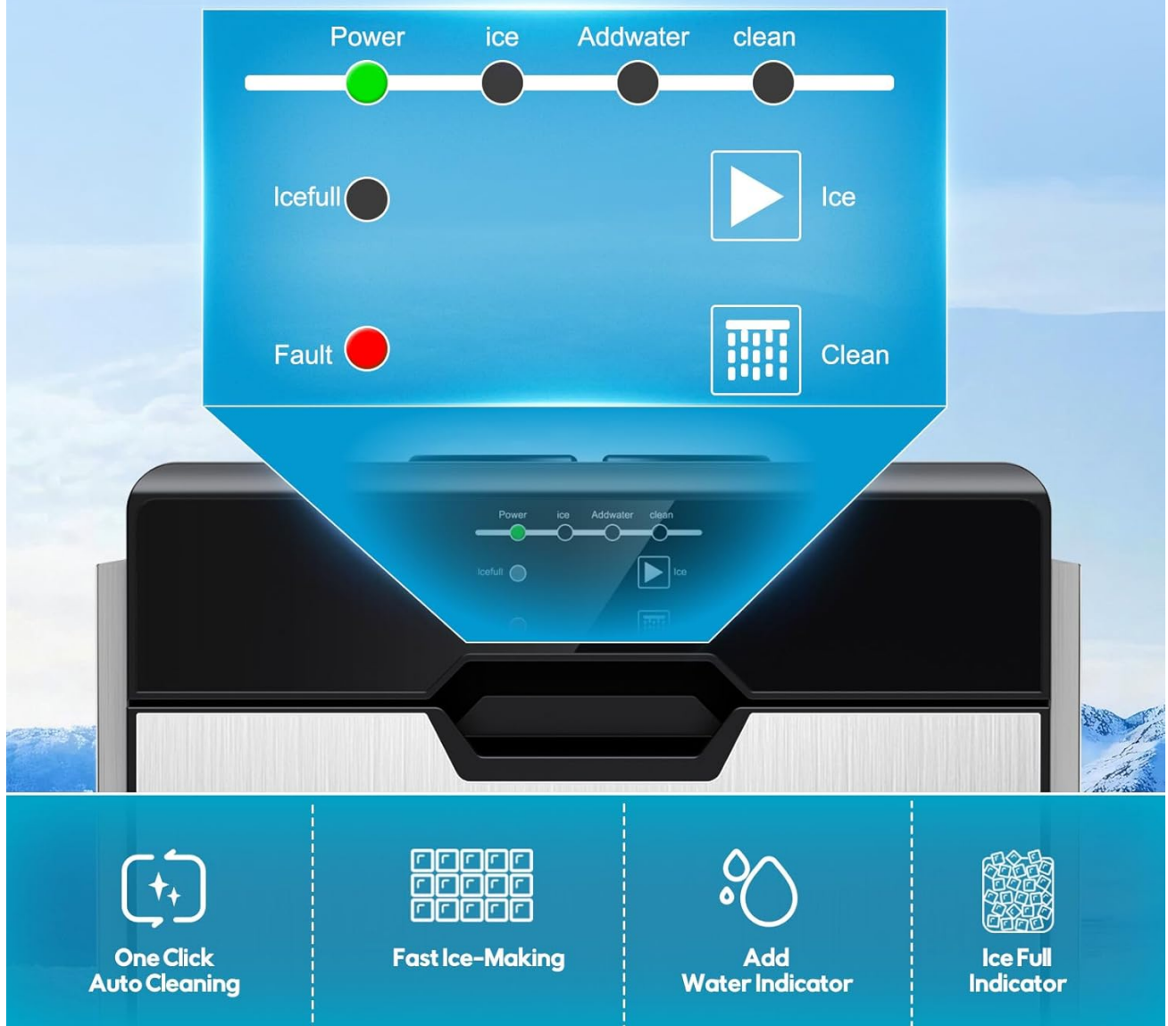
Figure 5.1: Simple Operation Panel. This image details the control panel with indicators for Power, Ice, Add Water, Clean, Ice Full, and Fault, along with buttons for Ice and Clean functions.