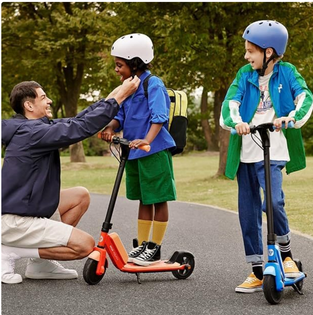
Image: An adult assisting a child with a helmet, emphasizing the importance of safety gear.