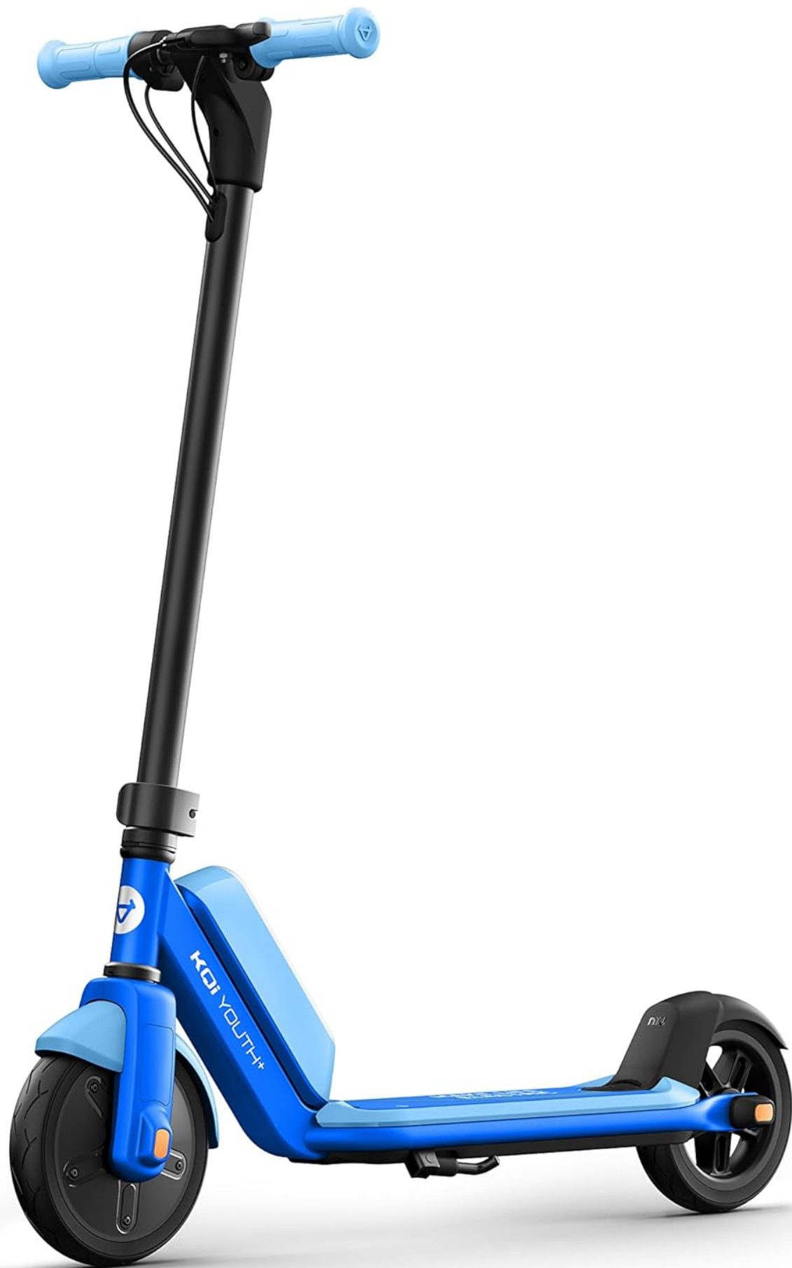
Image: Front view of the NIU KQi Youth+ Electric Kick Scooter in blue.