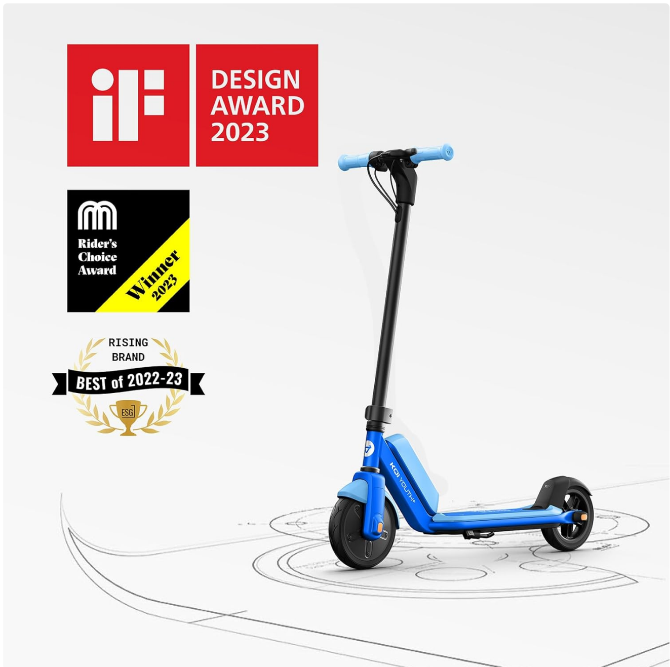
Image: Angled view of the assembled NIU KQi Youth+ scooter, showing its compact design.