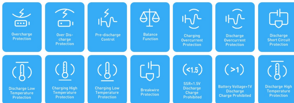
Image: Infographic detailing the 14 types of protection offered by the NIU Battery Management System (BMS).

With 14 types of protections, the NIU Battery Management System (BMS) has safely carried millions of riders more than 7 billion miles. Your feet are in good hands.