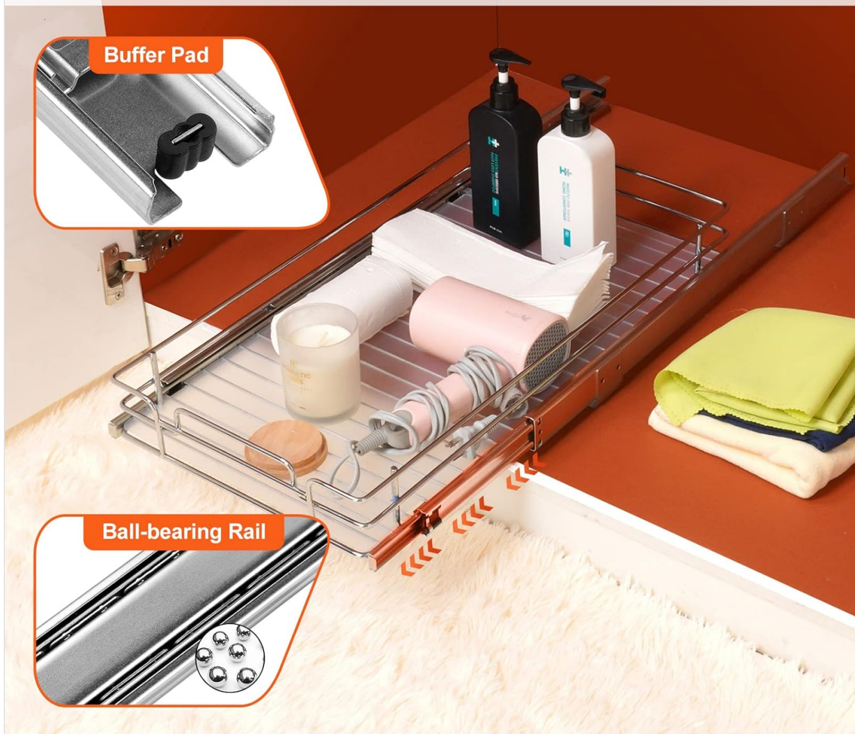
Figure 4: Smooth and Quiet Sliding Mechanism

Reaching into the shadowy depths of a cabinet