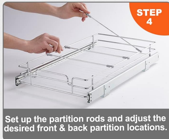
Figure 3: Quick & Simple Setup Steps

Your browser does not support the video tag.