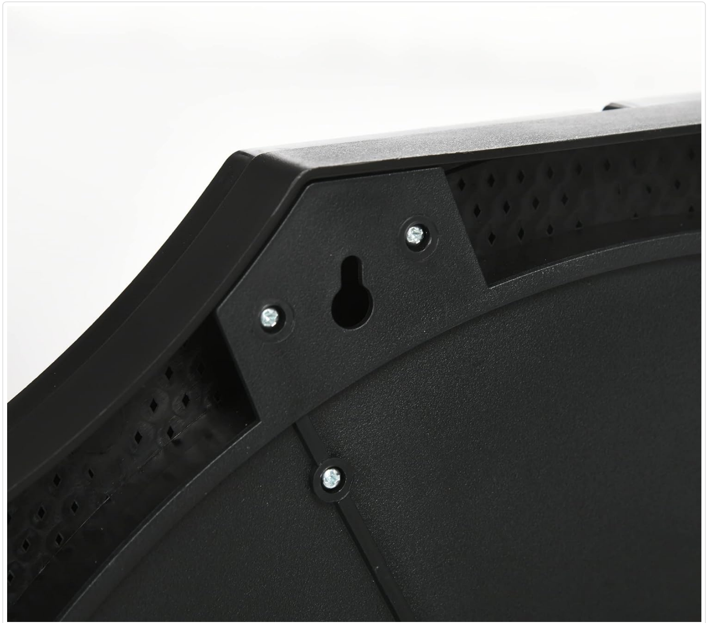
Image: This image shows a close-up of the keyhole-shaped mounting bracket located on the back of the dartboard, used for wall installation.