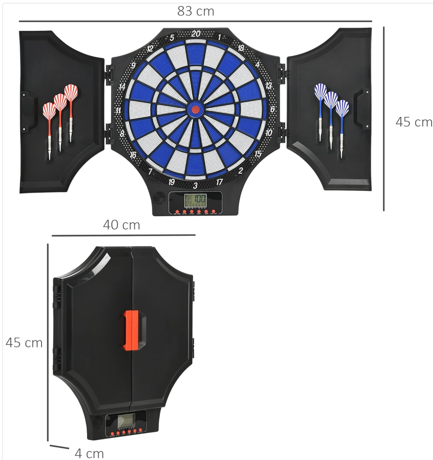
Image: A diagram illustrating the dimensions of the dartboard. When open, it measures 83 cm wide and 45 cm high. When closed, it measures 40 cm wide, 45 cm high, and 4 cm deep.