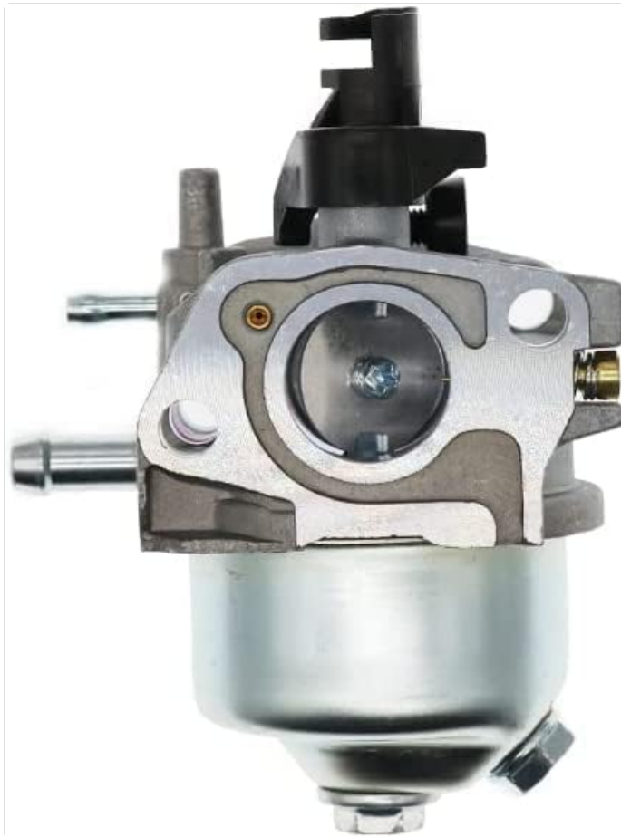
Image: Front view of the HQParts carburetor, highlighting the main body and adjustment screws. This perspective is useful for identifying key components during installation.