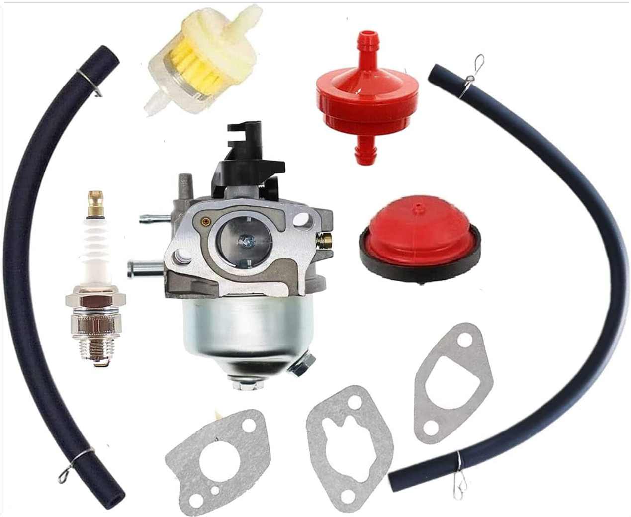
Image: A complete view of all components included in the kit: the carburetor, three gaskets, a primer bulb, two fuel filters, a spark plug, and a fuel line. This image helps verify that all parts are present.