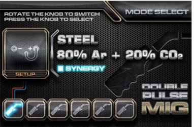
Double Pulse MIG(6 Modes)