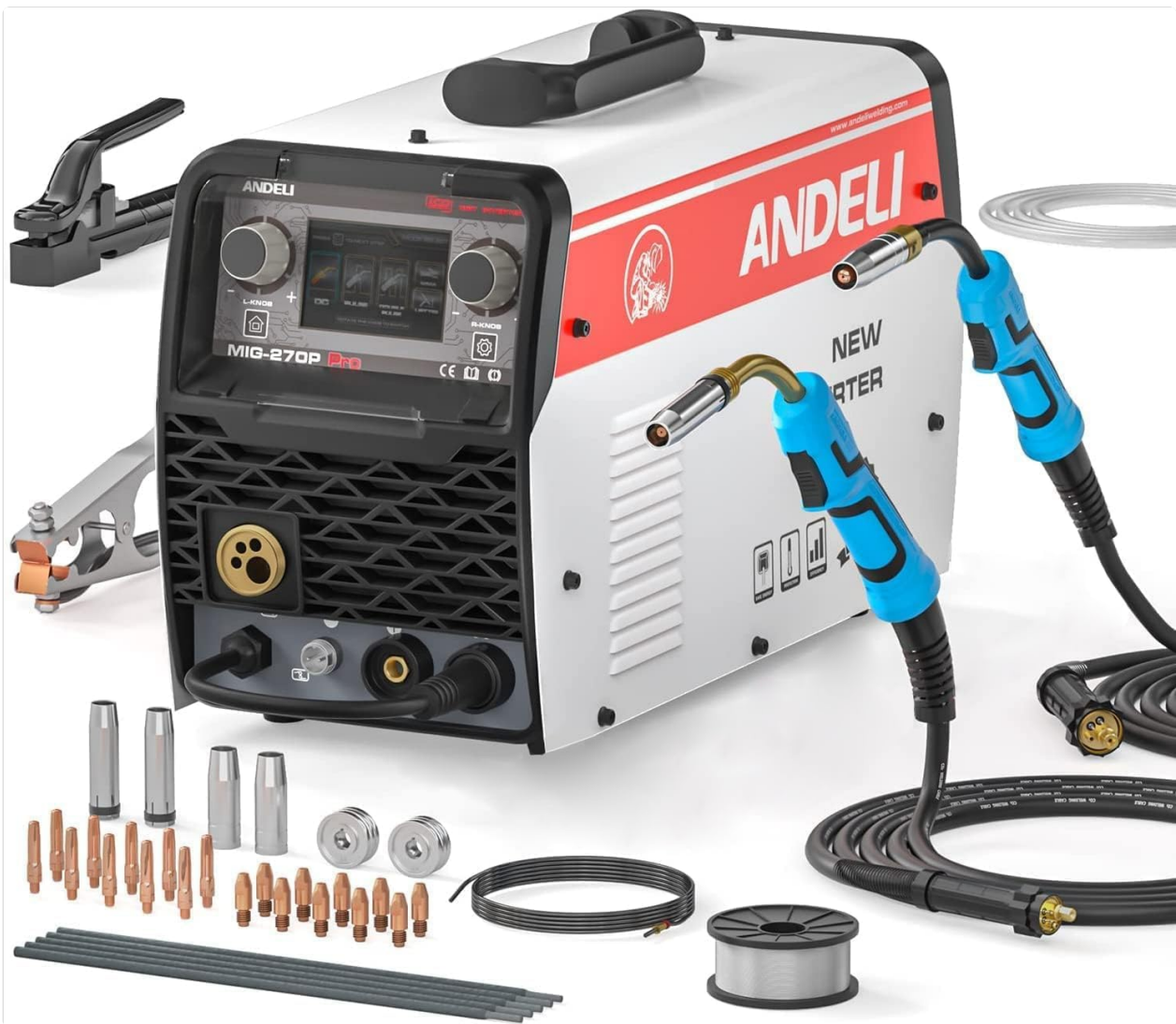
Figure 1.1: The ANDELI MIG-270P PRO Welder with included accessories, showcasing its compact design and comprehensive setup.