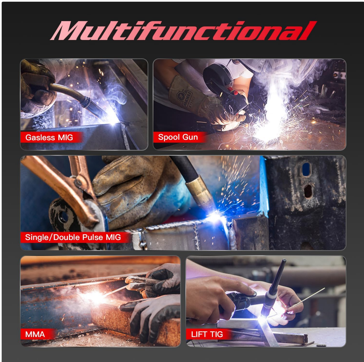
Figure 3.1: The ANDELI MIG-270P PRO, emphasizing its Double Pulse MIG welding capability and other modes.