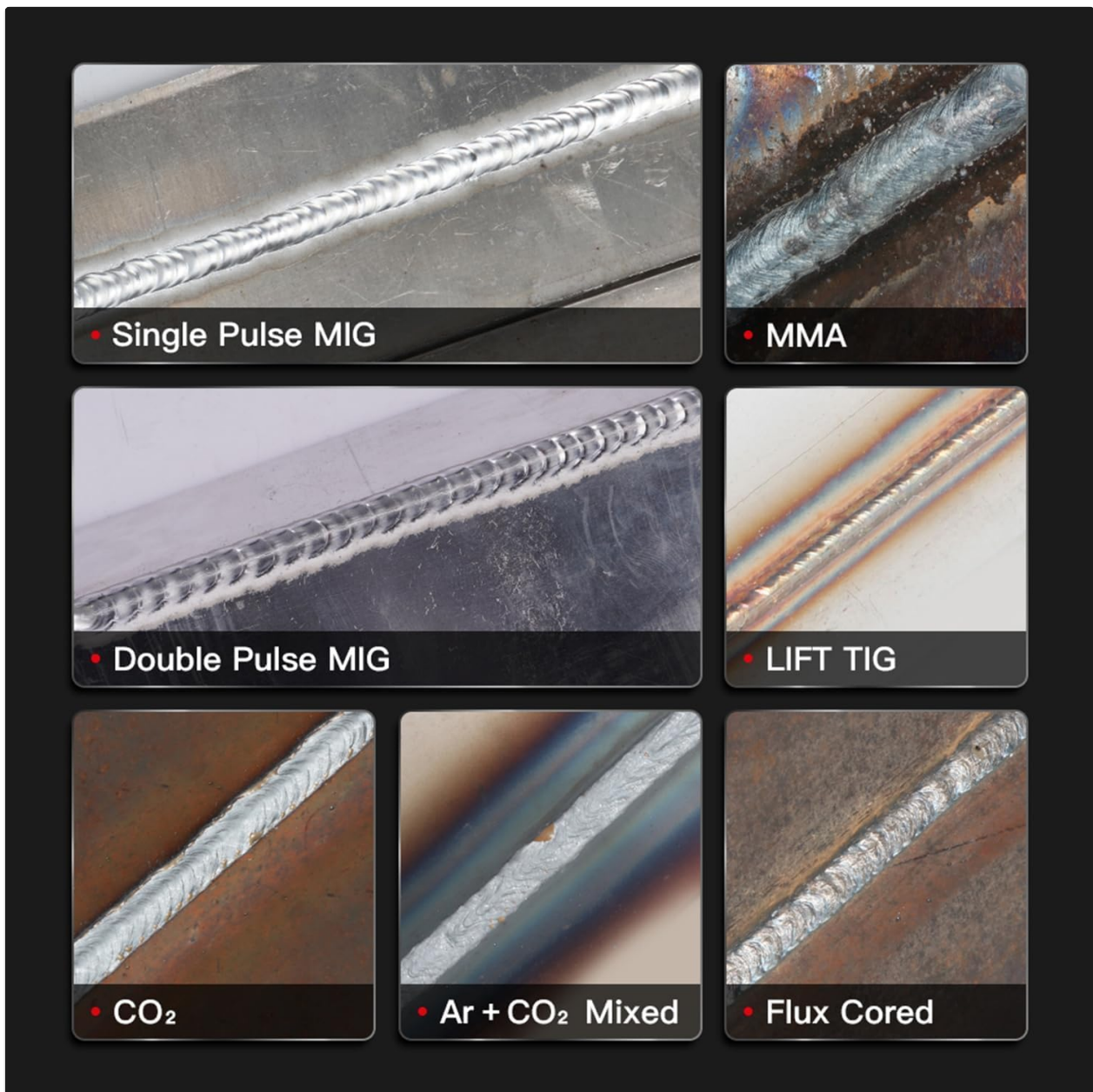
Figure 6.3: Visual examples of weld beads produced by different MIG welding techniques, including single and double pulse.