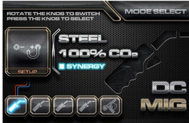
DC MIG(5 Modes)

LCD Screen, Simple Panel Easy To Understand