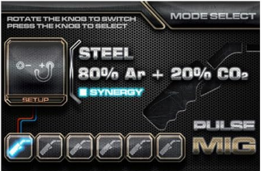
Pulse MIG(6 Modes)