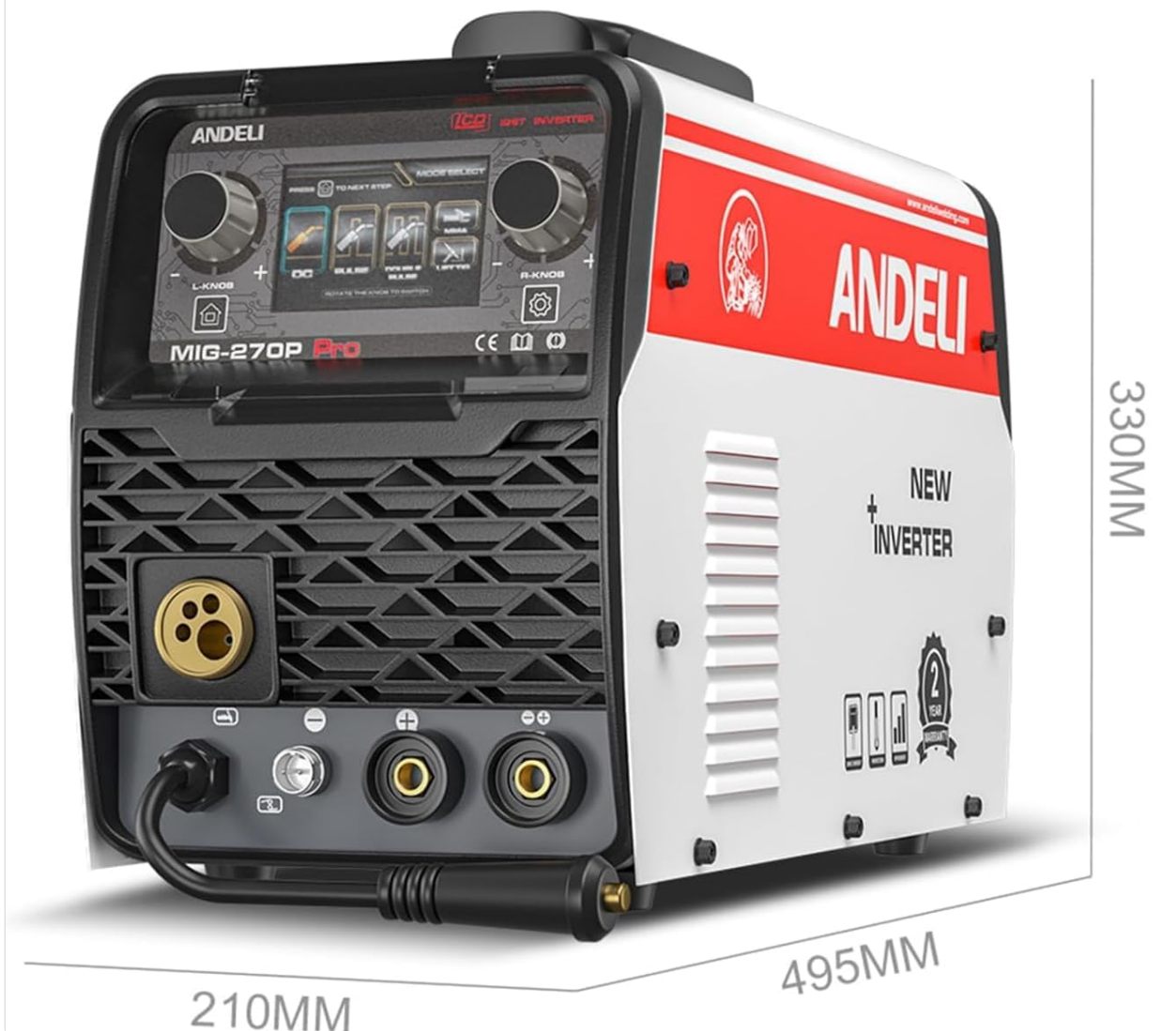
Figure 5.1: Dimensions of the MIG-270P PRO welder, useful for planning workspace and setup.