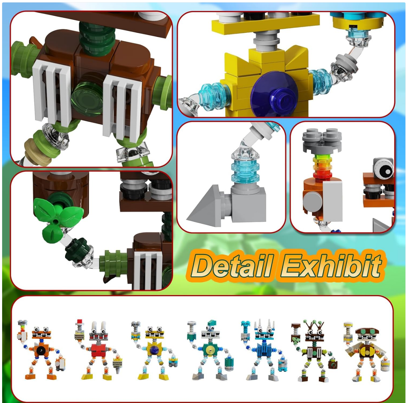
Image: Detailed views of individual building block components, showing their design and how they connect.