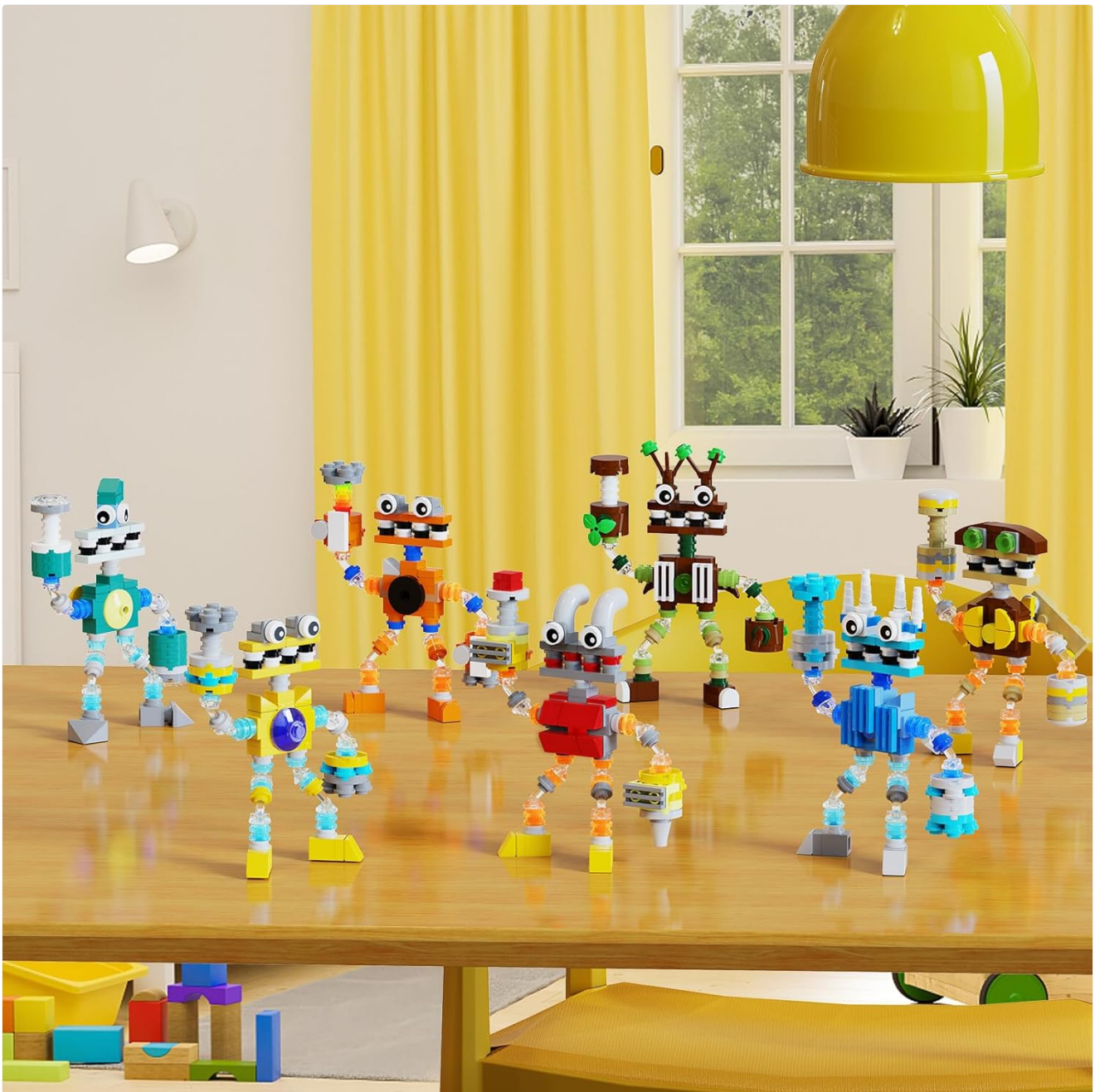
Image: Assembled Wubbox Monster Friends figures displayed on a table, ready for play or decoration.