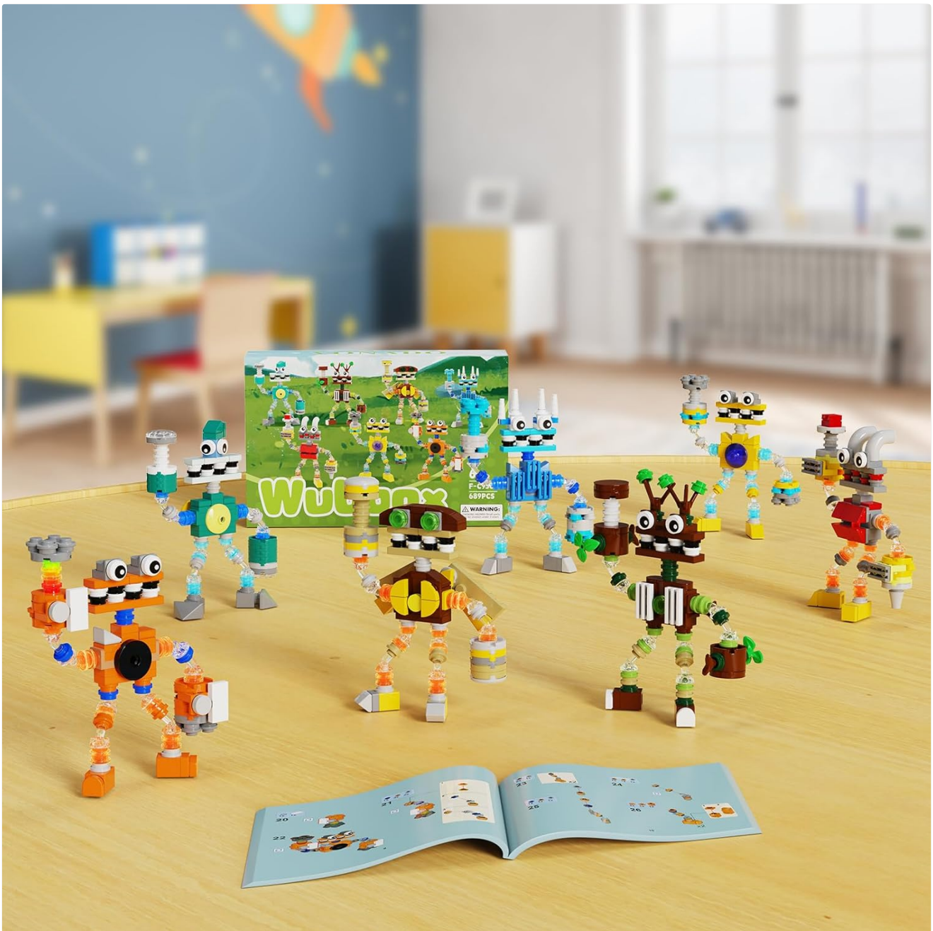
Image: The building set box and an open instruction booklet, demonstrating the assembly process for the monster figures.