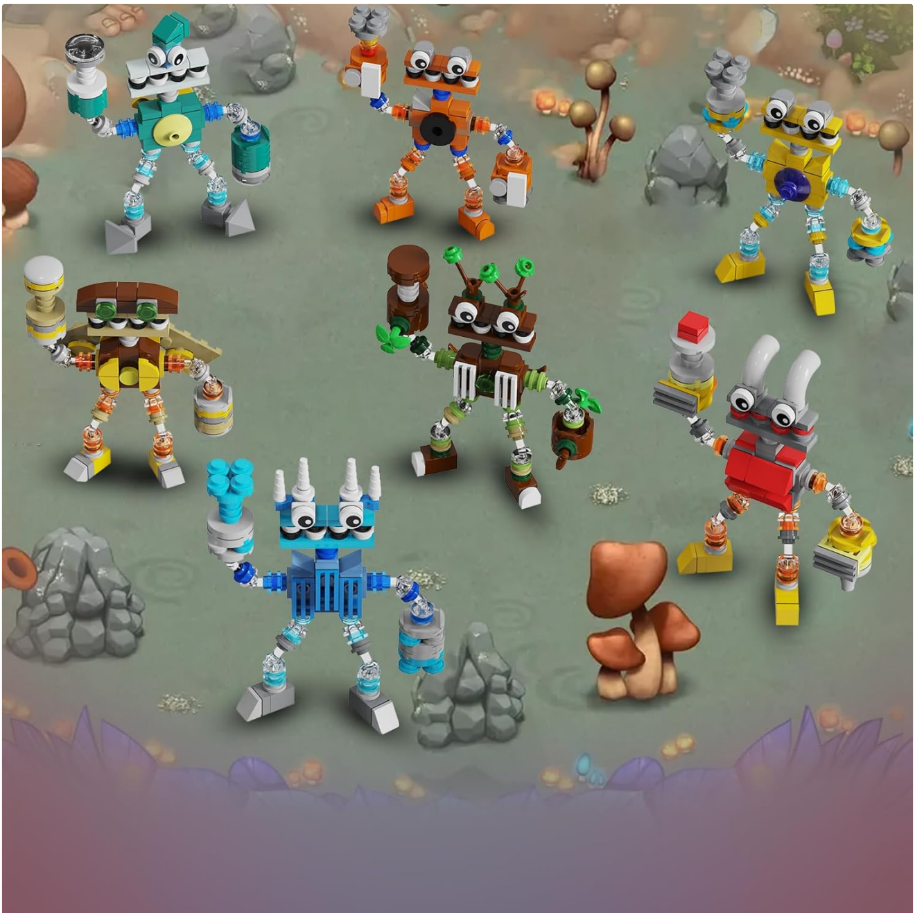
Image: The complete set of seven Wubbox Monster Friends figures, showcasing their diverse designs and colors.