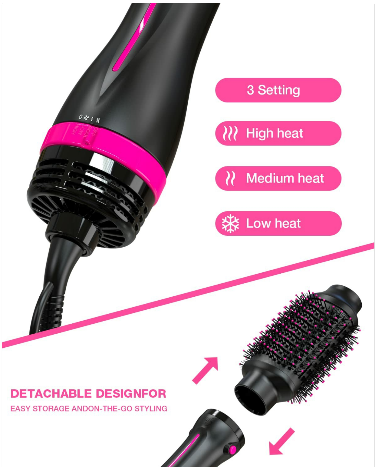
Image: Close-up of the handle showing the 3 heat settings (High, Medium, Low) and the detachable brush head.