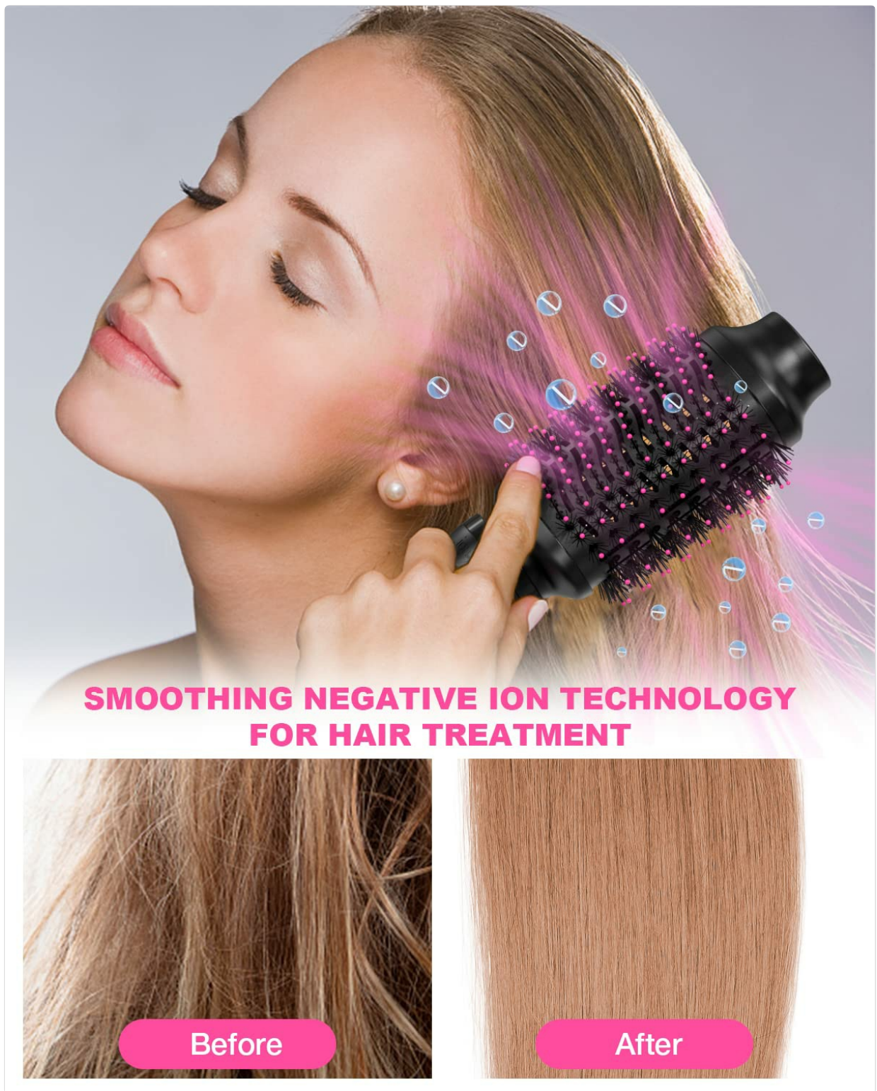
Image: A visual representation of the smoothing negative ion technology in action, showing hair before and after treatment for reduced frizz.