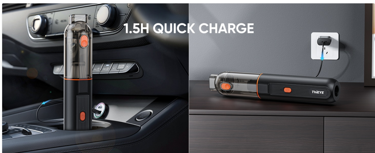
Image: ThiEYE VK Air charging in a car and connected to a wall adapter at home.