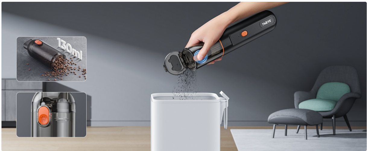
Image: Demonstration of emptying the dust bin with a single button press.