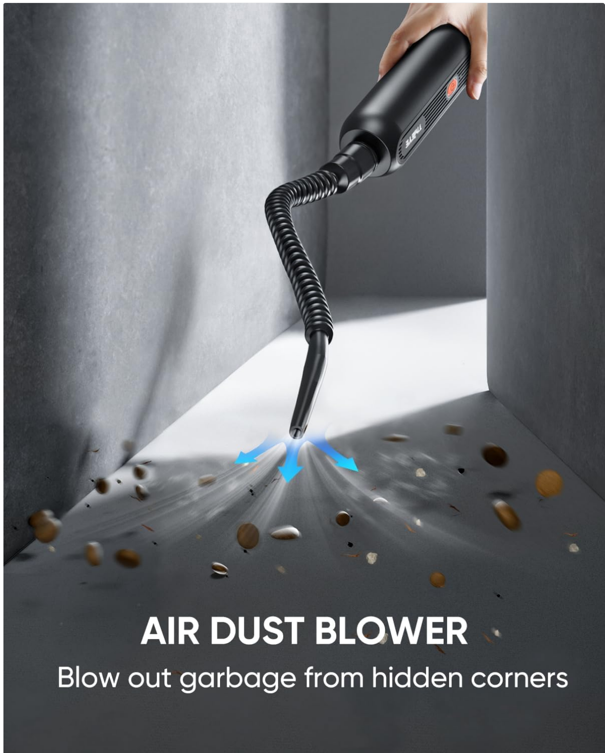
Image: ThiEYE VK Air used as an air blower to clear debris from a corner.