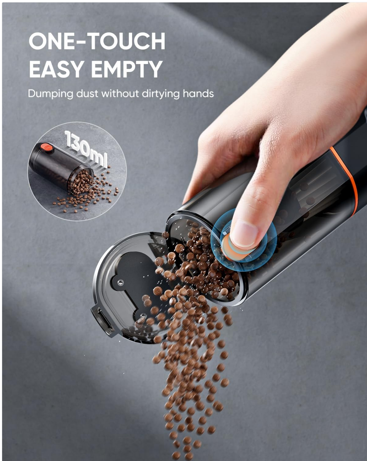
Image: Hand emptying the dust collection bin of the ThiEYE VK Air.