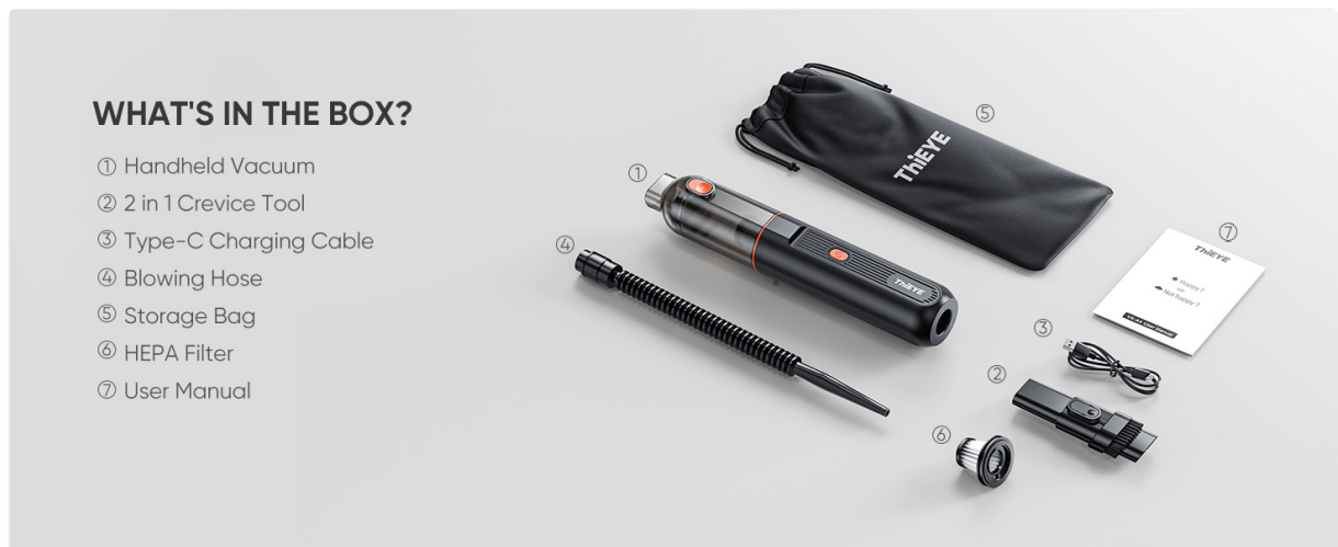
Image: Contents of the ThiEYE VK Air package, including the vacuum, 2-in-1 crevice tool, Type-C charging cable, blowing hose, storage bag, HEPA filter, and user manual.