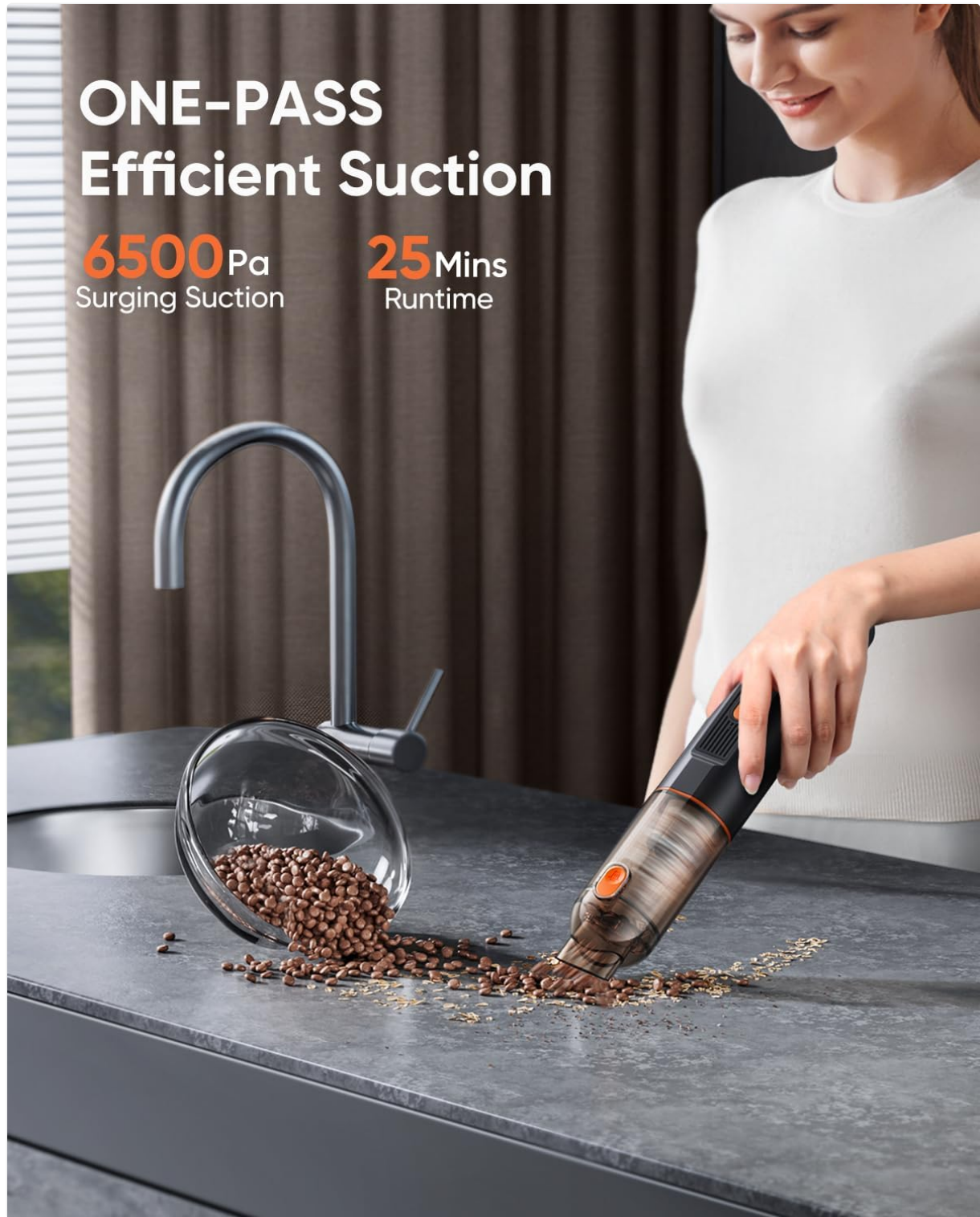
Image: ThiEYE VK Air vacuuming spilled coffee beans on a kitchen counter.

Attach the desired nozzle (e.g., 2-in-1 crevice tool) to the front suction port. Turn on the device and move the nozzle over the area to be cleaned. The powerful 6500Pa suction will collect dust and debris.