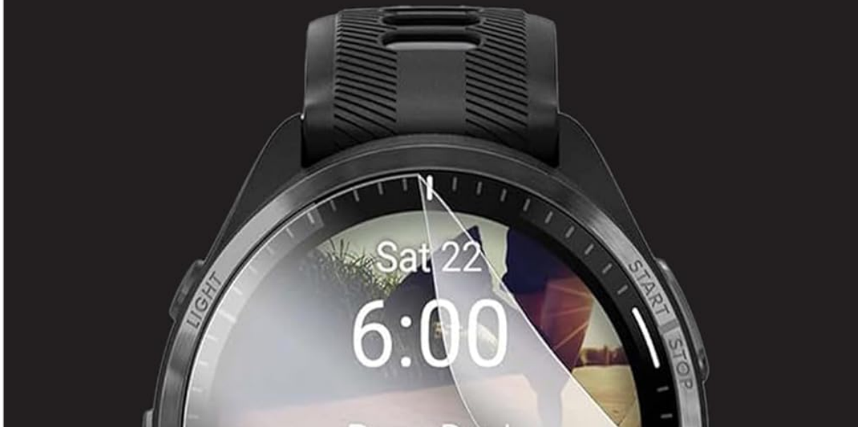
Image: Four-layer protection system of the IQShield film.

IQShield screen protectors are made using high quality TPU film. The film is flexible allowing it to adhere to the curved or round edges of any devices.