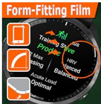
Image: Form-fitting film for edge-to-edge coverage.