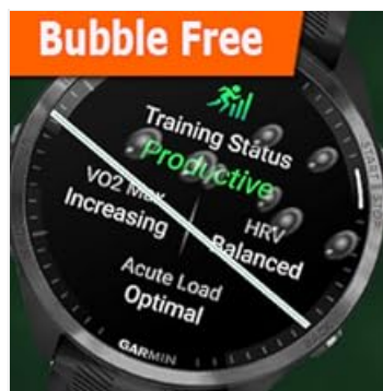
Image: Illustration of bubble-free application.