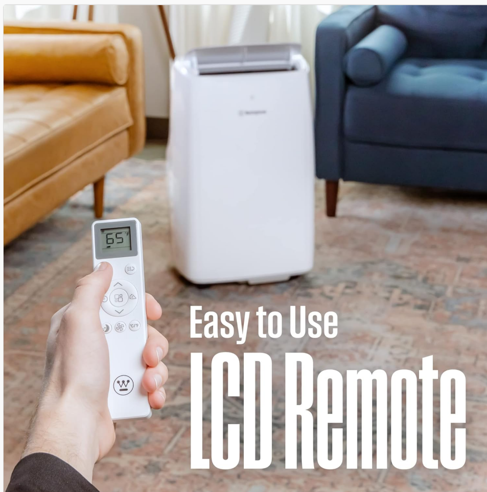
Figure 2: Remote Control

A remote control is included for convenient operation from a distance. It allows adjustment of temperature, fan speed, mode, and other functions.