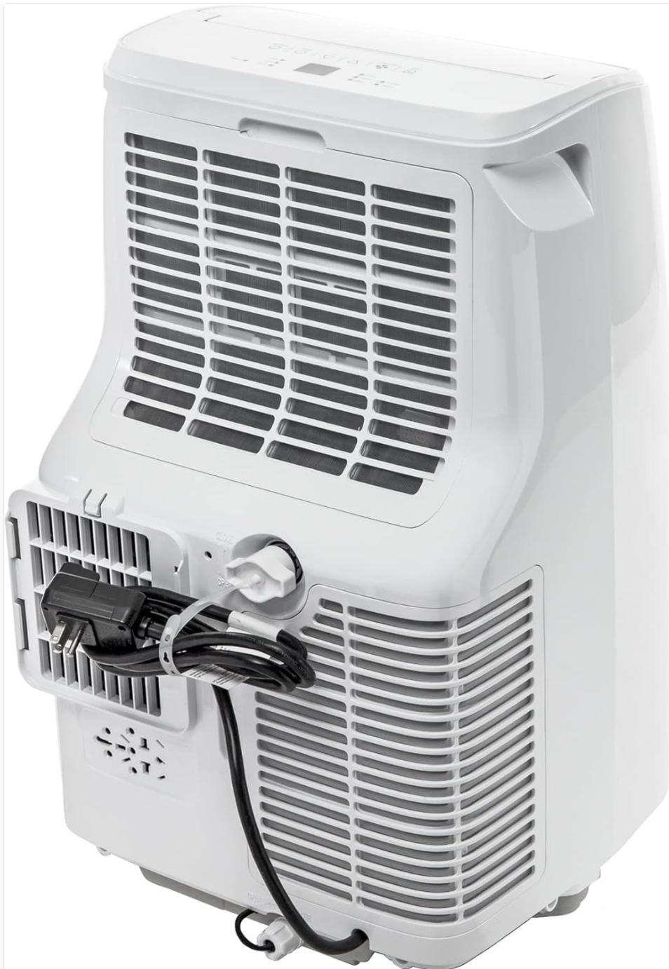
Figure 5: Rear View with Drain Port

Video 1: Demonstrates how to set up the continuous drainage for the Westinghouse portable air conditioner, showing the hose connected to the unit and draining into a bucket.