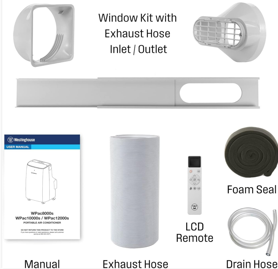
Figure 3: Included Accessories