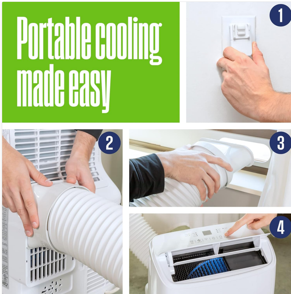
Figure 4: Installation Steps