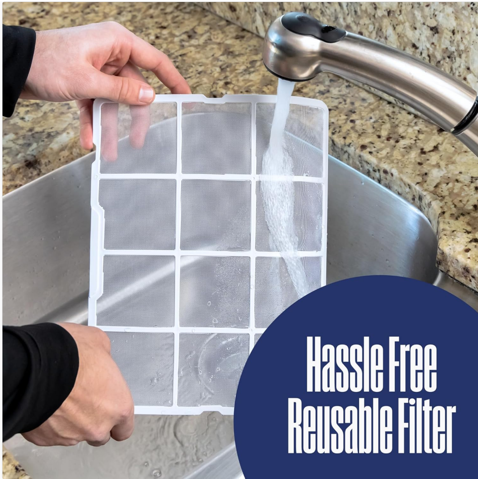
Figure 7: Cleaning the Reusable Filter