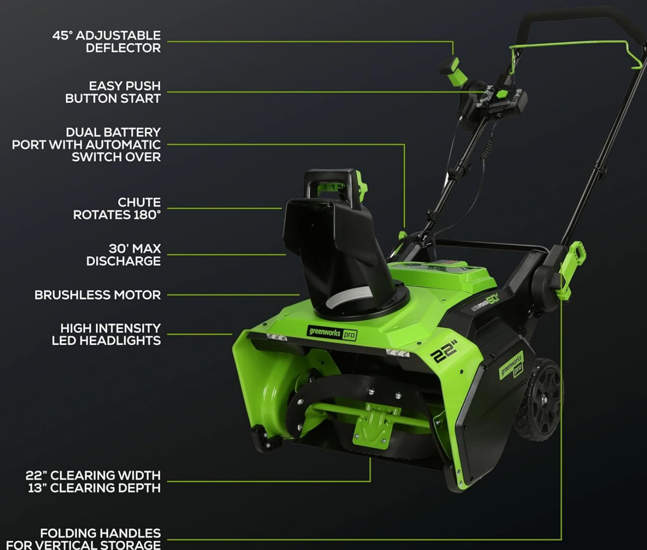
Figure 1: Front view of the Greenworks Pro 60V 22" Cordless Snow Blower, highlighting features such as the adjustable deflector, push button start, dual battery port, rotating chute, max discharge, brushless motor, LED headlights, clearing width/depth, and folding handles.