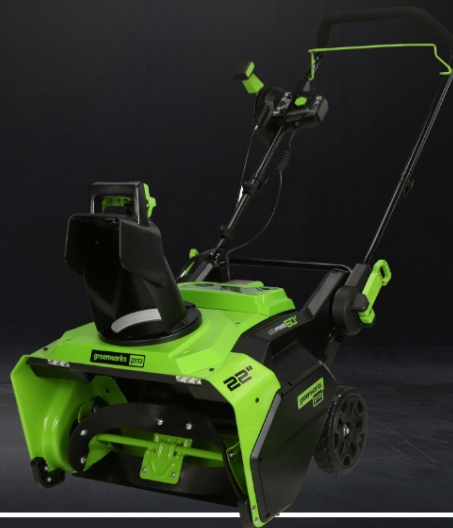
Figure 2: The Greenworks 22" Snow Thrower in operation, demonstrating its snow clearing capability.