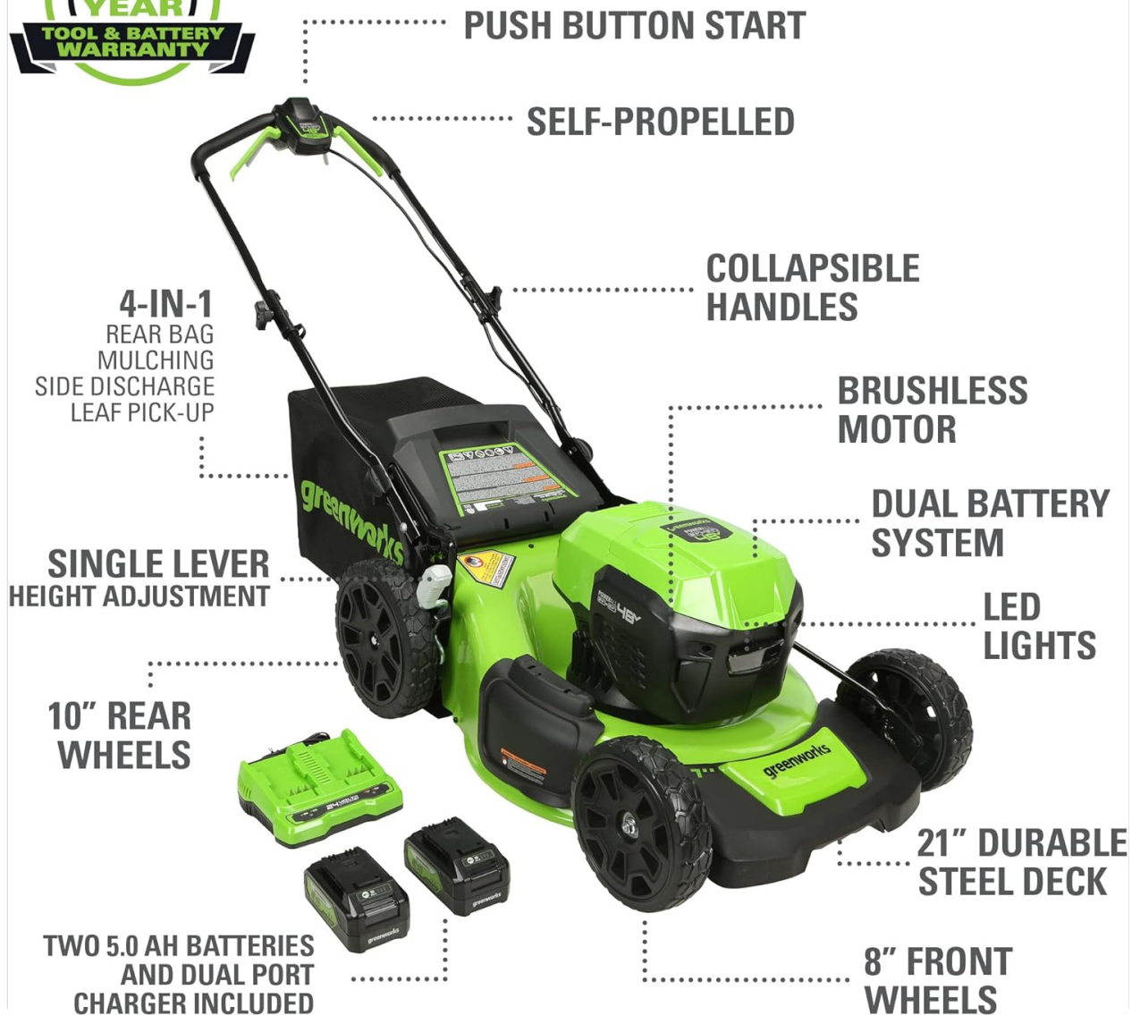
Figure 2: Dual battery system on the Greenworks lawn mower.