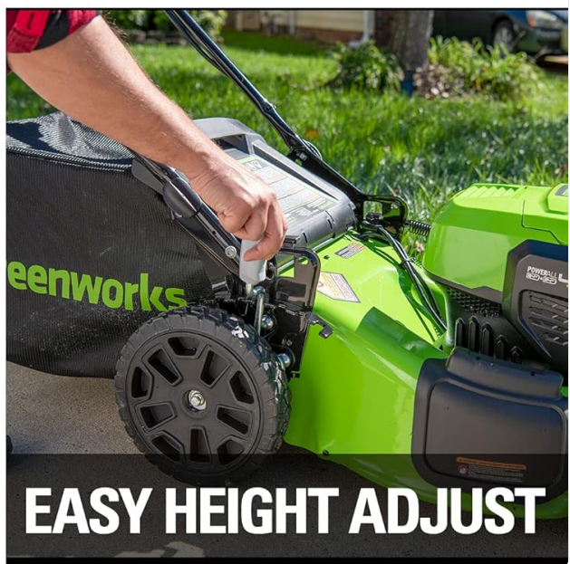
Figure 5: 4-in-1 Mowing Versatility.