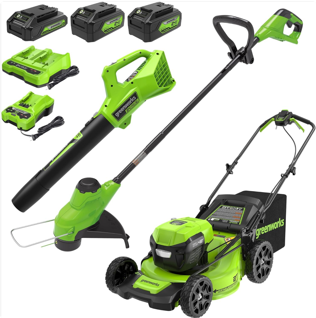
Figure 1: Greenworks 48V Cordless Yard Tool Combo components.