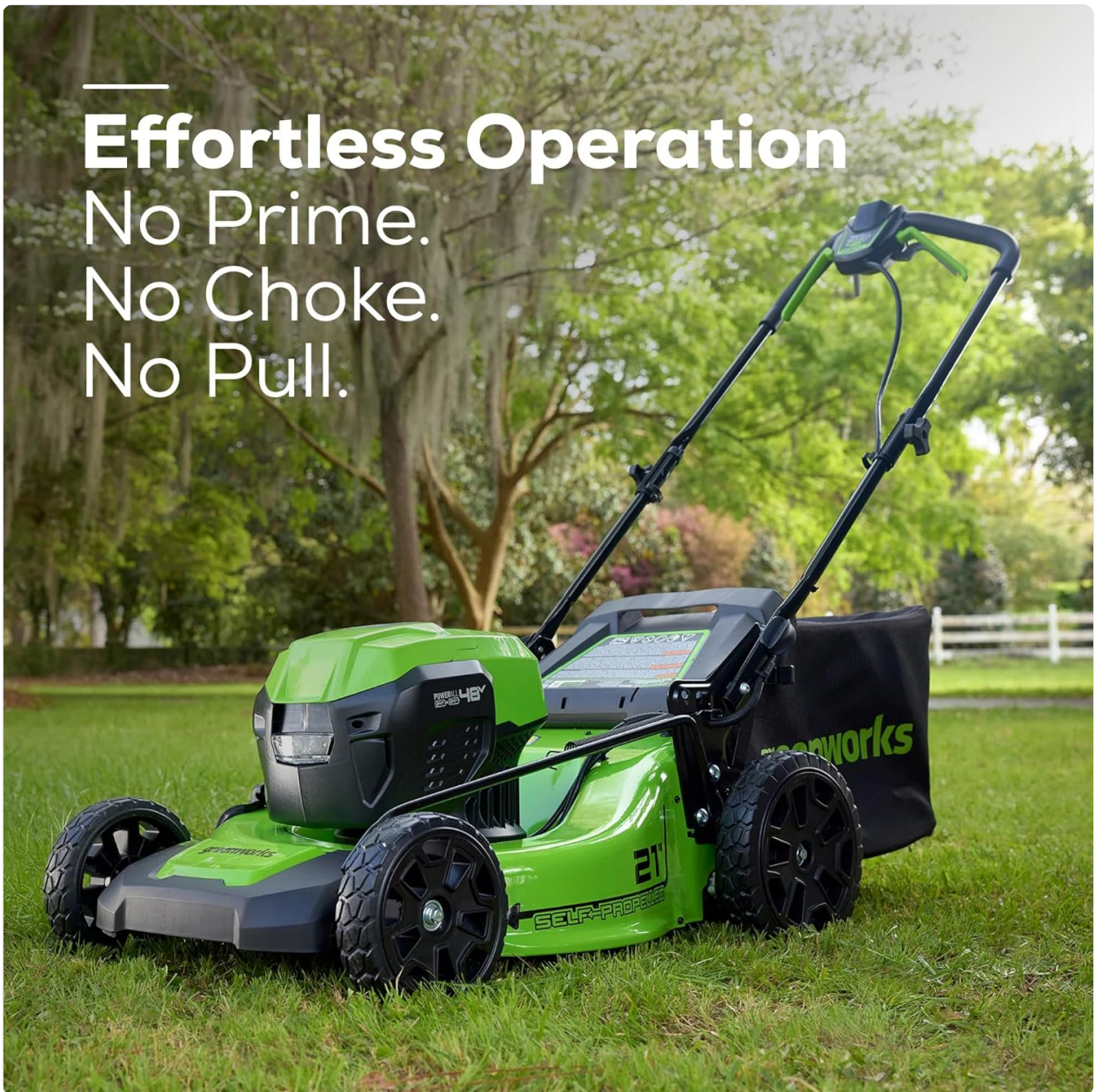
Figure 6: Greenworks mower with LED headlights for enhanced visibility.