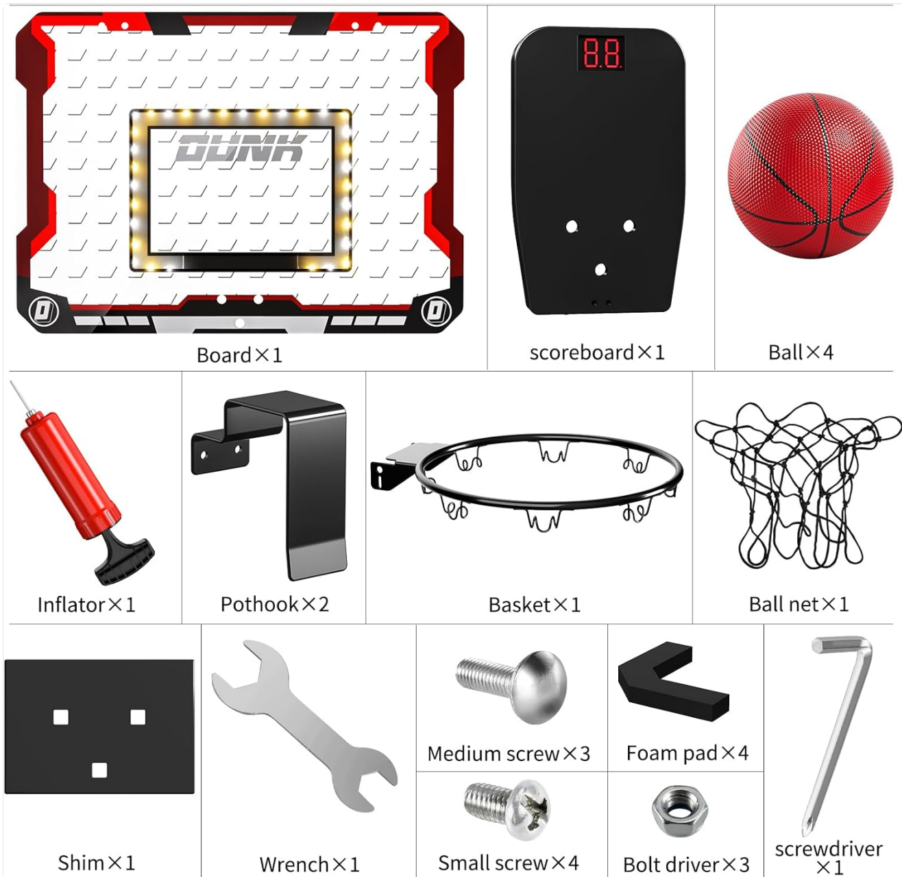
Figure 1: All components included in the TEMI Indoor Basketball Hoop package, including the backboard, rim, net, mini basketballs, pump, and assembly hardware.