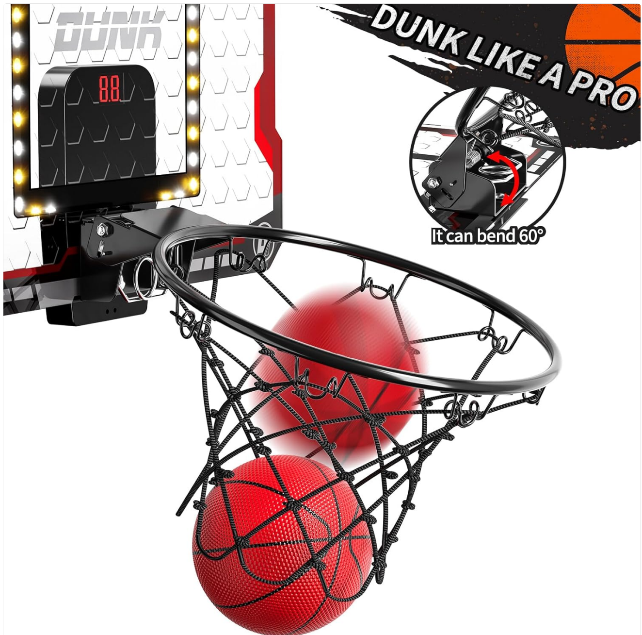
Figure 4: The breakaway rim in action, demonstrating its flexibility and spring-back mechanism for realistic dunking.