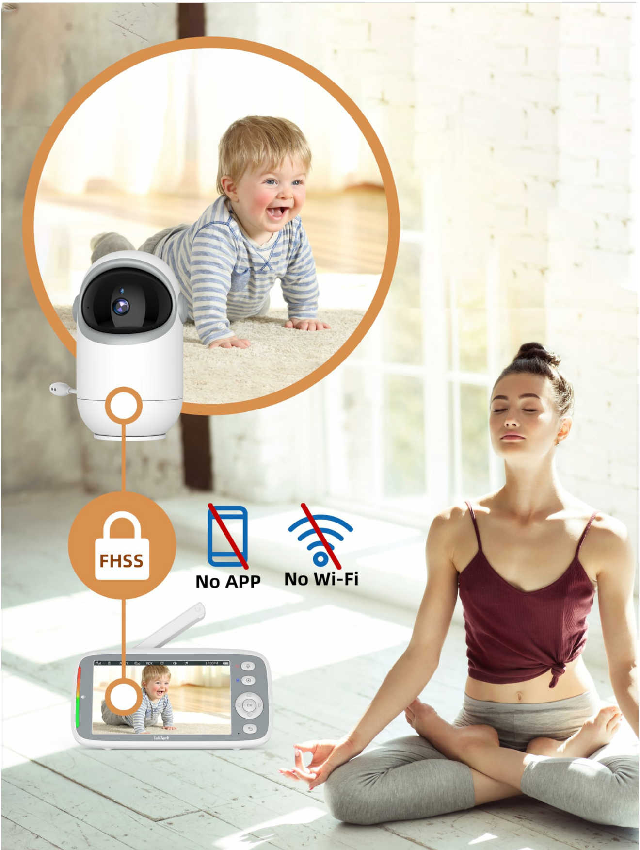
Image: This illustration highlights the secure, private connection of the monitor, emphasizing that it operates without Wi-Fi or a mobile application, using FHSS technology.