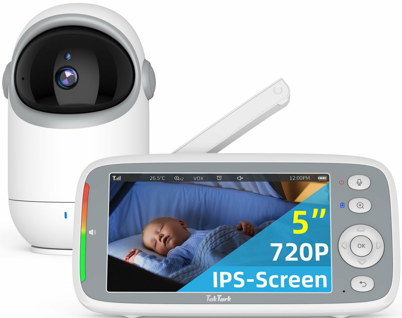
Image: The TakTark BM813 Baby Monitor system, featuring the camera unit and the 5-inch parent monitor with a clear display.