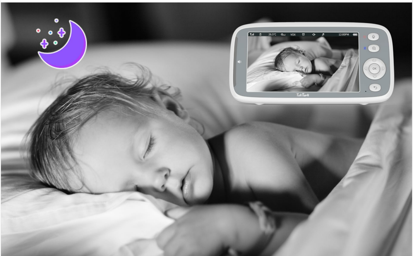
Image: This visual demonstrates the digital zoom feature, showing how to magnify the view of your baby up to 3 times for a closer look.