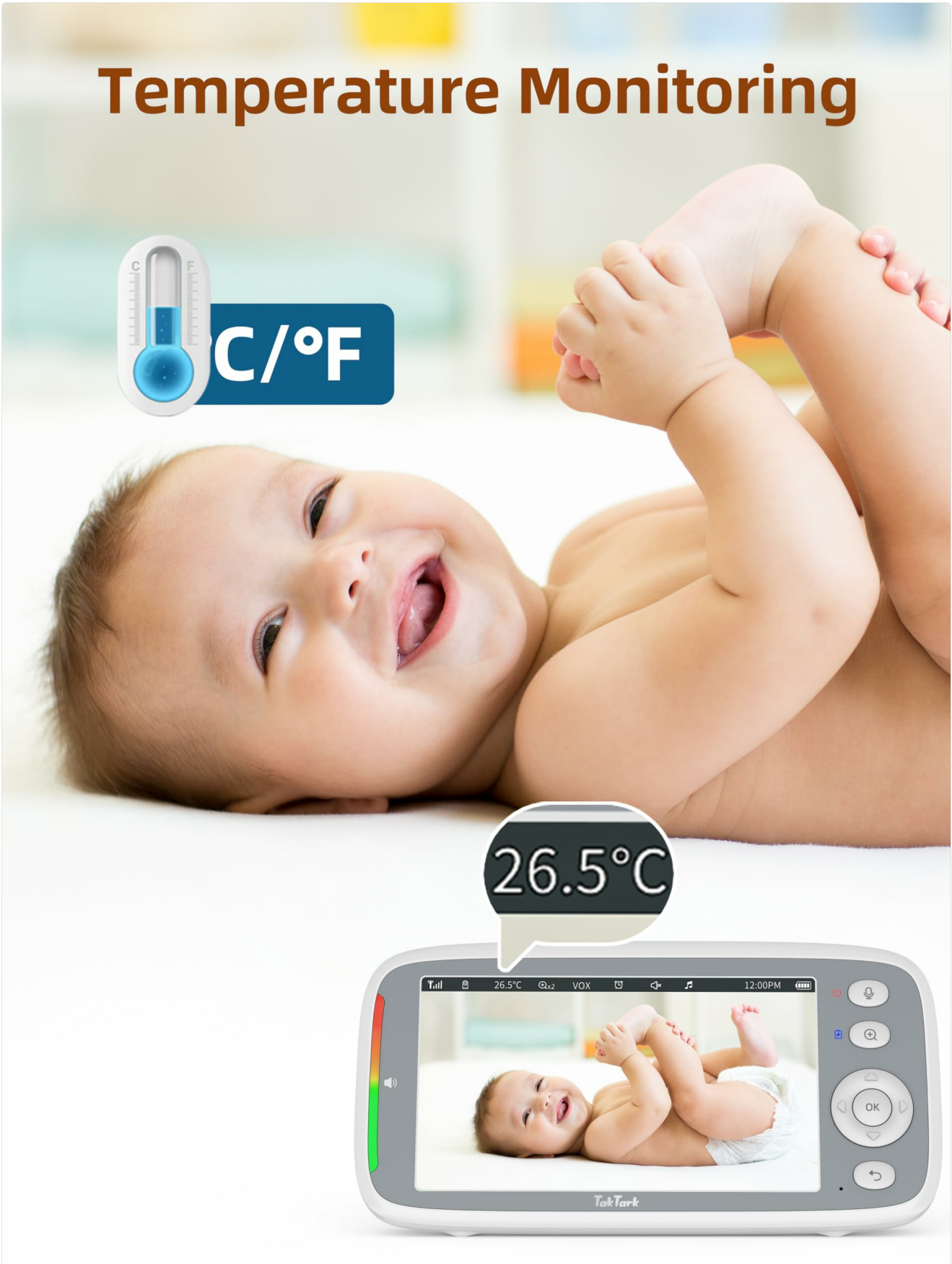
Image: This image highlights the temperature monitoring feature, displaying the room temperature on the monitor to help maintain a comfortable environment for the baby.