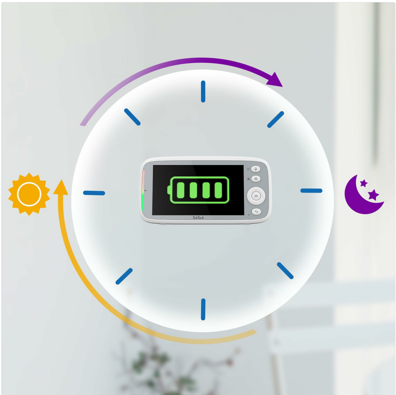
Image: This graphic illustrates the monitor's battery life, showing its capability to last through day and night, especially when utilizing power-saving features like VOX mode.