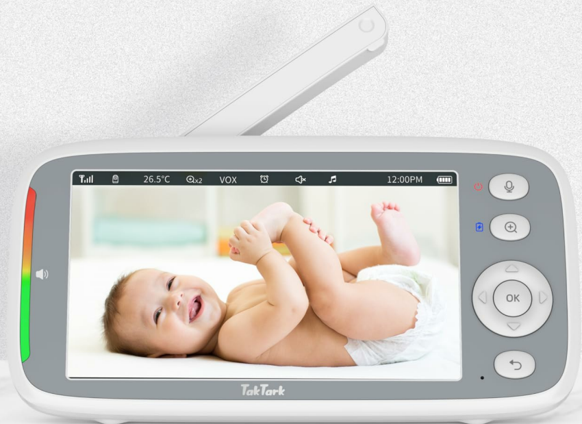
Image: Visual representation of the monitor's core features including night vision, VOX mode, security, temperature monitoring, feeding reminders, and two-way intercom.