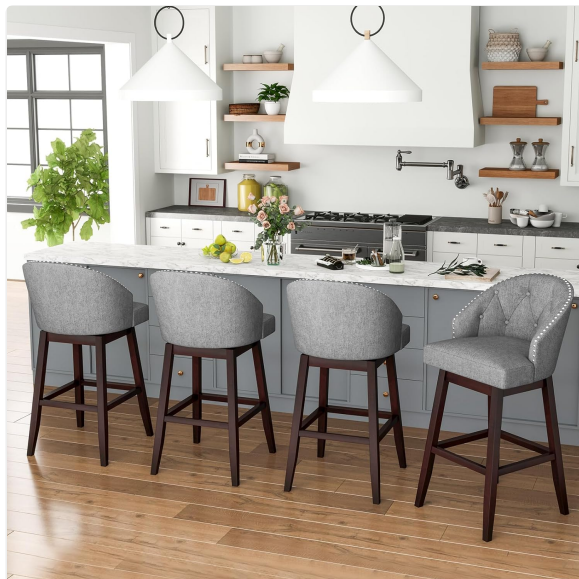
Image 1.4: Bar stools suitable for various applications, such as kitchen islands.