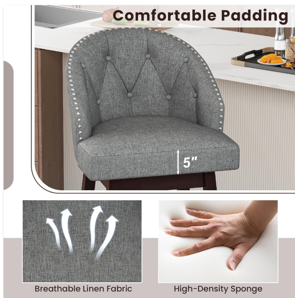
Image 1.2: Comfortable padding with breathable linen fabric and high-density sponge.