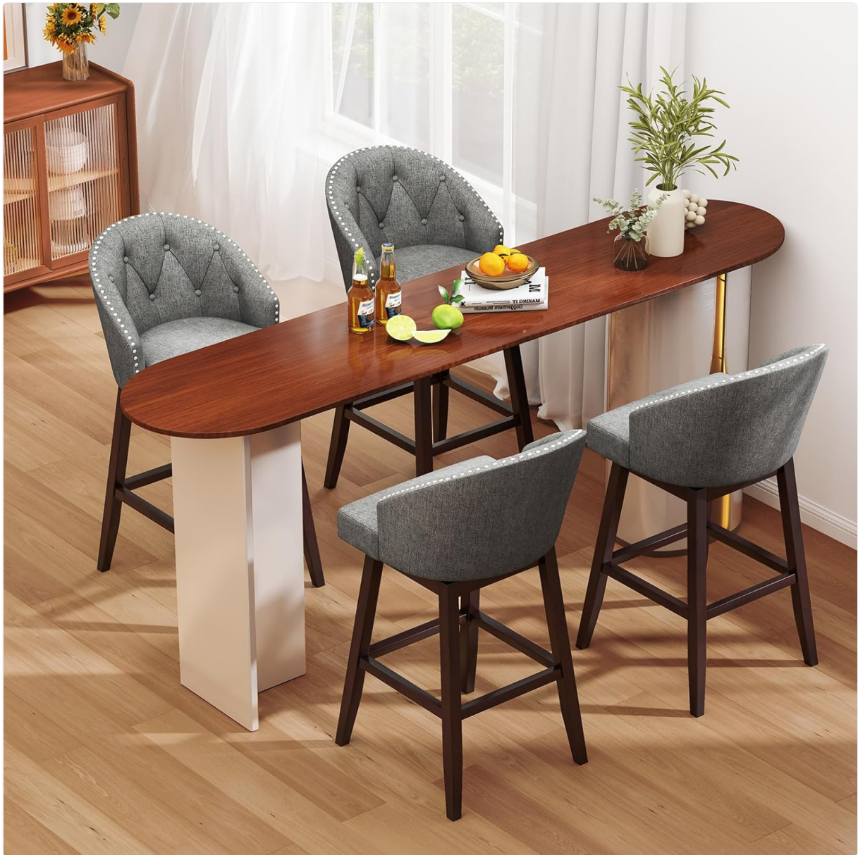
Image 1.1: Overview of the COSTWAY 31-inch Swivel Bar Stools in a home setting.