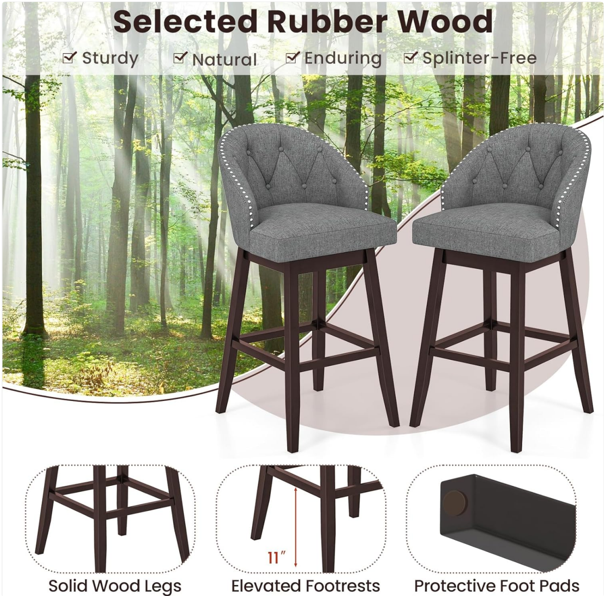
Image 4.1: Detail of the solid rubber wood structure and protective foot pads.