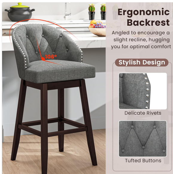
Image 1.3: Ergonomic backrest with stylish tufted design and rivets.