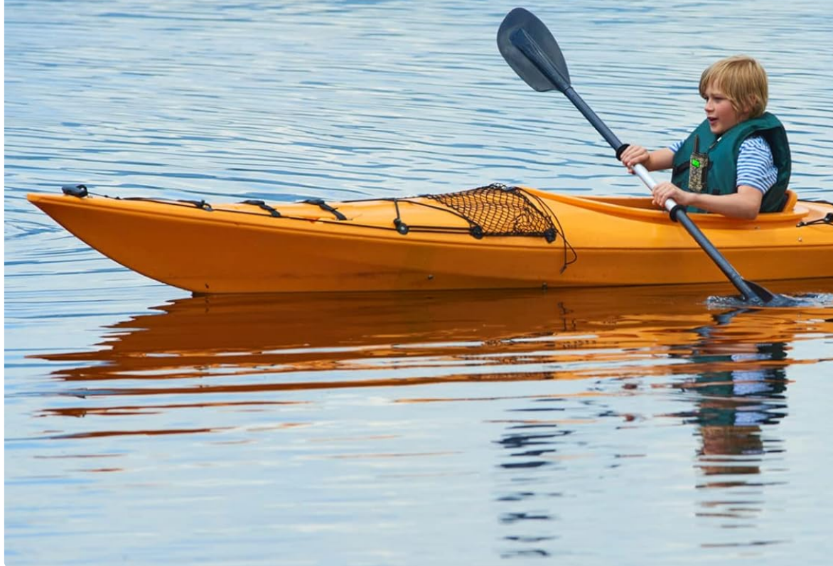
Figure 3: VOX Hands-Free Communication