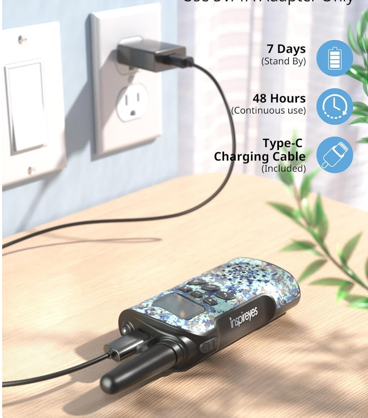
Figure 2: USB Type-C Charging

A full charge provides up to 48 hours of continuous use and 7 days of standby time.