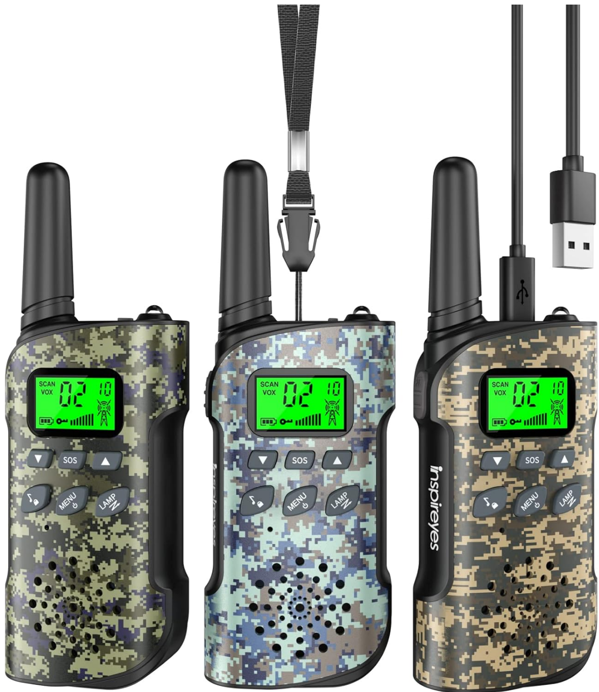
Figure 1: Inspireyes GL-528 Mini Ranger Walkie Talkies (3-pack)