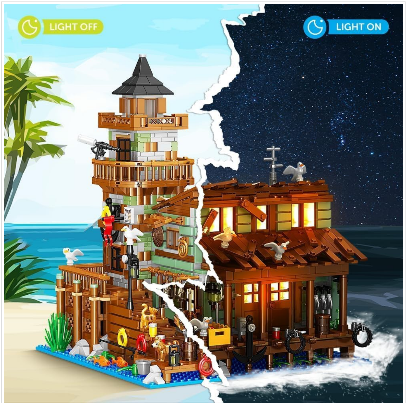
Image: A visual comparison of the building toy in daylight without lights and at night with its LED lights activated, demonstrating the warm glow created by the lighting system.