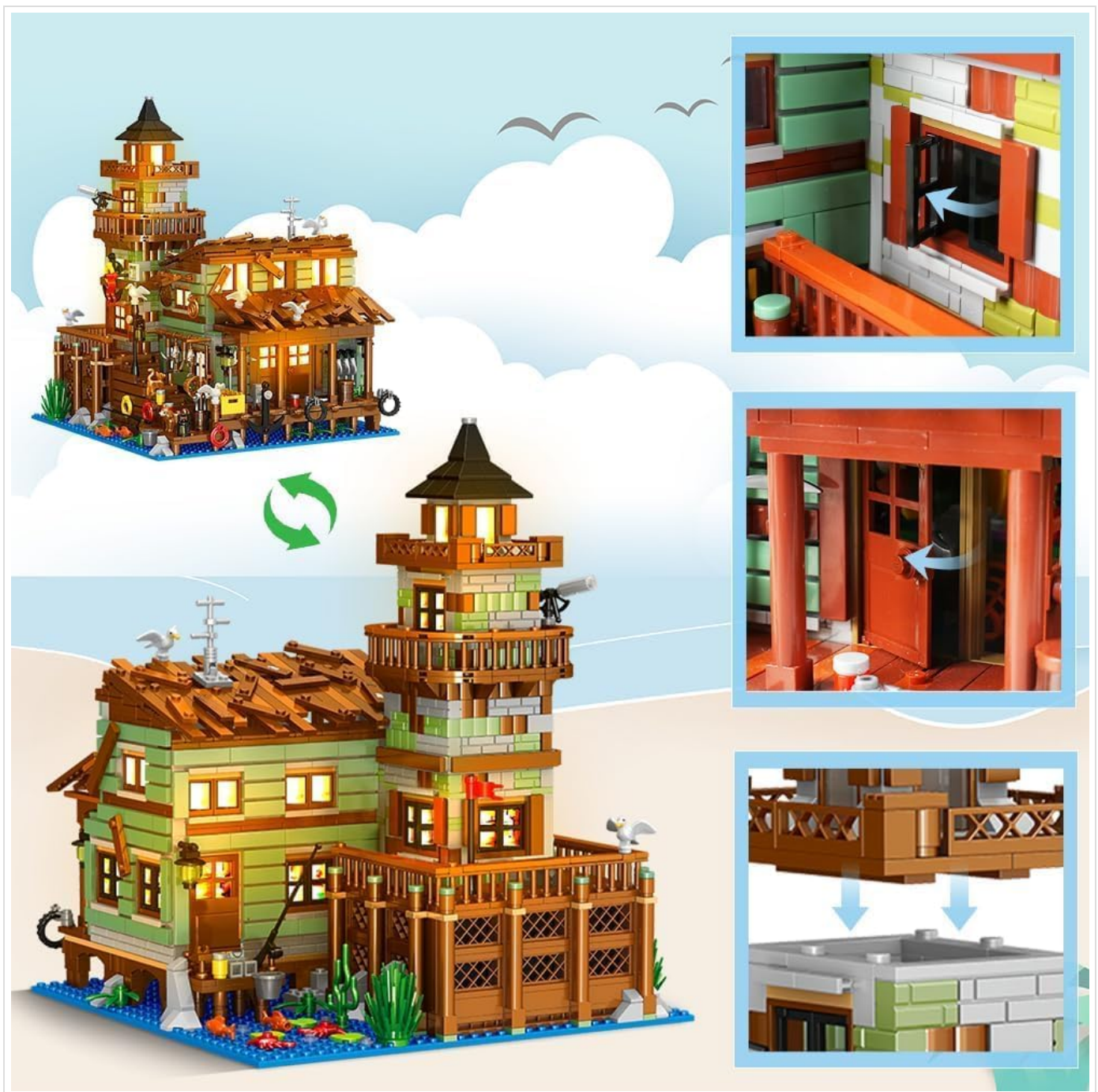
Image: Detailed views of the assembled model, showcasing intricate interior elements like a shop counter and various fishing tools, as well as exterior decorative pieces that simulate marine flora.