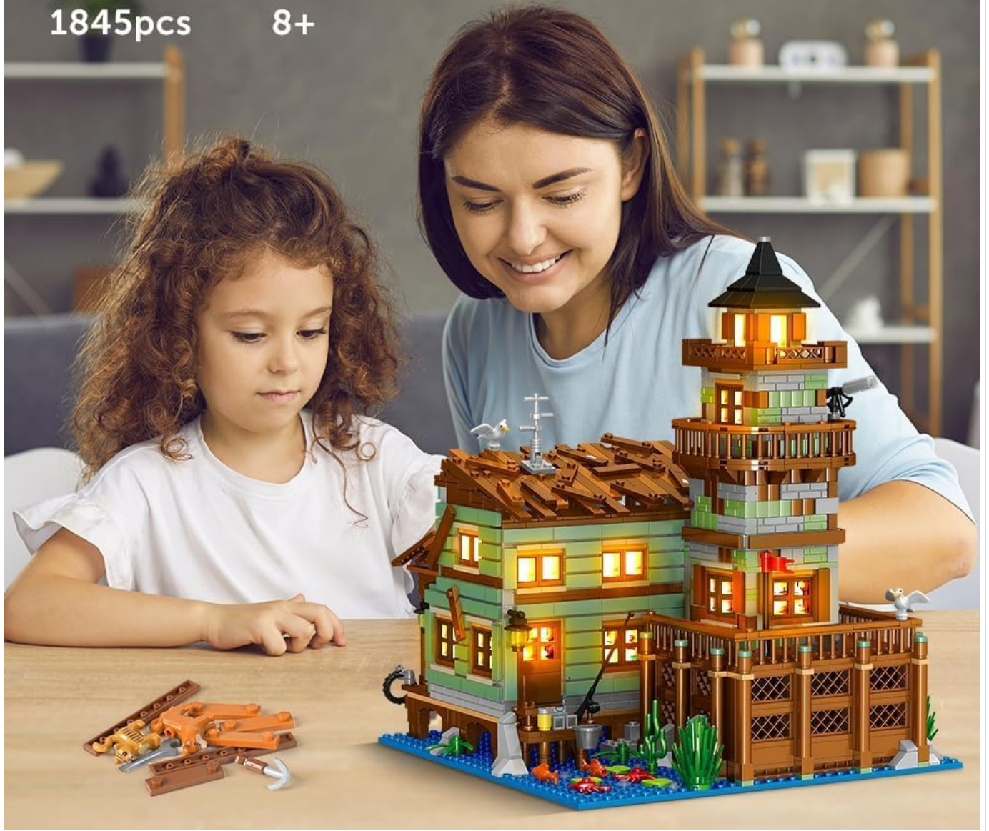
Image: An adult and child engaged in the assembly of the building toy, illustrating the collaborative and educational aspect of the construction process.