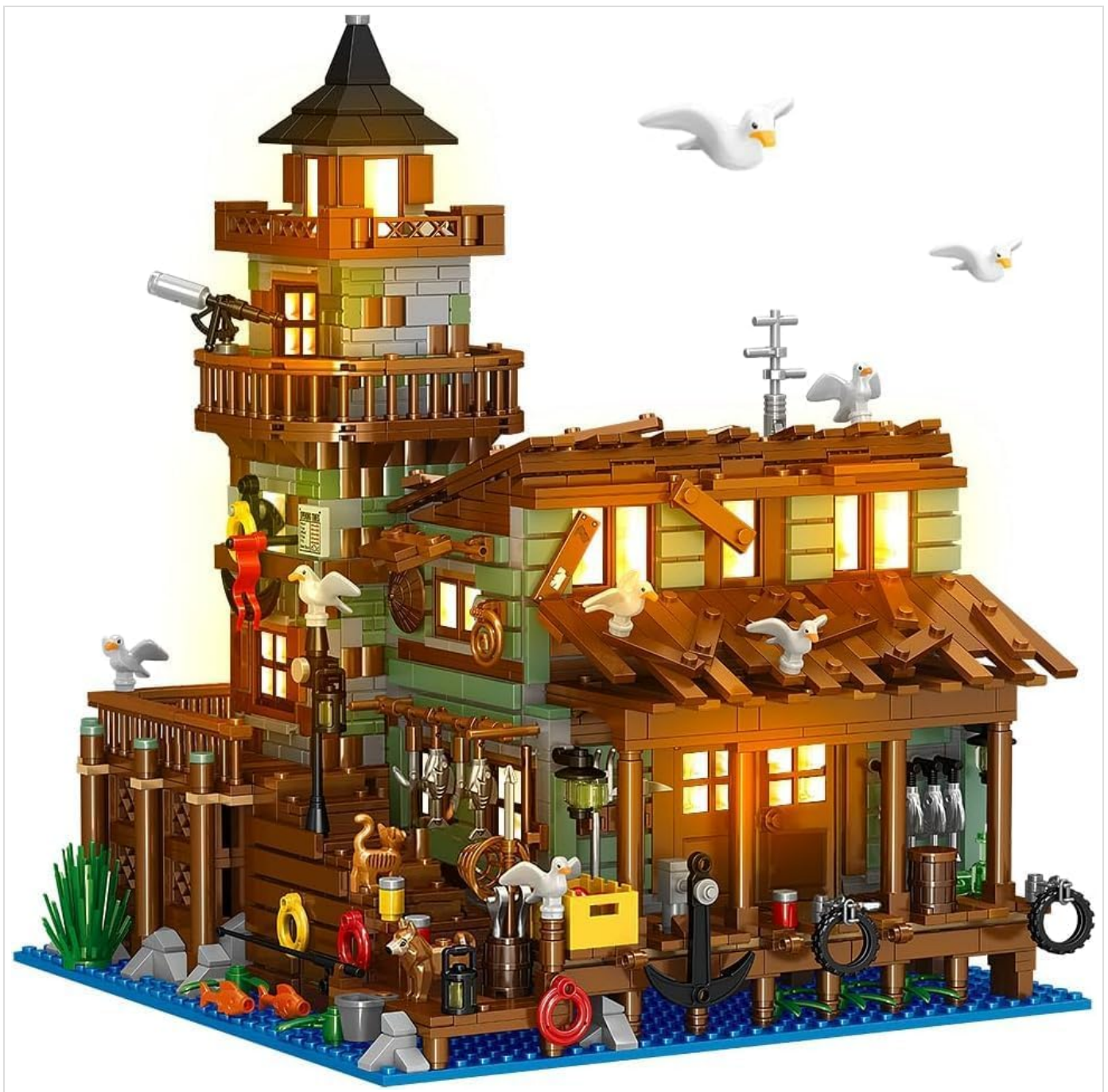
Image: The completed INSOON Fishing Village Boutique House, illuminated by its integrated LED lights, showcasing its intricate design and various elements like the lighthouse, fishing gear, and marine life details.