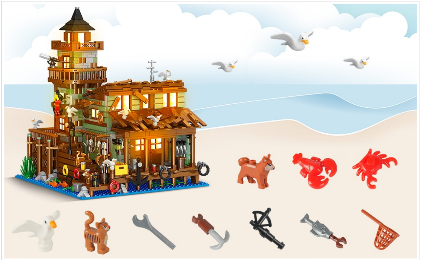
Image: A selection of the diverse accessory pieces included with the building set, such as animal figures and miniature tools, designed to enhance the model's realism.