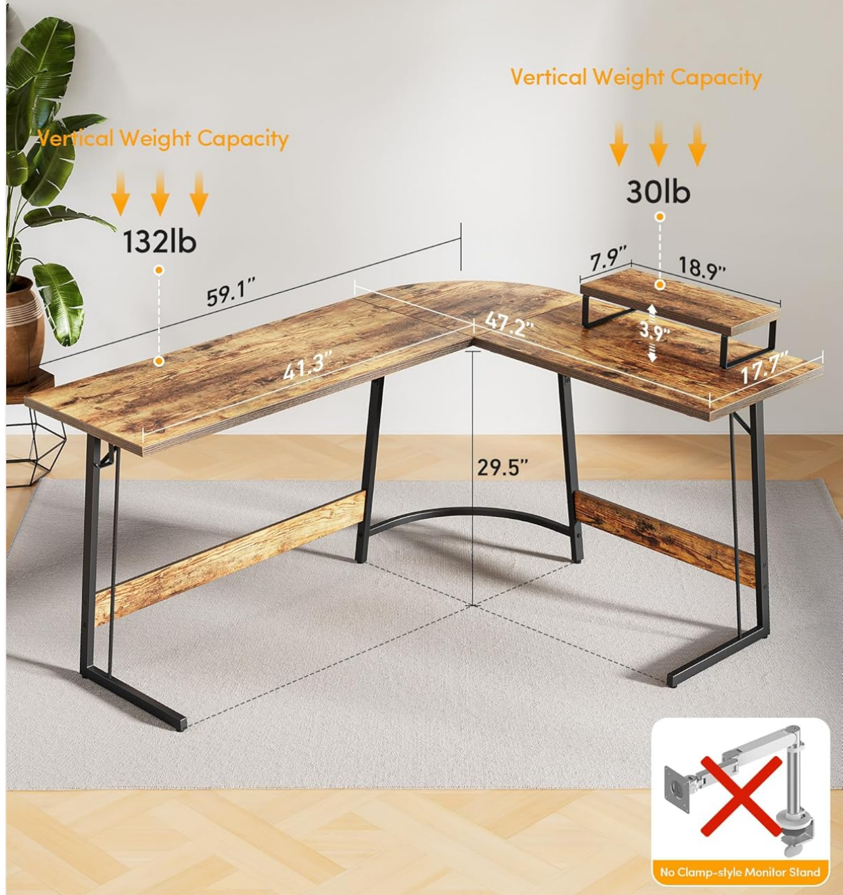
Figure 1: Product dimensions and weight capacities for the CubiCubi L Shaped Gaming Desk. The main desktop measures 59.1 inches by 41.3 inches on the longer side and 47.2 inches by 17.7 inches on the shorter side, with a height of 29.5 inches. The monitor stand is 18.9 inches wide and 7.9 inches deep, providing 3.9 inches of elevation. The main desktop supports up to 132 lbs, and the monitor stand supports up to 30 lbs. Note: This desk is not compatible with clamp-style monitor stands.