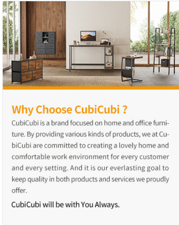
Figure 7.1: CubiCubi's commitment to quality and customer satisfaction.

contact CubiCubi customer service. We are happy to send replacement parts to you. CubiCubi offers 24/7 service to ensure your satisfaction.