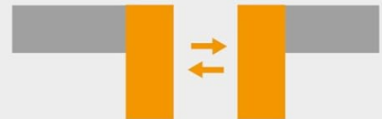
Figure 2.1: The desk can be assembled with the longer section on either the left or right side.

Can be installed according to the room layout