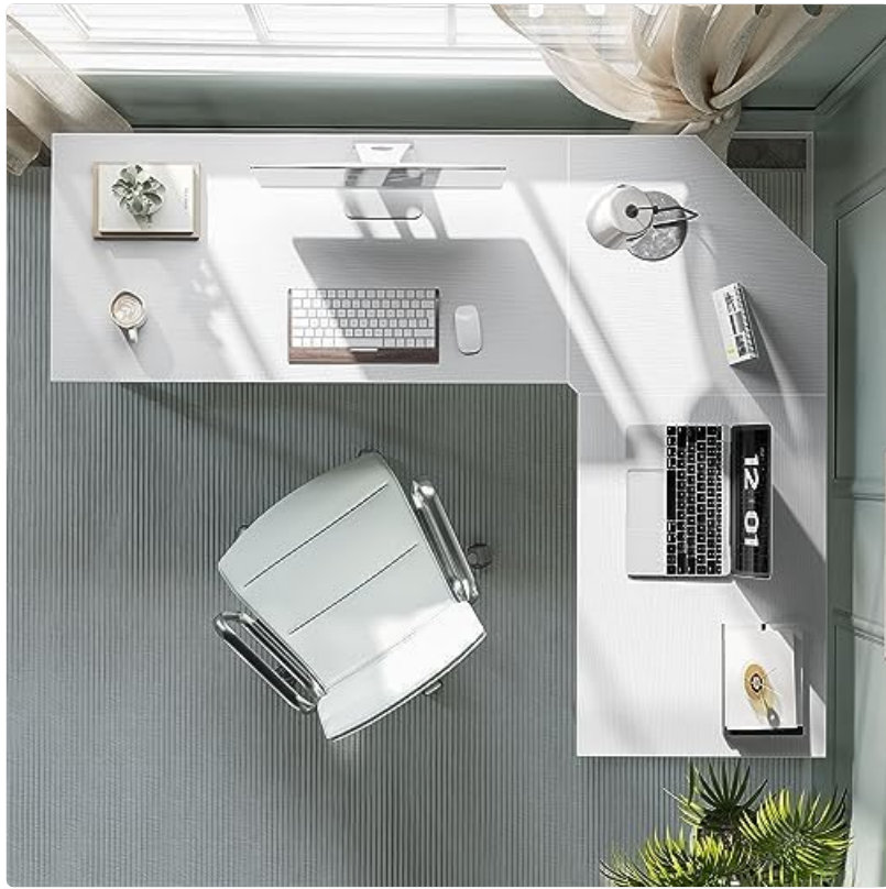
Figure 3.2: Optimal layout for multi-monitor setups and efficient workflow.