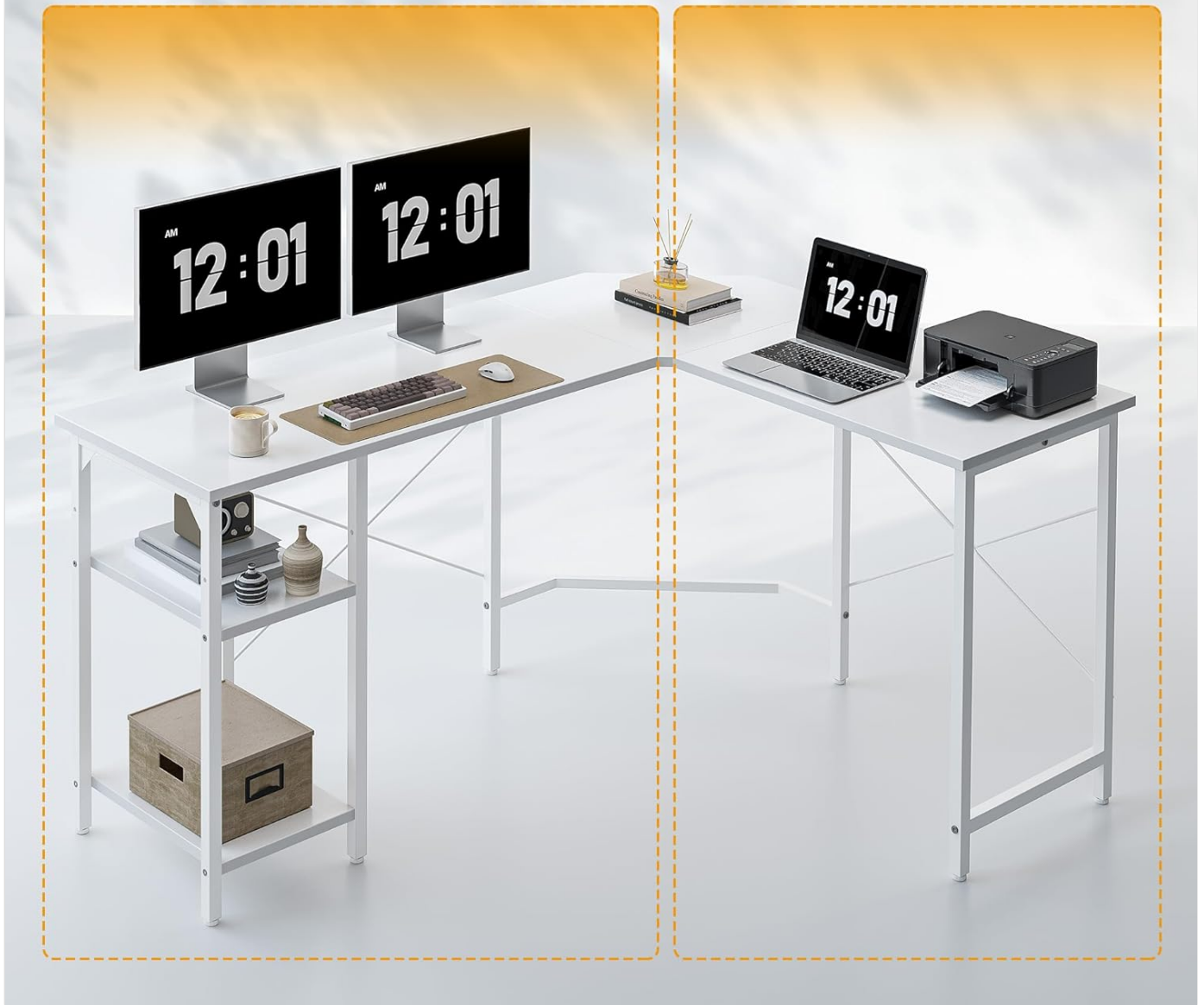
Figure 3.1: Dedicated zones for focused work and convenient storage.