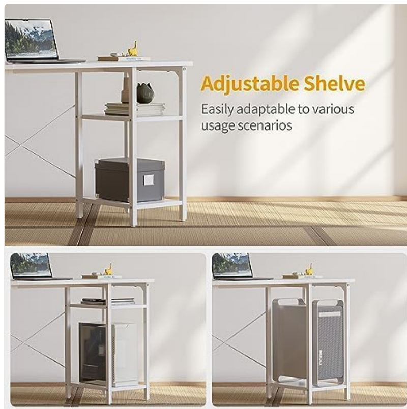
Figure 2.2: The middle shelf can be removed or adjusted to fit taller items.