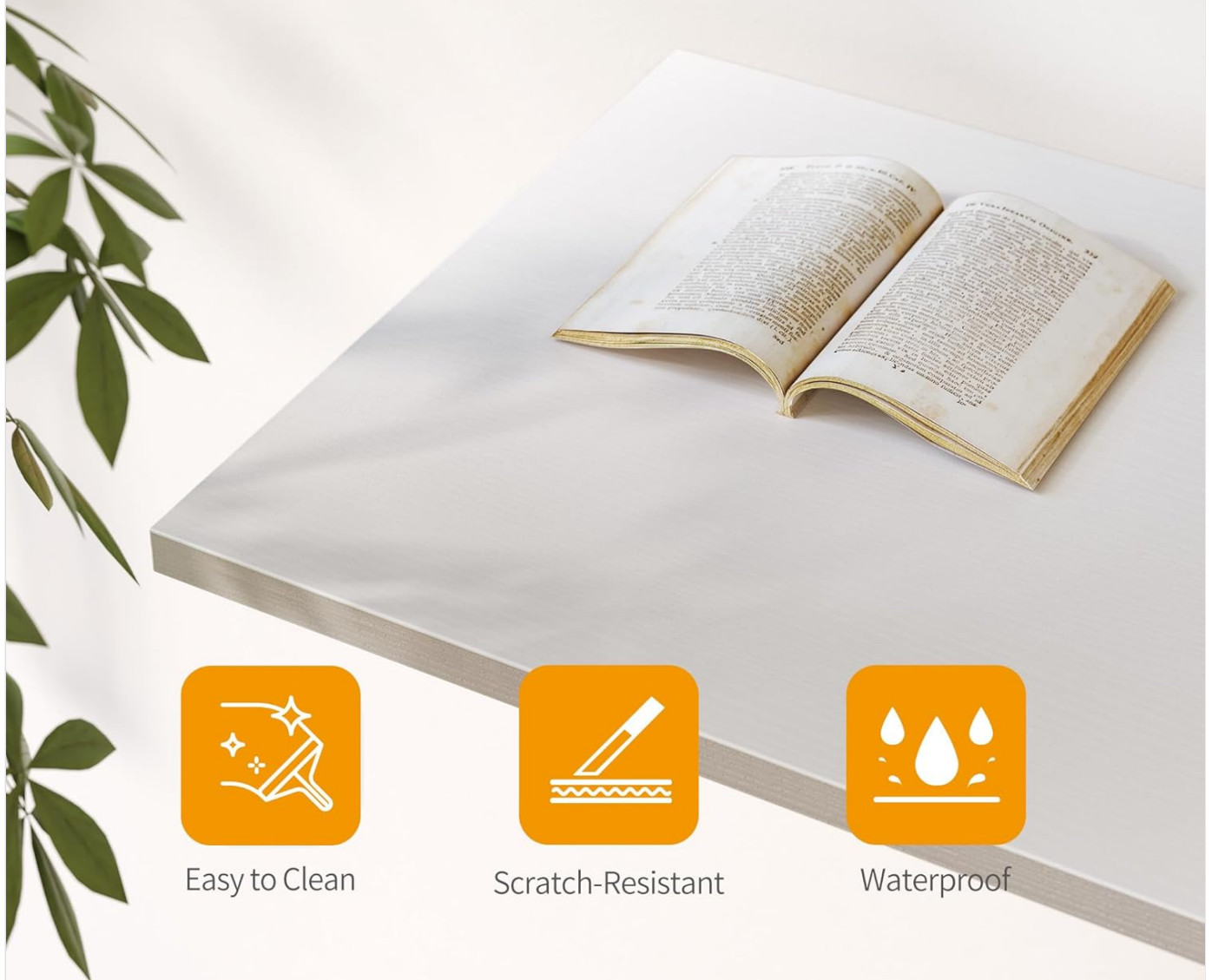
Figure 4.1: Key features of the high-quality desktop for easy maintenance.