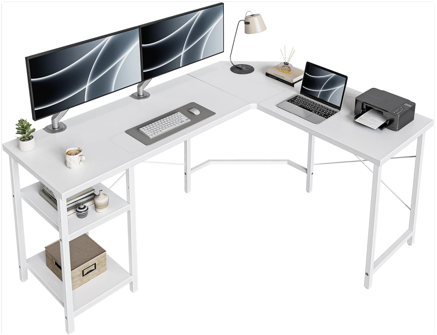
Figure 1.1: CubiCubi L Shaped Desk with ample workspace for multiple devices.