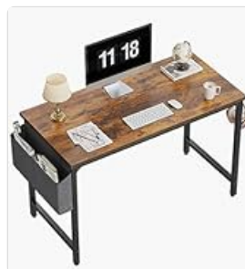
Figure 2.3: Detail of the robust metal frame providing structural integrity.

The desk is built with an alloy steel base and cross-bracing for enhanced stability. Adjustable feet ensure the desk remains level on uneven surfaces.