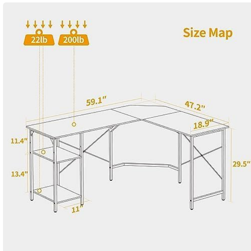
Figure 6.1: Detailed dimensions and weight capacity of the desk.