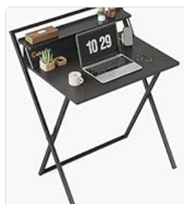
Figure 2.4: Adjustable feet allow for stability on uneven floors.