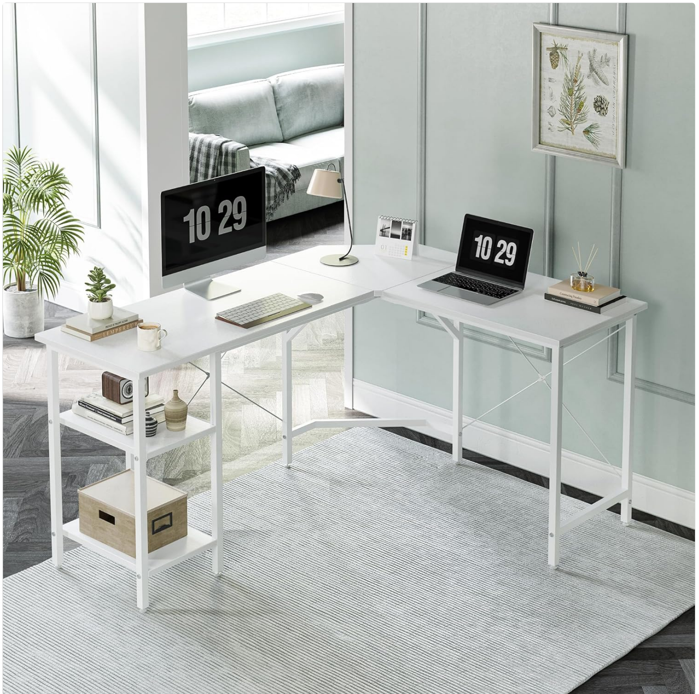
Figure 1.2: The L-shaped design fits perfectly into corner spaces, optimizing room layout.