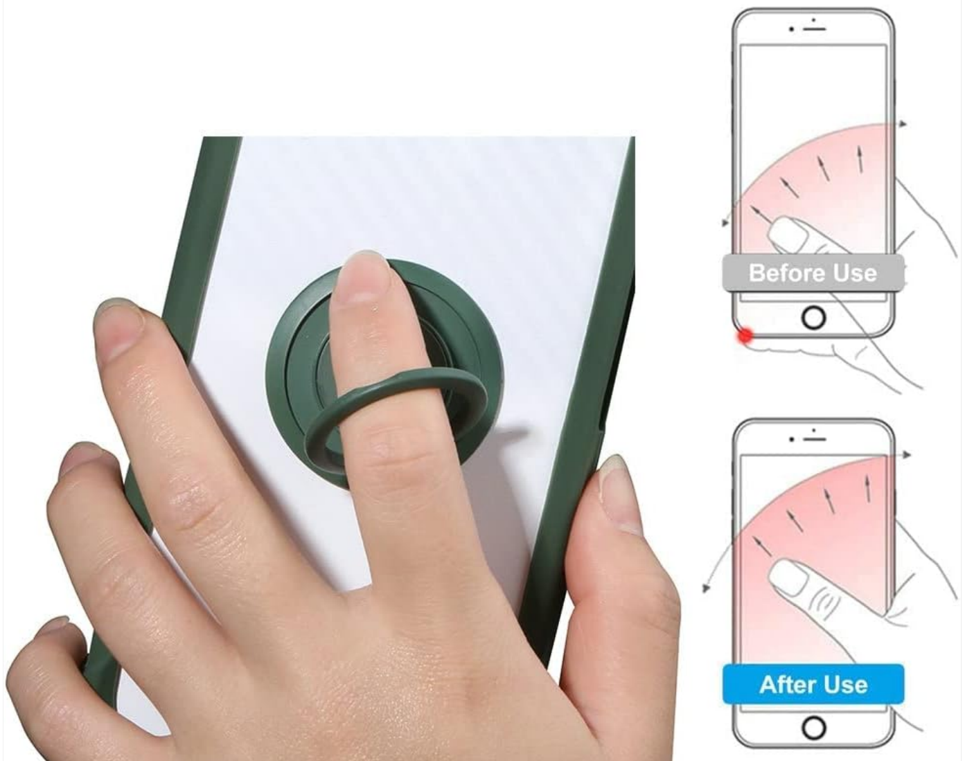
Figure 3: Demonstrating one-hand operation and extended reach with the ring holder.