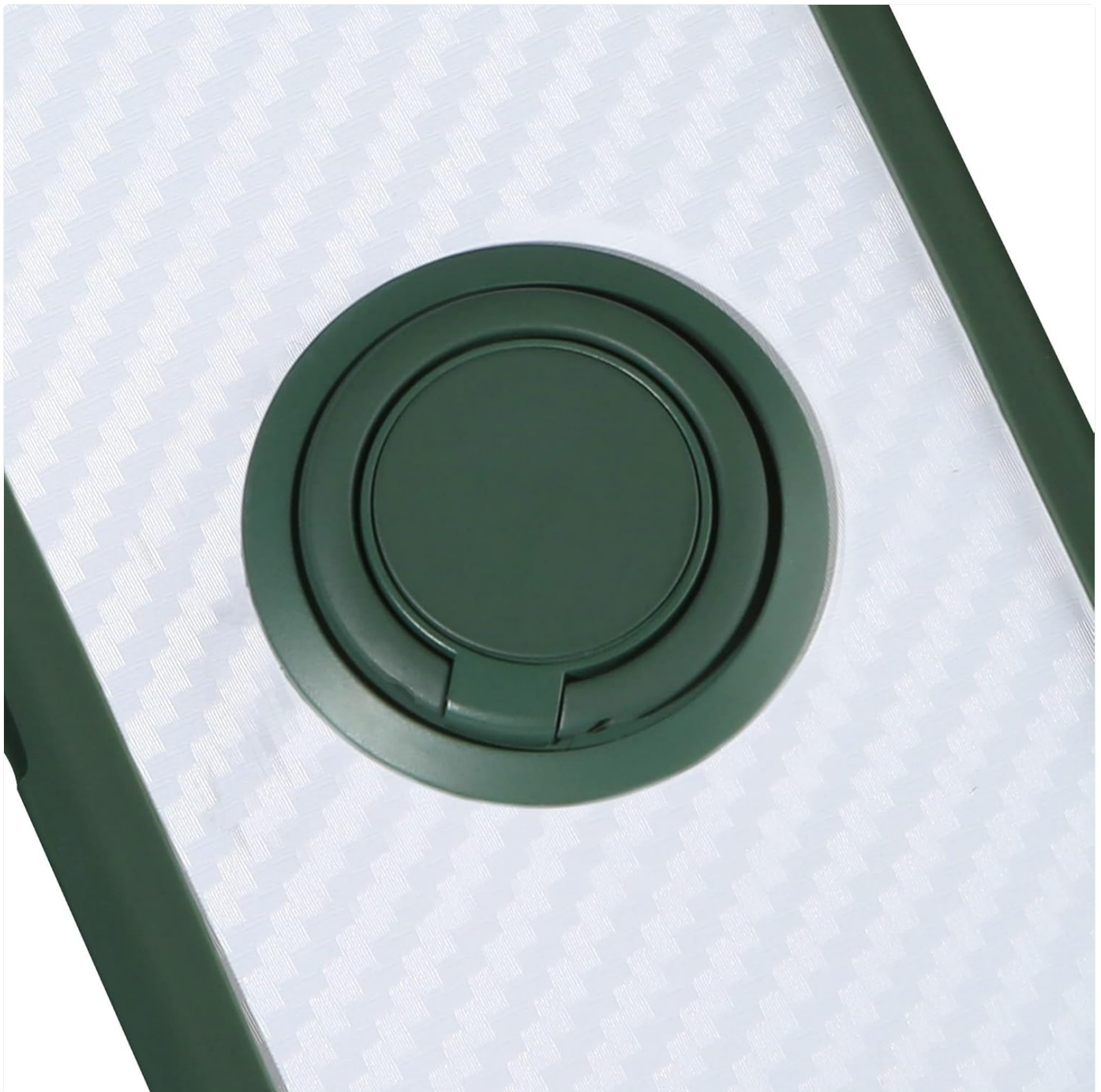
Figure 2: Illustration of the case's shockproof design with reinforced corners.