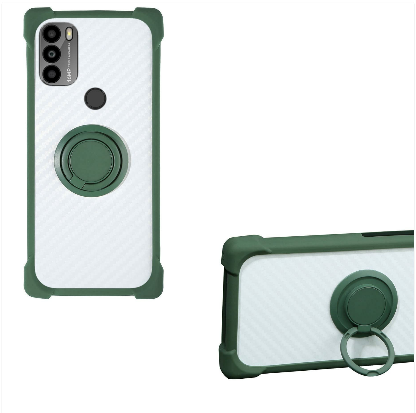
Figure 1: Overview of the Generic CSKB-LV Phone Case.