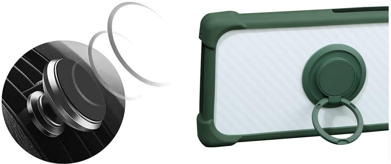
Figure 4: Illustrating the magnetic car mount compatibility feature.

Not include magnetic car mount, not support wireless charging.