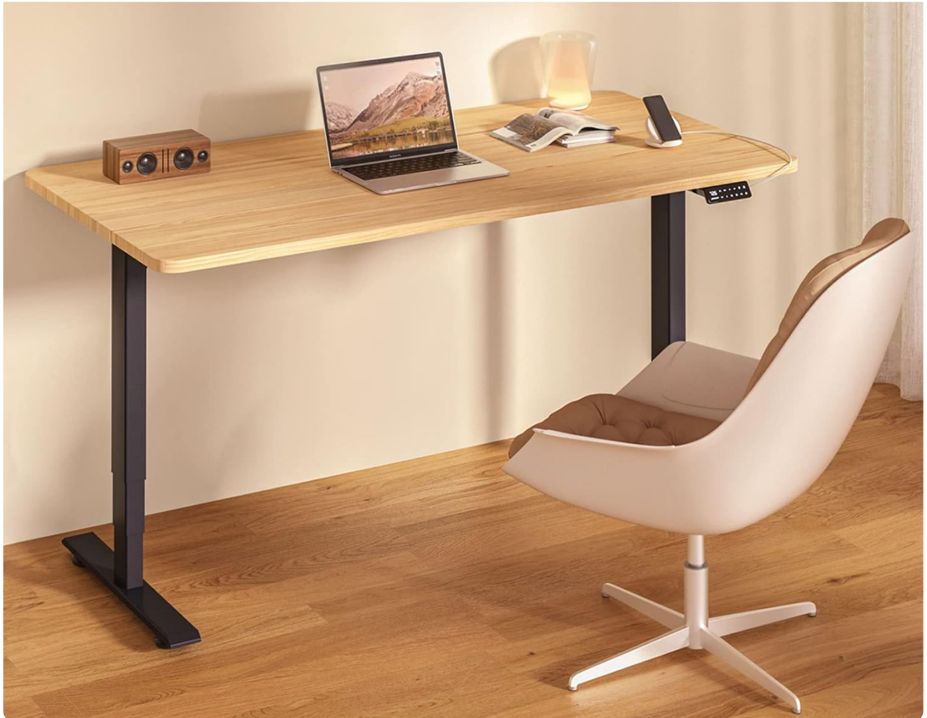
Image: Assembled Maidesite T2 Pro Plus Electric Standing Desk Frame with a tabletop.