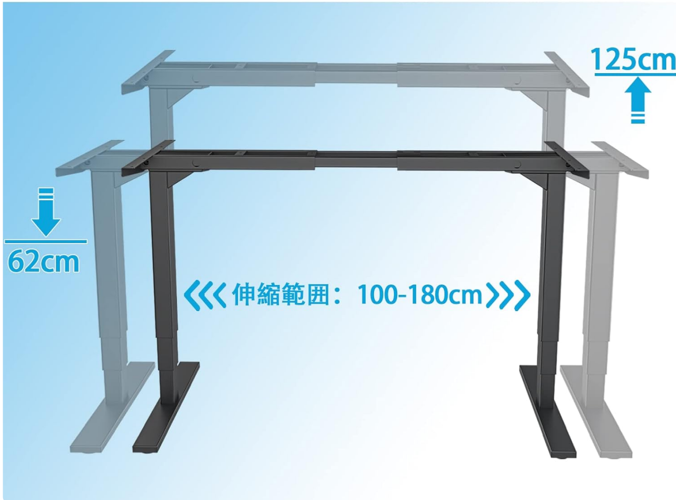
Image: Adjustable frame dimensions, showing a telescopic range of 100-180cm and a lifting range of 62-125cm.