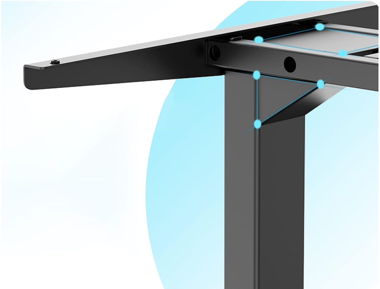
Triangular structural design for increased stability.