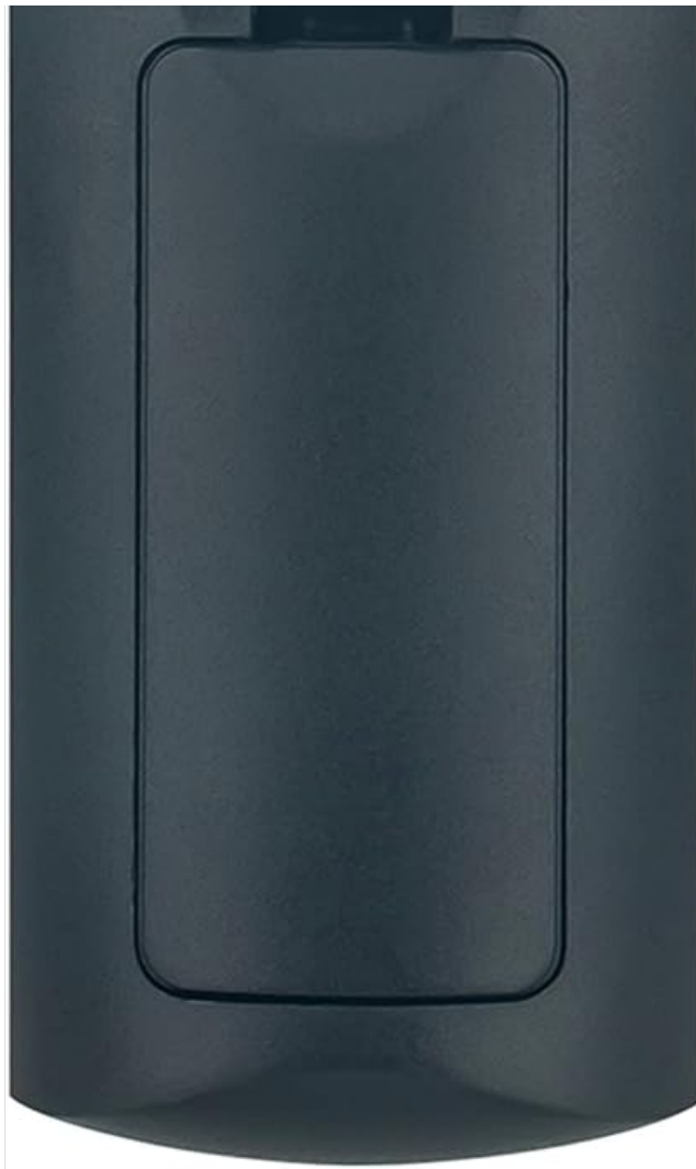
Figure 3.3: Back view of the remote control, illustrating the battery compartment cover.