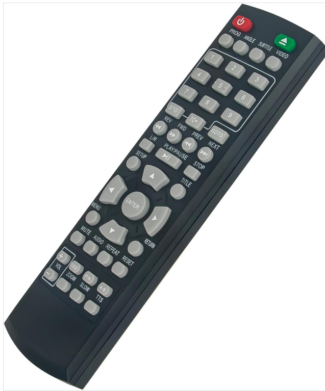
Figure 3.2: Angled view of the remote control, highlighting its ergonomic design.