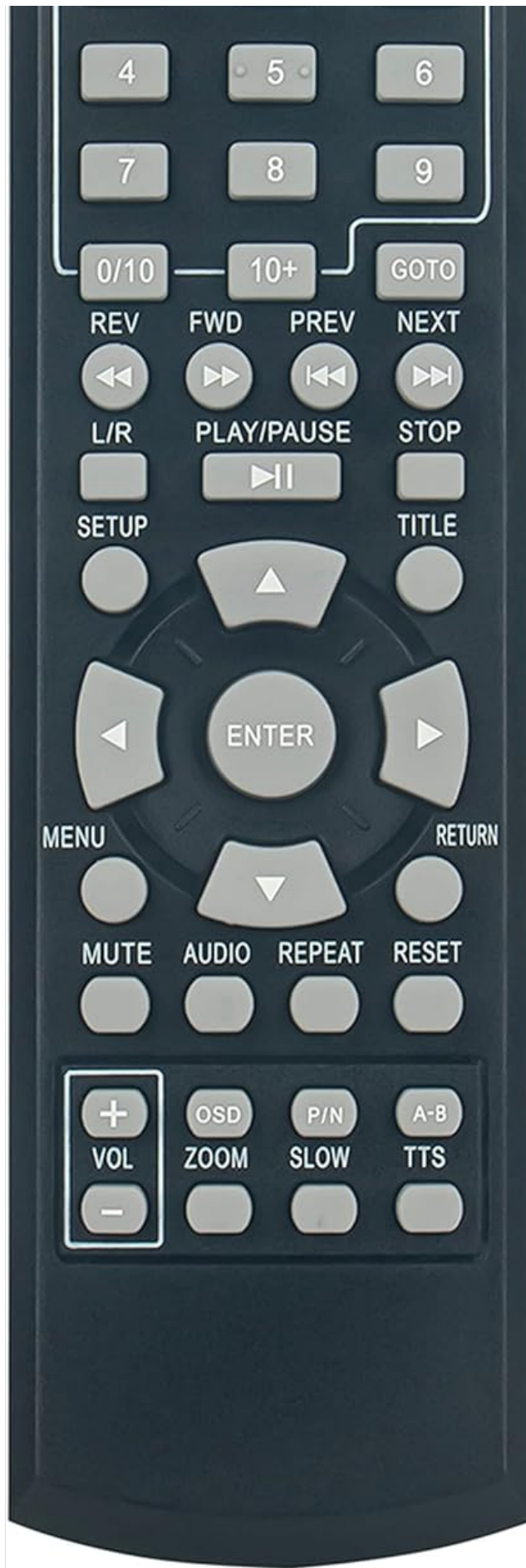
Figure 3.1: Front view of the VINABTY LR03 XL-6046 Replacement Remote Control, showing all buttons and layout.