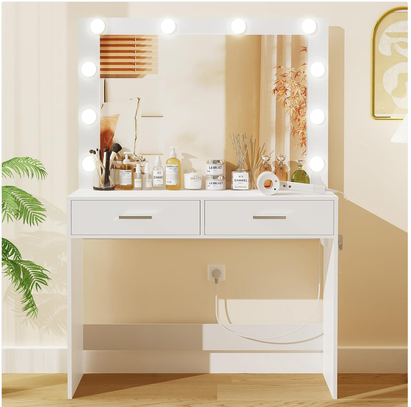
Instructions showing how to connect and neatly hide the wires for the LED light bulbs behind the mirror, ensuring a clean and organized appearance.