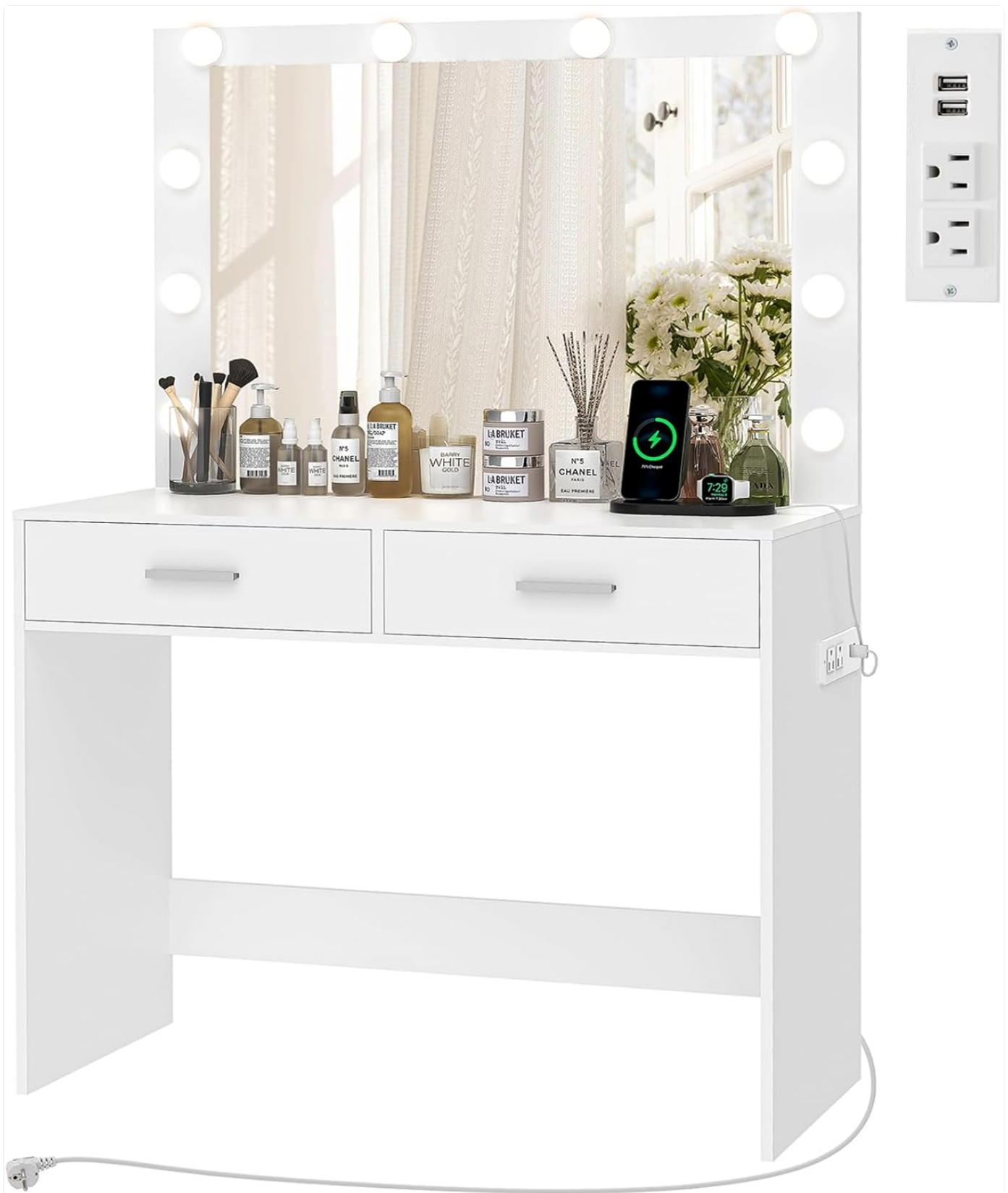
Front view of the usikey Small Vanity Desk, showcasing the large mirror with 10 LED lights, two spacious drawers, and the integrated power outlets on the side.