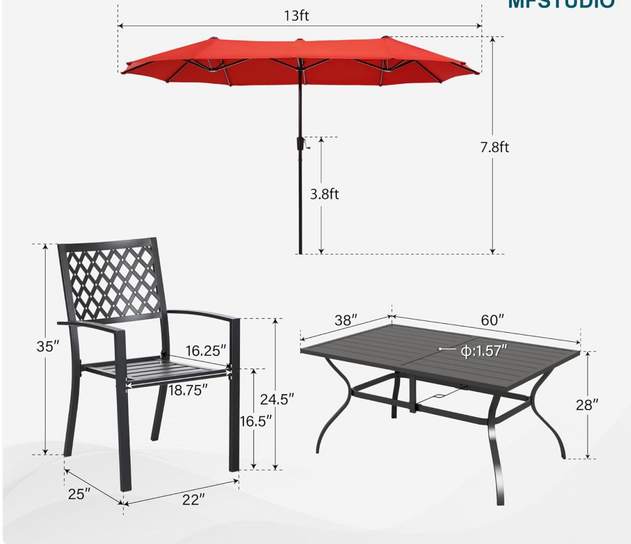
Image: Diagram showing the dimensions of the table, chairs, and umbrella.