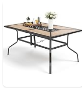
Image: Rectangular table with slatted design and umbrella hole.