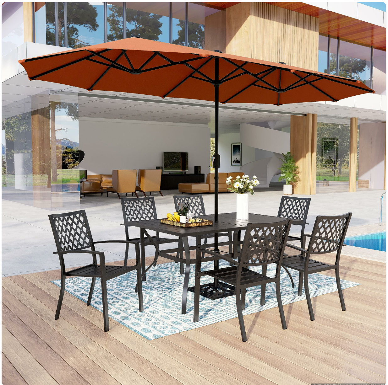
Image: Complete MFSTUDIO 8-Piece Patio Dining Set.