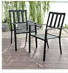
Image: Detailed view of a stackable dining chair.