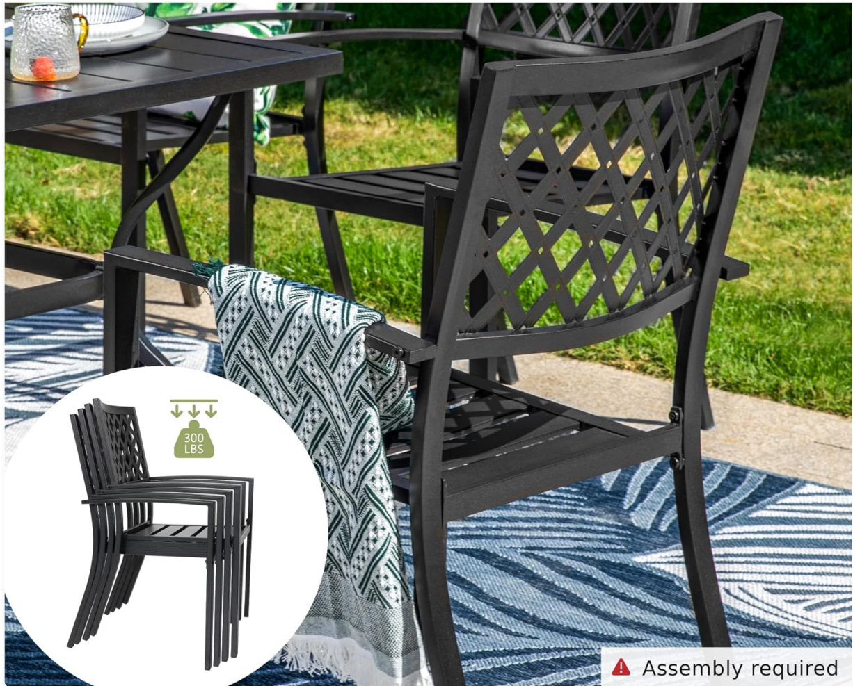
Image: Stacked chairs demonstrating space-saving feature.