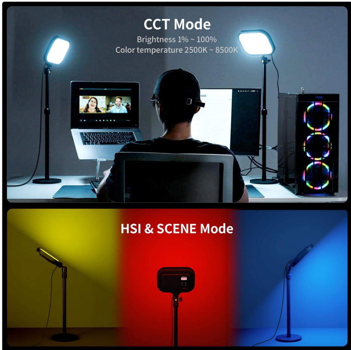
Figure 5.1: The light offers CCT mode for brightness (1%-100%) and color temperature (2500K-8500K) adjustments, ideal for video conferencing. HSI & SCENE mode provides full RGB color and special effects for creative lighting.

In CCT mode, you can adjust the brightness from 1% to 100% and the color temperature from 2500K (warm) to 8500K (cool). Use the corresponding controls on the light panel or the remote.