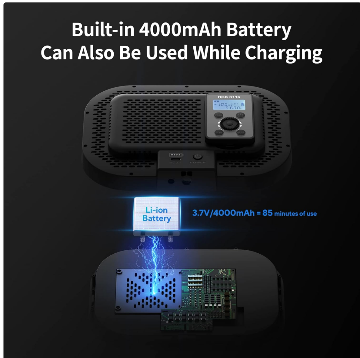
Figure 6.1: The light is equipped with a built-in 4000mAh Li-ion battery, offering approximately 85 minutes of continuous use. It can also be used while charging via the Type-C port.

The RALENO Key Light features a built-in 4000mAh Lithium-Ion battery, providing approximately 85 minutes of use at maximum brightness. It supports Type-C charging, allowing you to use the light while it charges. It also supports power banks with PD protocol output for flexible power options.