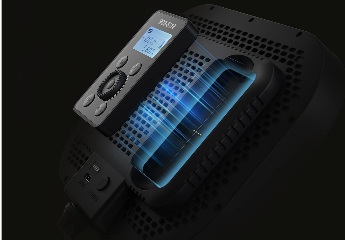
Figure 3.2: The 2.4G magnetic remote control conveniently stores and charges on the back of the light panel, allowing for easy access and multi-light control.

Don't bother for downloading an App just put the remote control on the compartment to finish the connection the charging and the store of the remot control