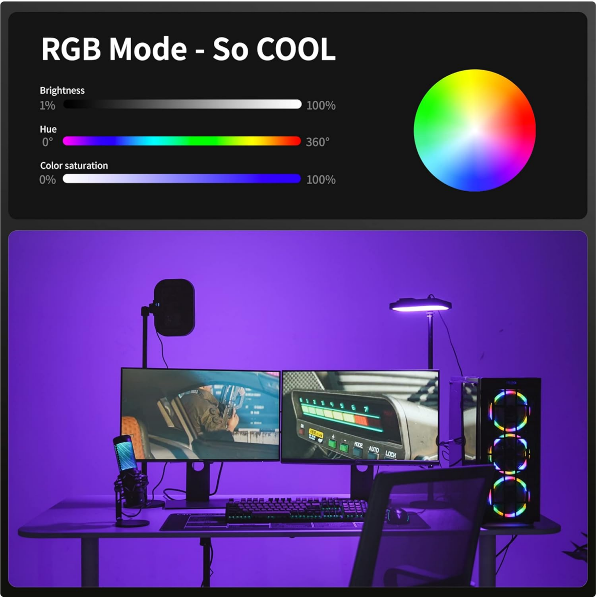
Figure 5.2: RGB Mode allows precise control over brightness (1%-100%), hue (0°-360°), and color saturation (0%-100%) to achieve any desired color effect.