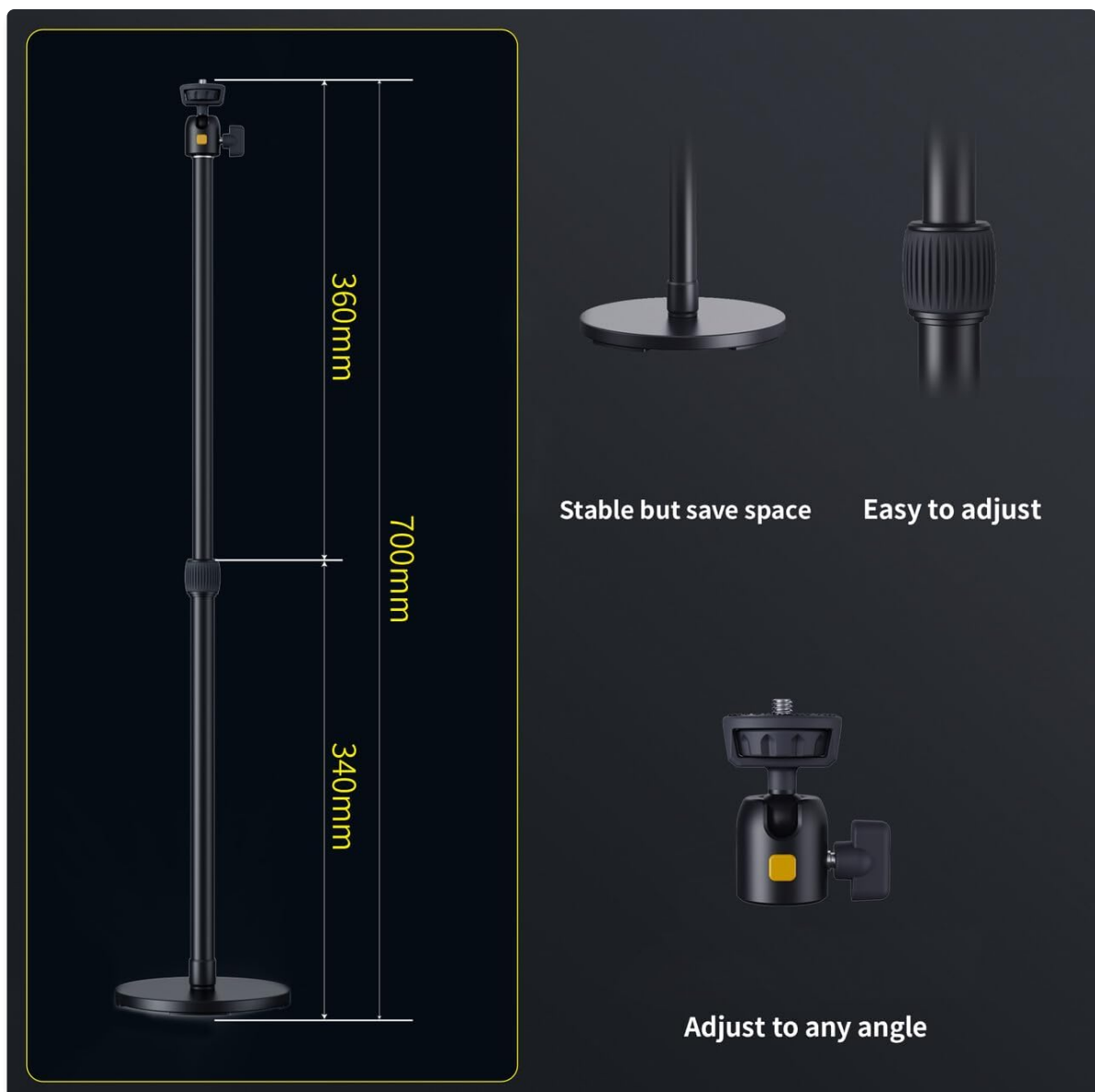
Figure 4.1: The sturdy and flexible desk stand includes a weighted base, a telescoping pole (extending up to 27.5 inches), and a 360° ball head for versatile positioning. The light can also be used independently on any camera or stand.