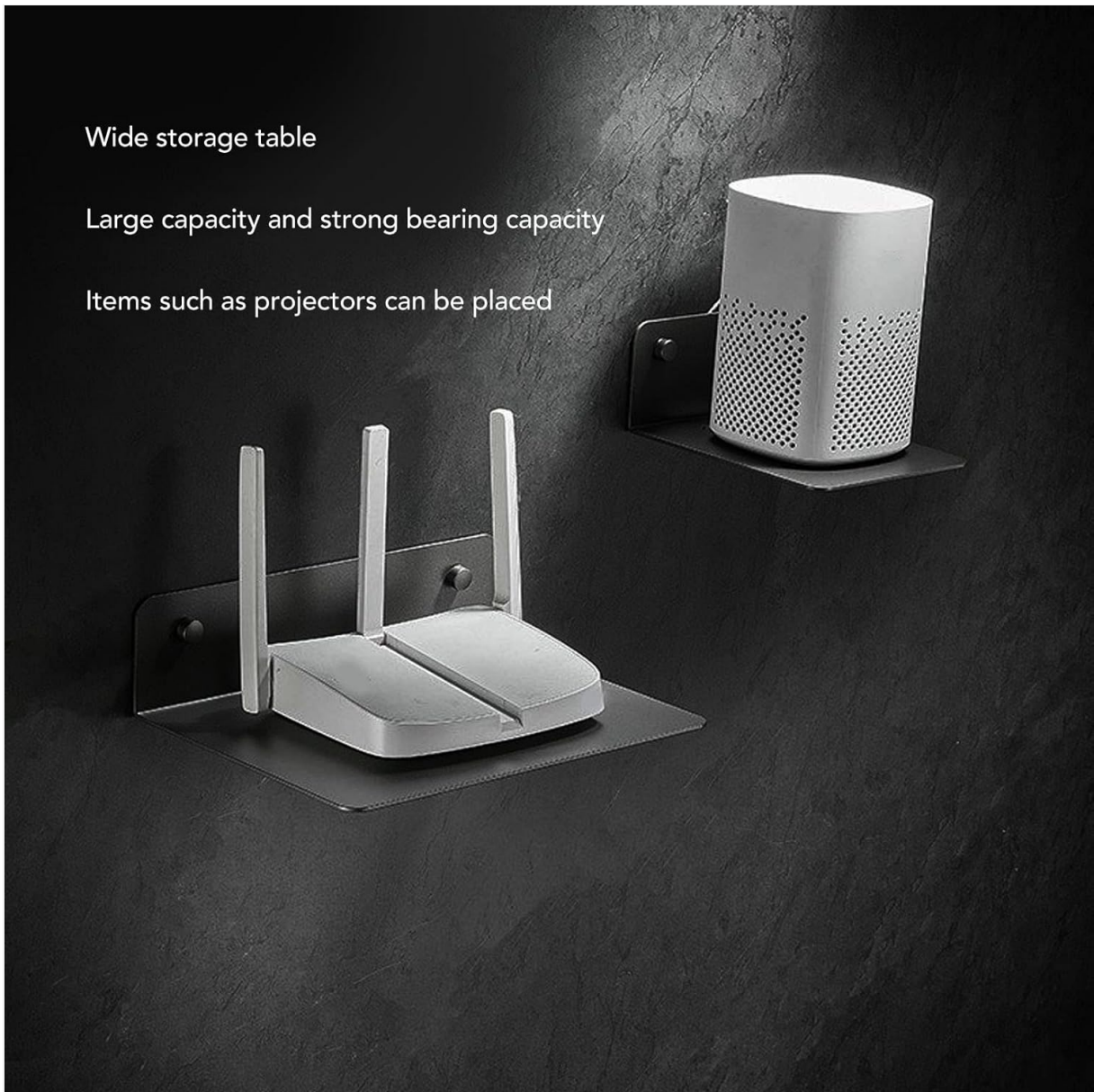
Image: Two Yuecoom Floating Wall Shelves installed, demonstrating use for a router and a smart speaker.