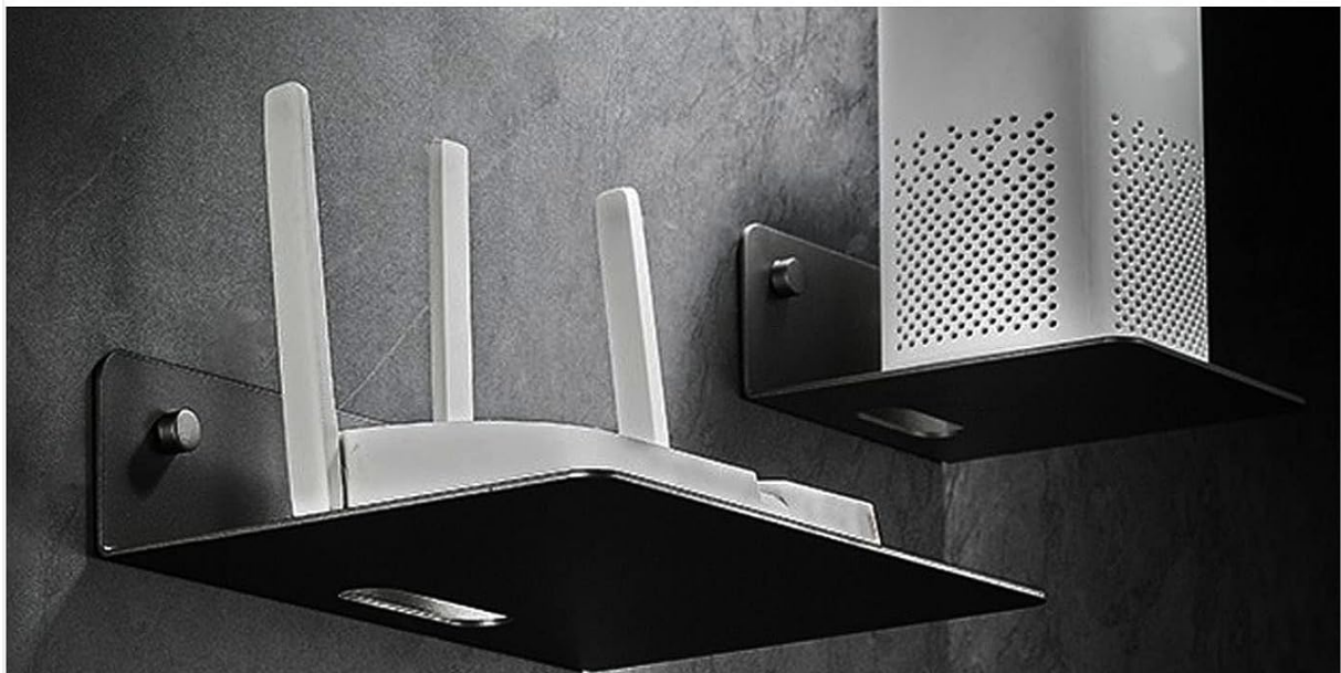
Image: The floating wall shelf shown with its complete set of mounting accessories.