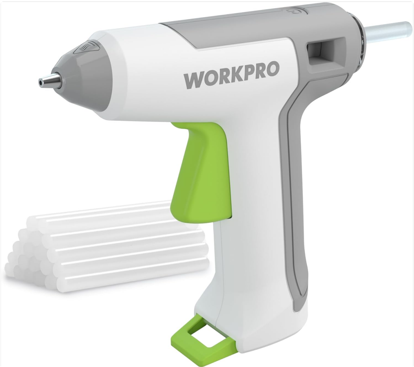
Figure 3.1: The WORKPRO Cordless Hot Glue Gun and included glue sticks.