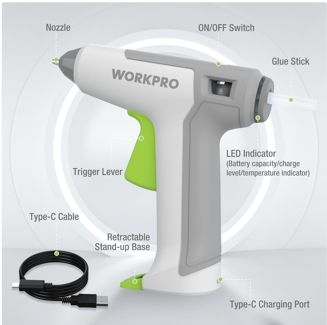
Figure 2.1: Labeled components of the WORKPRO Cordless Hot Glue Gun, including Nozzle, ON/OFF Switch, Glue Stick insertion point, LED Indicator, Trigger Lever, Type-C Cable, Retractable Stand-up Base, and Type-C Charging Port.