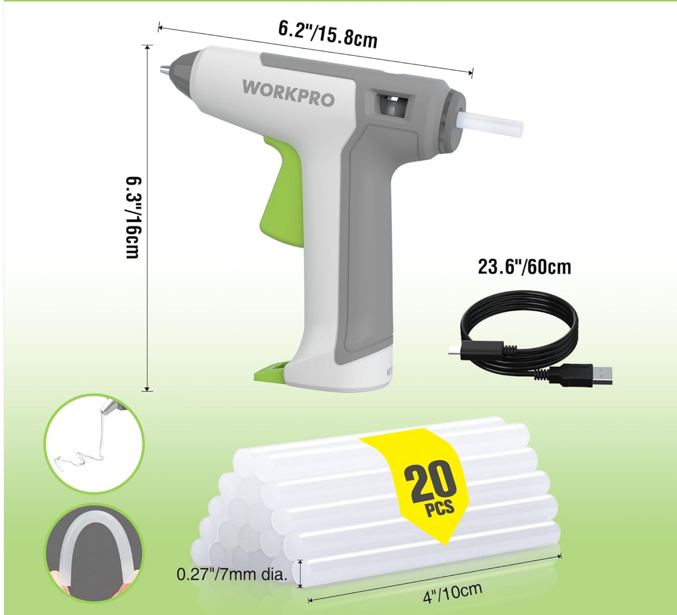
Figure 9.1: Key dimensions of the WORKPRO Cordless Hot Glue Gun.