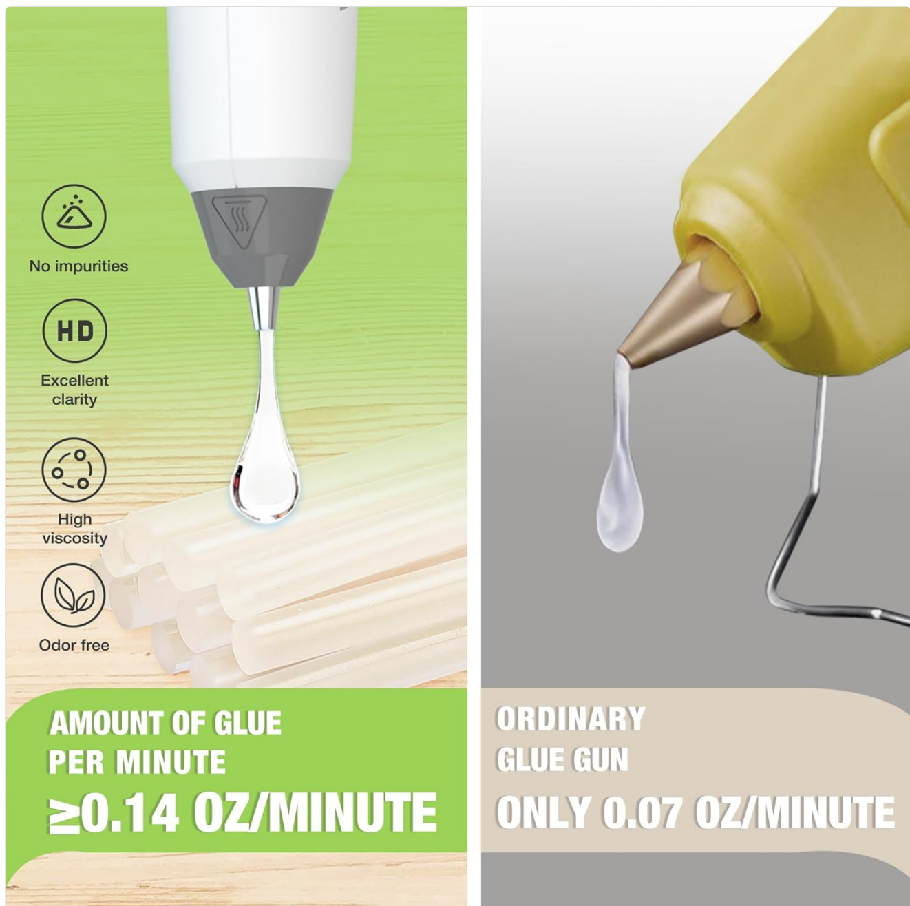
Figure 6.3: Comparison showing the superior glue output and clarity of the WORKPRO glue gun.