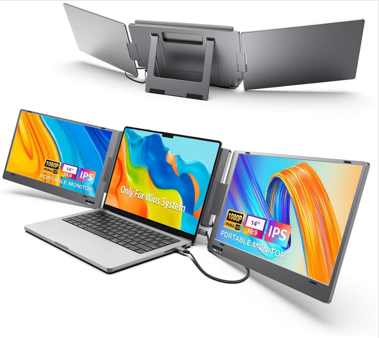
Image: The KYE X90 Triple Laptop Screen Extender showcasing its versatile design, both fully extended with a laptop and folded for portability.