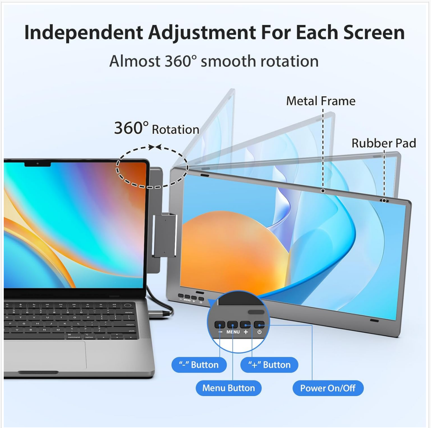
Image: The KYY X90 demonstrating its multi-using modes, including extended, mirror, portrait, and single 2nd screen configurations.