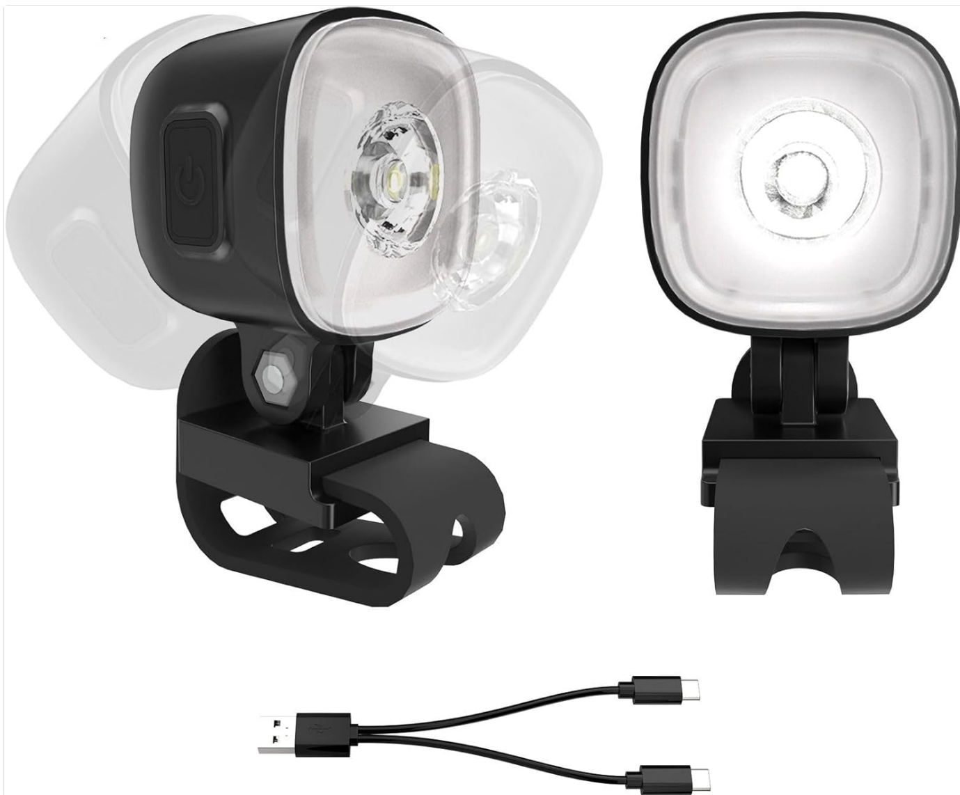
Image: COSOOS Original 2 Rechargeable Headlights for Shoe Charms.