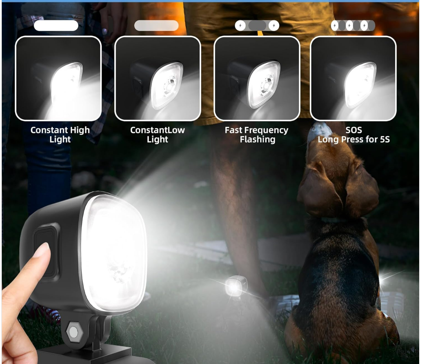
Image: Overview of the four light modes.