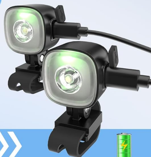
Image: Adjustable 90-degree wide angle feature.