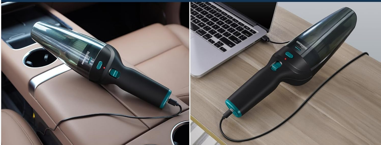
Image 2.1: The vacuum cleaner positioned on its charging dock, illustrating its compact dimensions (36.5cm/14.3inch height, 9cm/3.5inch width) and indicating a 2000mAh*3 battery capacity, Type-C charging port, 25-30 minutes run time, and a 1M charging cable.