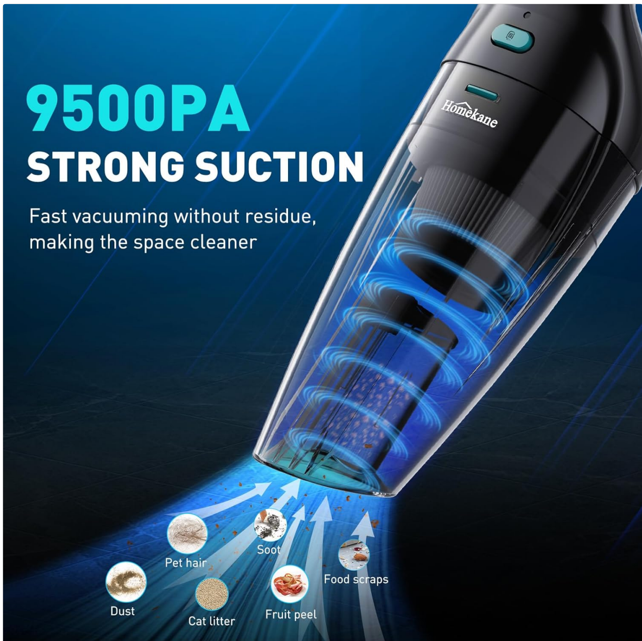
Image 3.2: This graphic demonstrates the vacuum's 9500Pa strong suction capability, effectively removing various debris such as dust, pet hair, soot, cat litter, fruit peel, and food scraps.