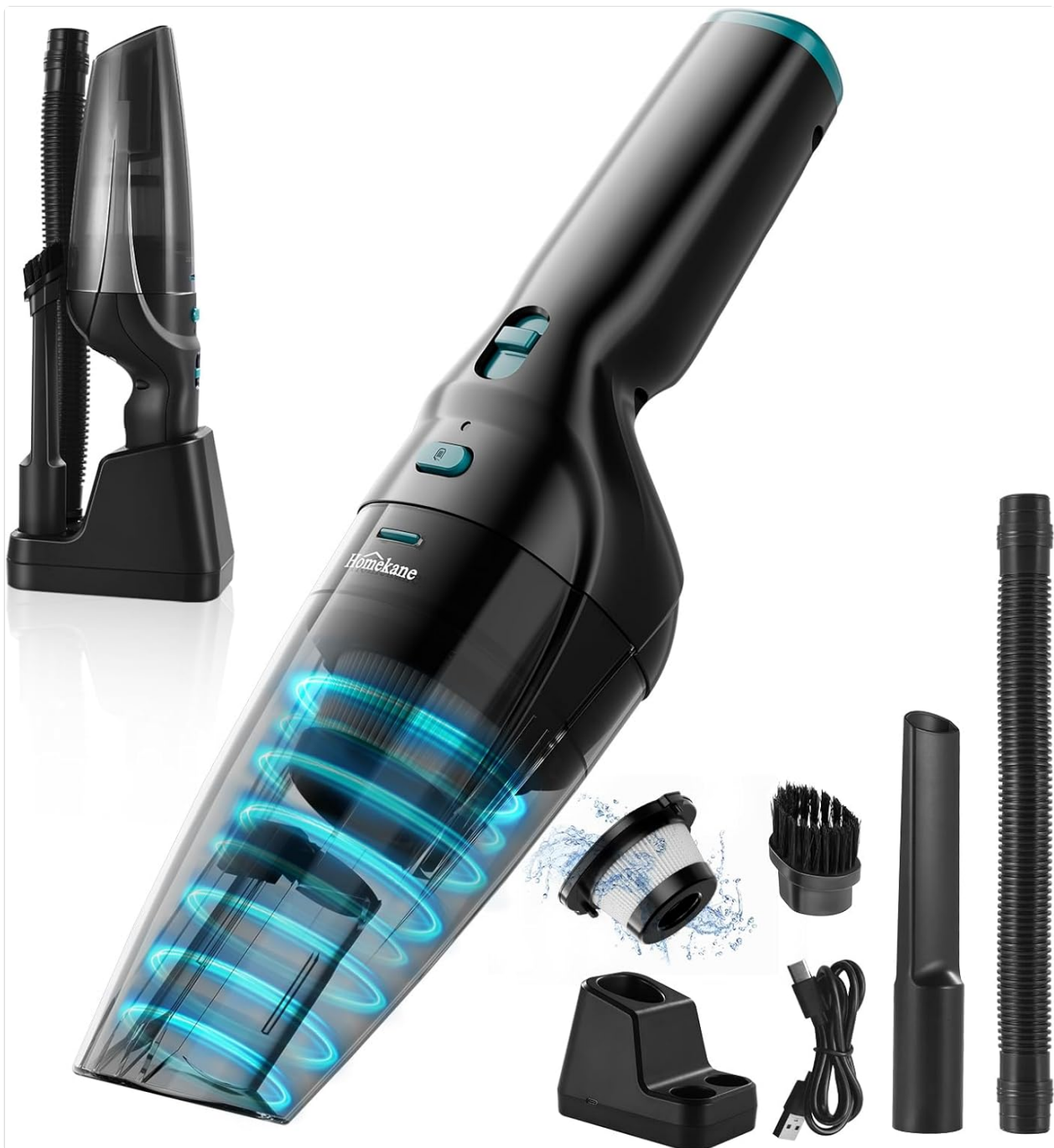
Image 1.1: The HOMEKANE Handheld Cordless Vacuum Cleaner, its charging dock, and included accessories such as the flat nozzle, brush nozzle, and extension hose.