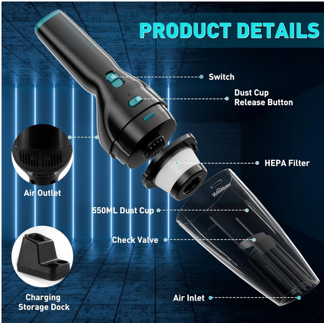
Image 3.1: Detailed diagram highlighting key components of the vacuum cleaner, including the power switch, dust cup release button, HEPA filter, 550ml dust cup, check valve, air inlet, air outlet, and charging storage dock.