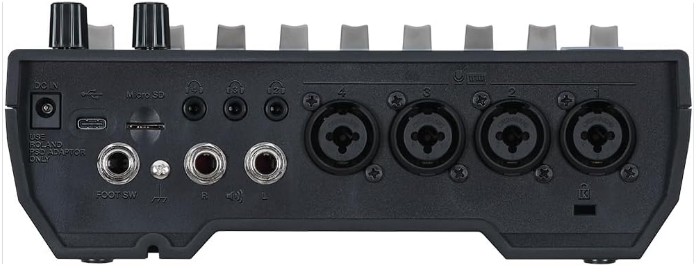
Figure 2.2: Rear panel of the Gigcaster 8, showing DC IN, USB, Micro SD slot, headphone outputs, FOOT SW, and XLR/TRS combo inputs.