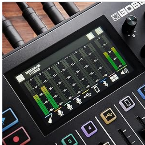
Figure 3.1: The Gigcaster 8's color touchscreen displaying audio levels and settings.