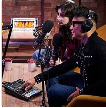
Figure 3.2: The eight assignable SFX pads on the Gigcaster 8.