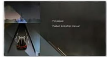
Manuale di istruzioni