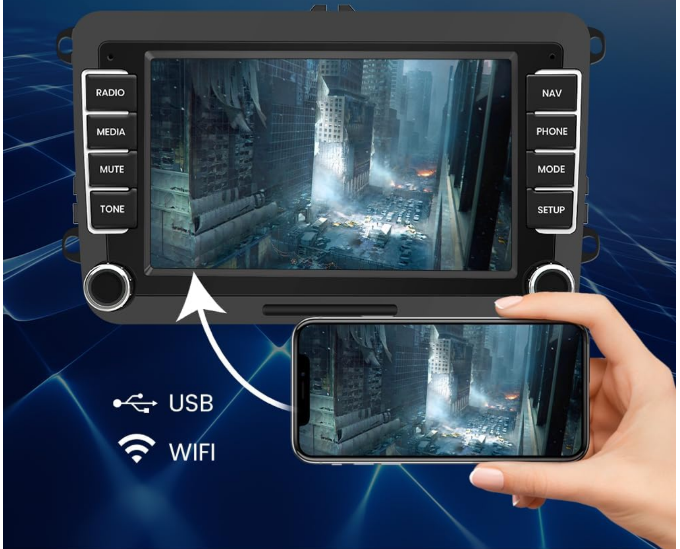
Image: Mirrorlink functionality via USB or Wi-Fi.

Supporta il mirroring dello schermo per telefoni IOS e Android.