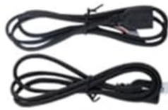
Cavo USB (4-PIN) Cavo USB (6-PIN)