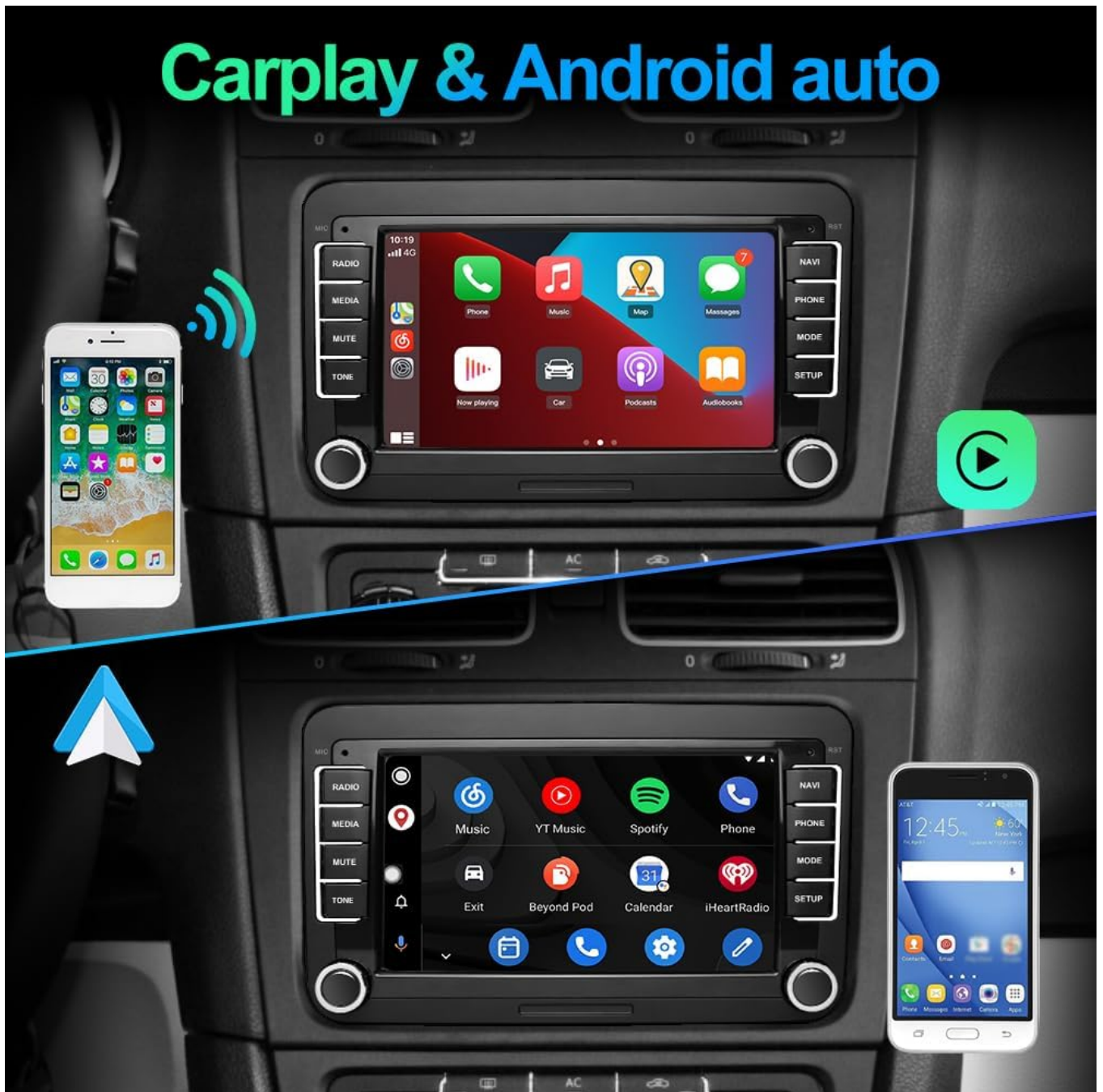
Image: CarPlay and Android Auto interfaces on the car radio.