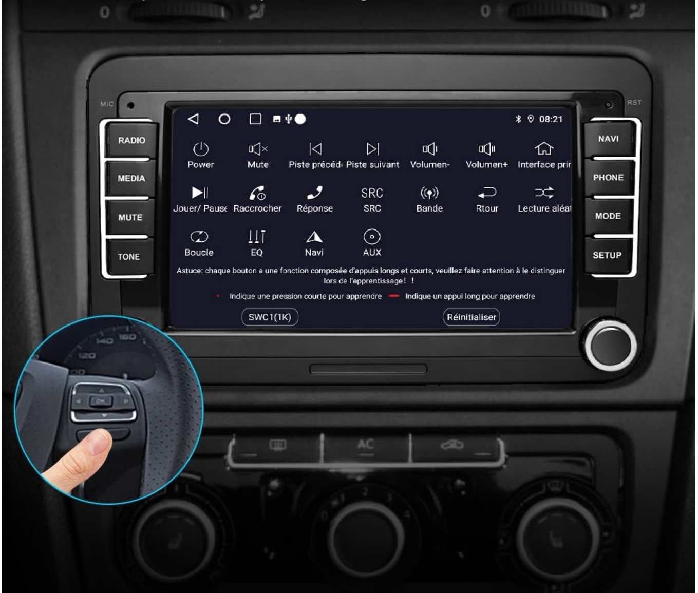
Image: Steering wheel control learning interface.

Compatibile con i pulsanti originali del volante dell'auto.