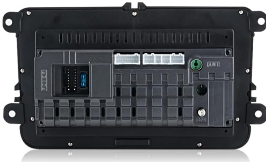
Image: Dimensions and rear view of the car radio.