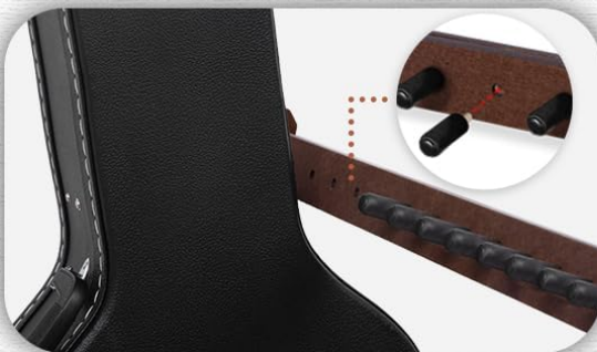
GUITAR CASE RACK