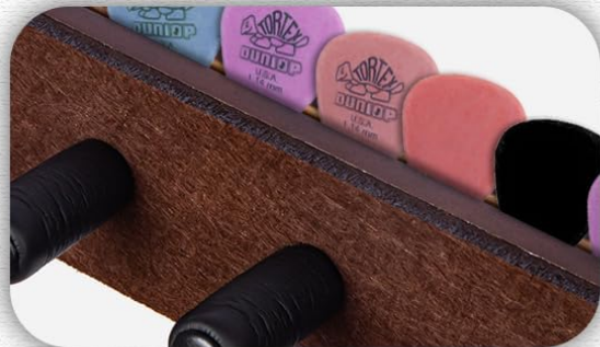
GUITAR PICK HOLDER