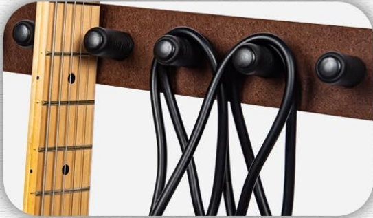
GUITAR CABLE HOOK