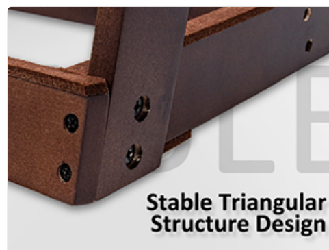
Figure 7: The stable triangular structure ensures balance and prevents tipping.