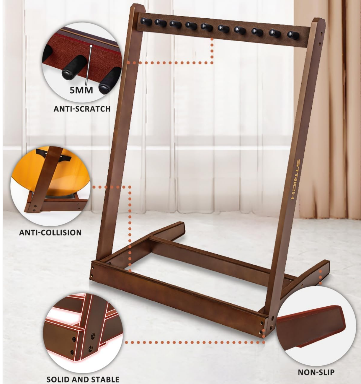
Figure 3: Detail of protective felt padding and stable design elements.