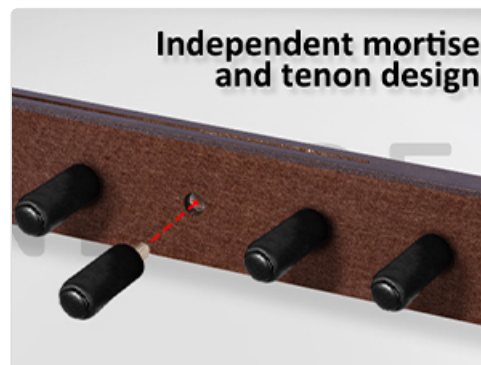
Figure 6: Illustration of the mortise and tenon joint for secure assembly.