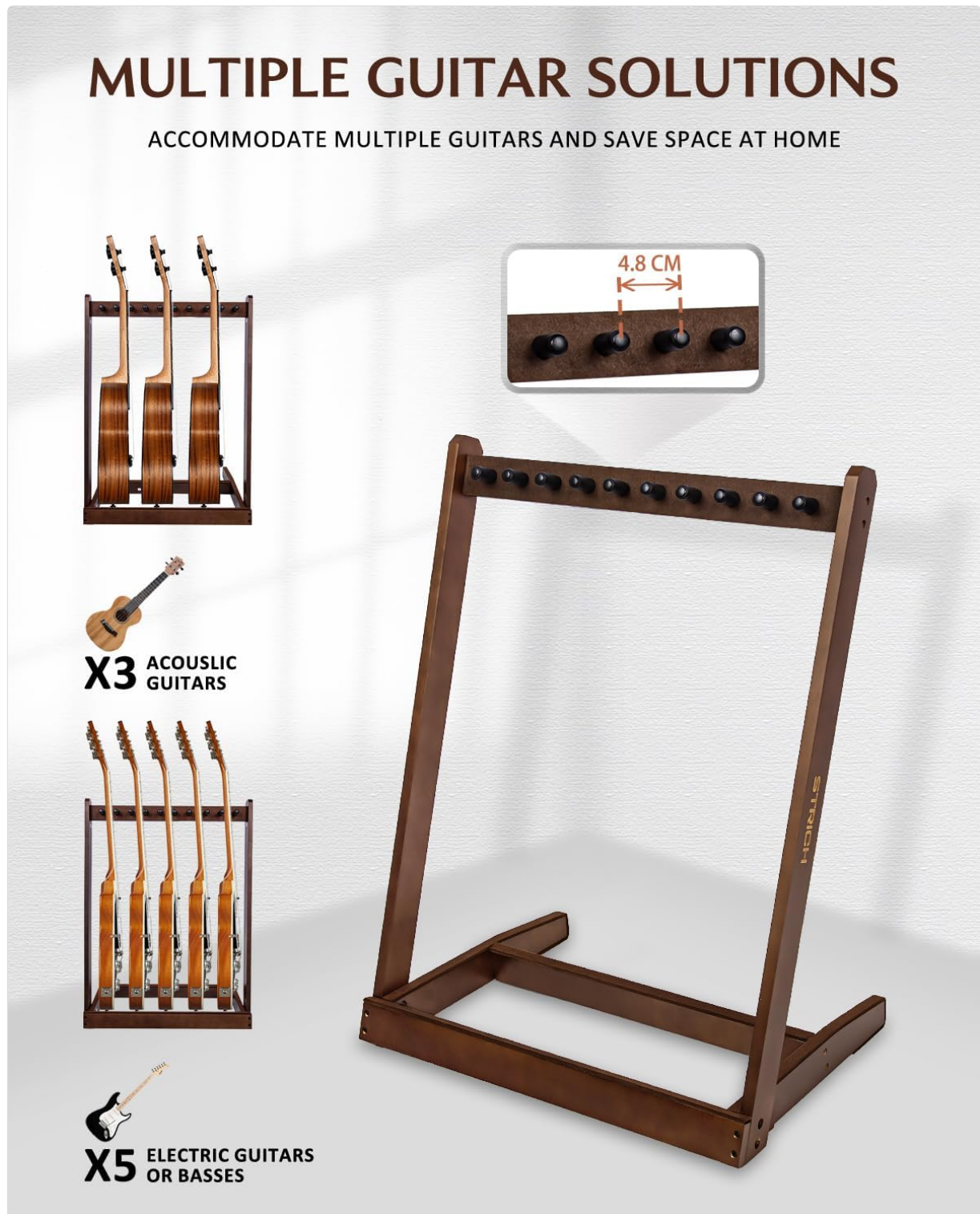
Figure 8: Example of various guitars stored on the stand.