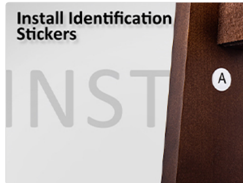
Figure 5: Example of an identification sticker on a component.