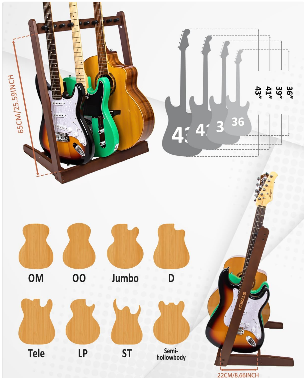
Figure 2: Capacity and compatibility with various guitar types and sizes.