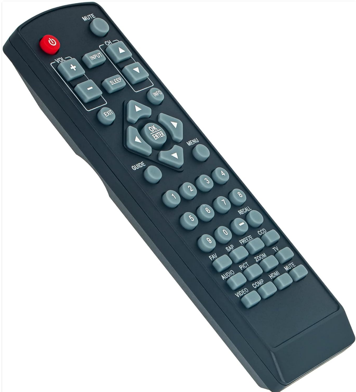
Figure 2: Front view of the RC-304 remote control, highlighting the arrangement of all control buttons.

The RC-304 remote control features standard buttons for navigating your Insignia TV. Below is a general overview of common button functions.