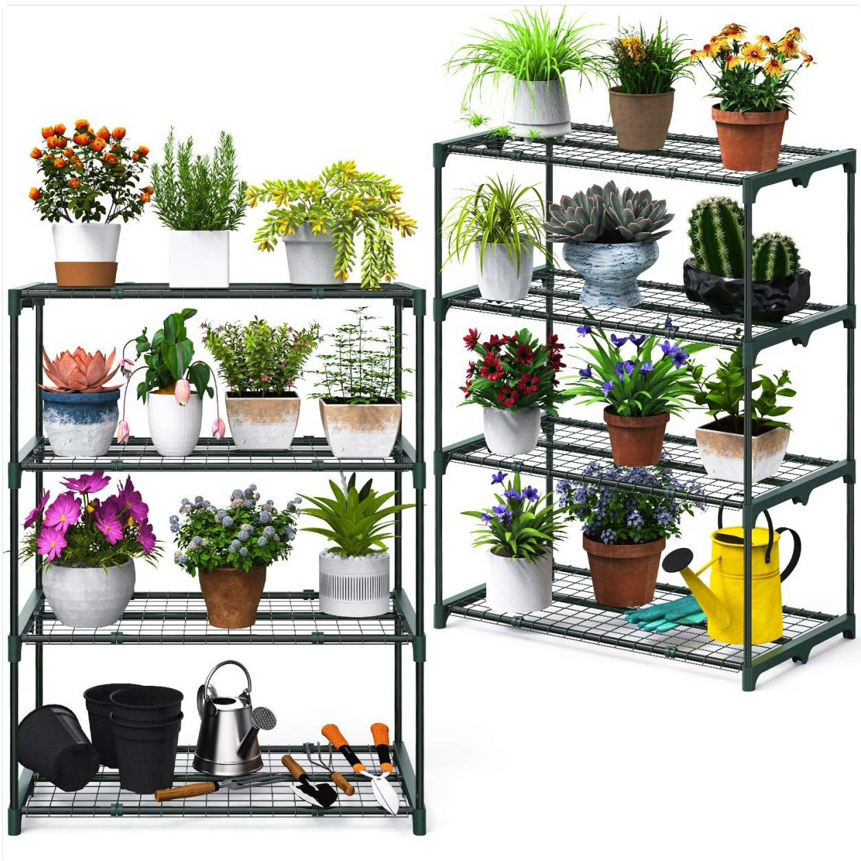
Image 1.1: Ohuhu 4-Tier Greenhouse Shelves in use, showcasing their capacity for multiple plants.