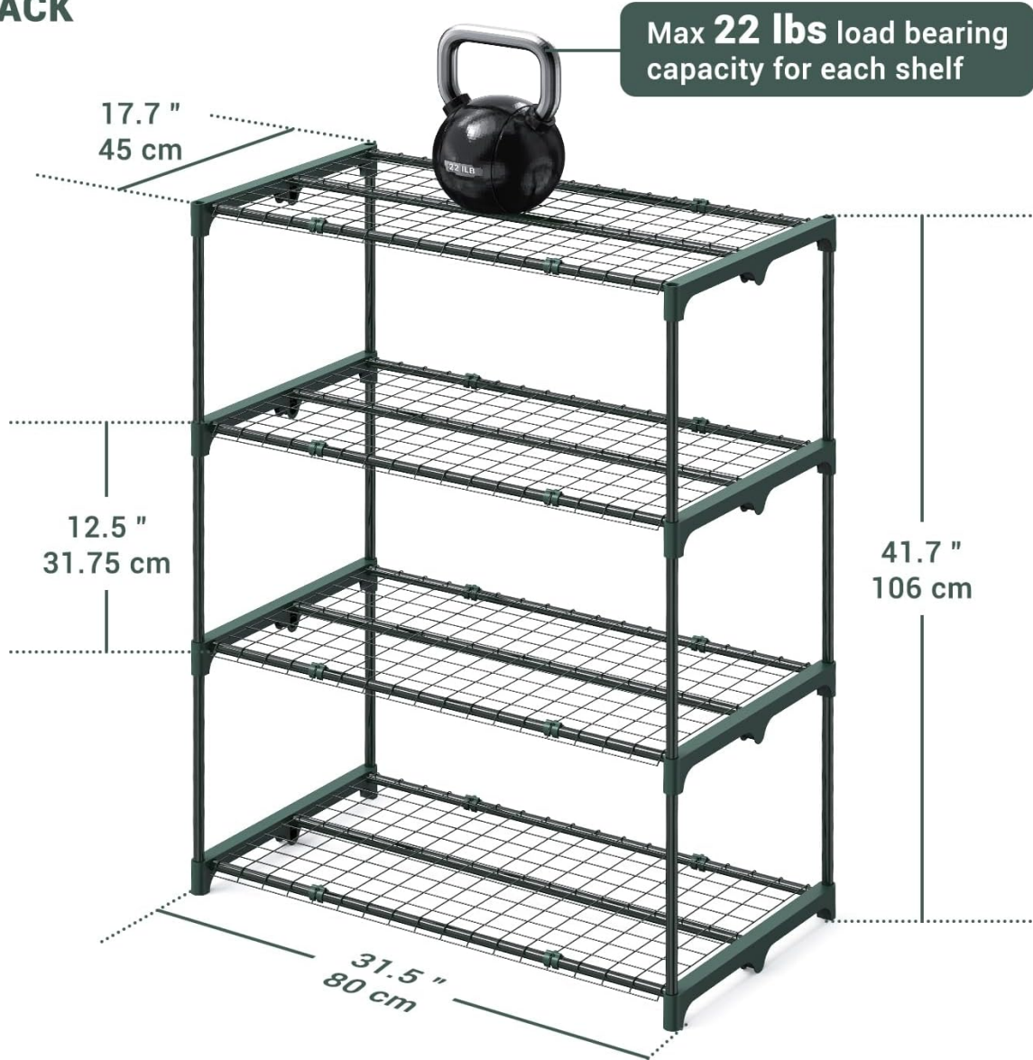
Image 3.1: Dimensions and load bearing capacity of the assembled shelf unit.