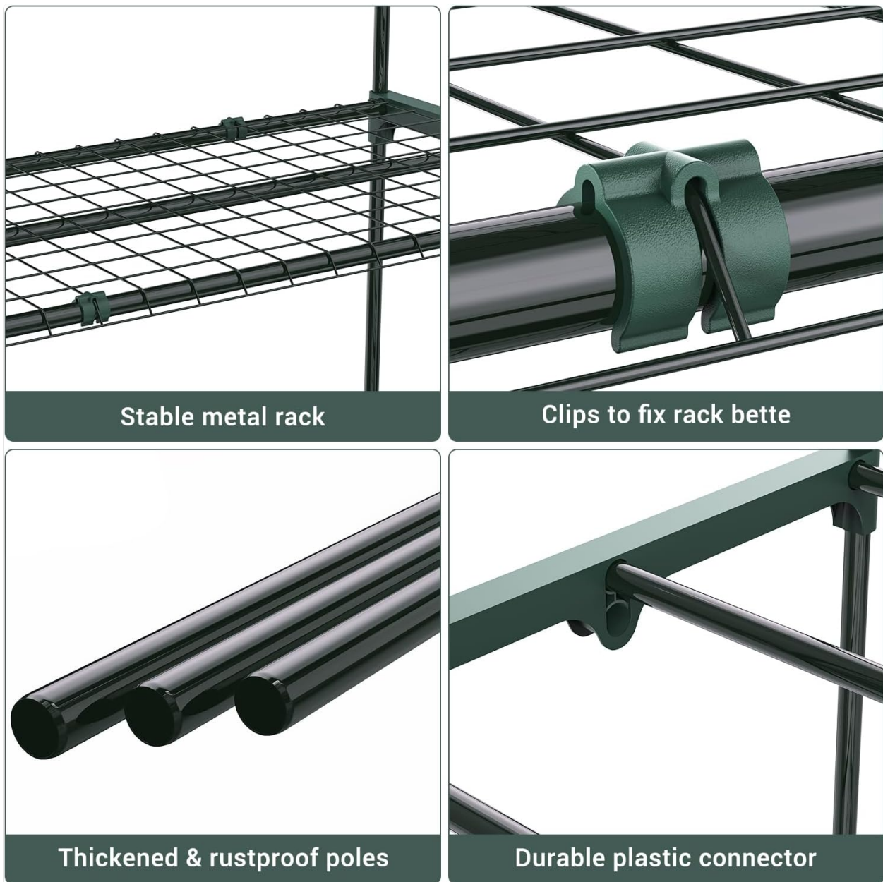
Stable metal rack