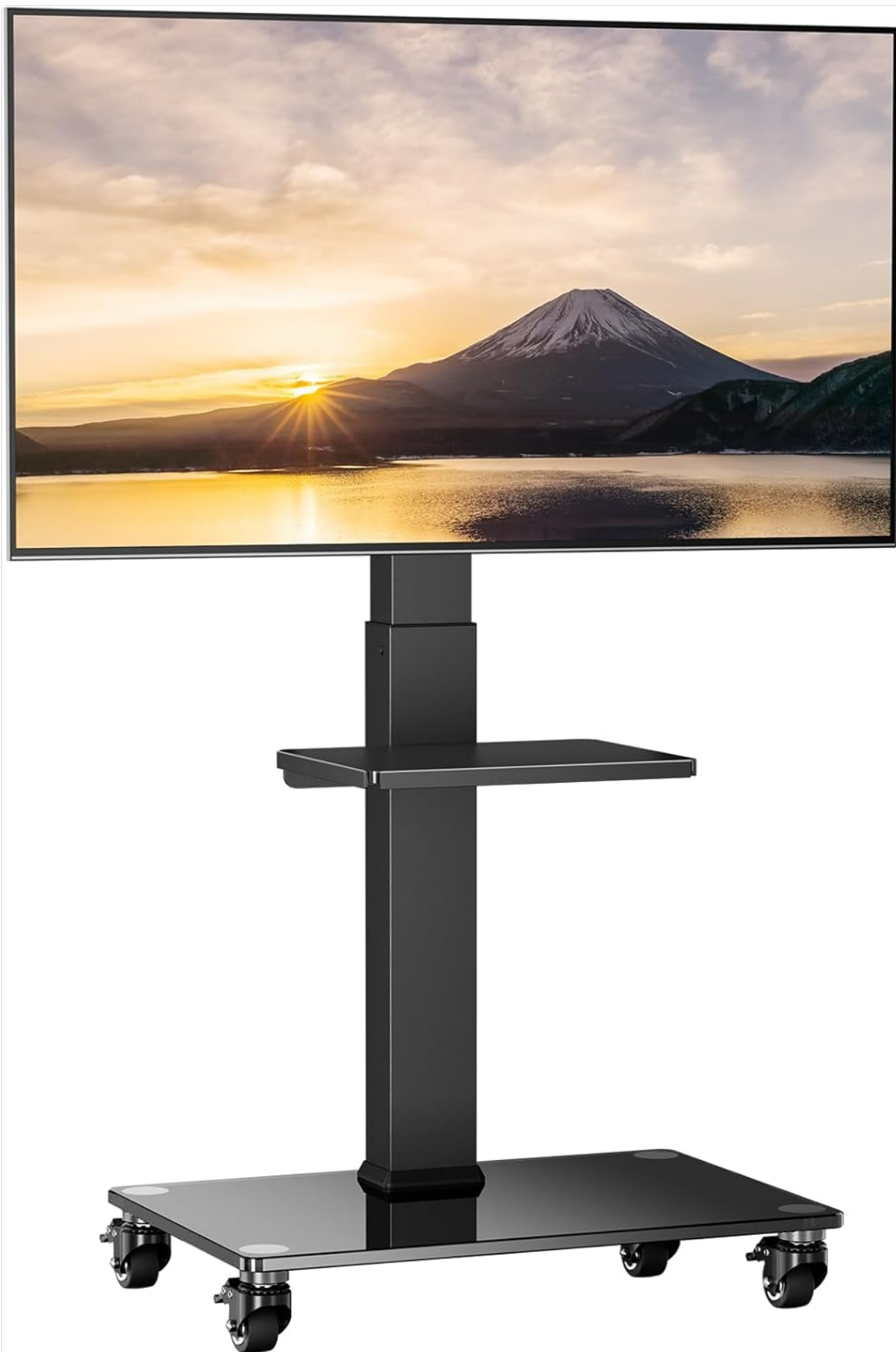
Figure 4.2: The Perlegear PGTVMC15 Mobile TV Stand fully assembled with a television mounted.