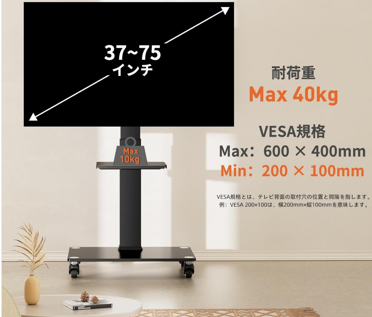
Figure 4.1: TV compatibility guidelines. This image illustrates the compatibility of the TV stand, supporting televisions from 37 to 75 inches, with a maximum weight of 40kg. It is compatible with VESA mounting patterns ranging from 200x100mm to 600x400mm.