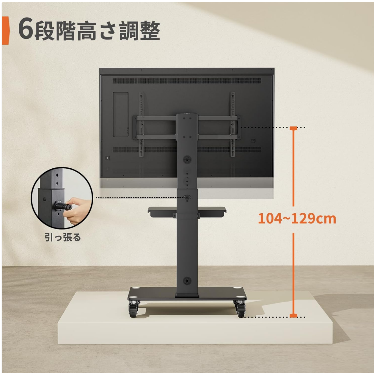
Figure 5.1: Height adjustment mechanism. The stand offers 6 levels of height adjustment, allowing the TV to be positioned between 104cm and 129cm (from the center of the mounting plate to the floor surface). Adjustment is made using a convenient pull-pin mechanism.