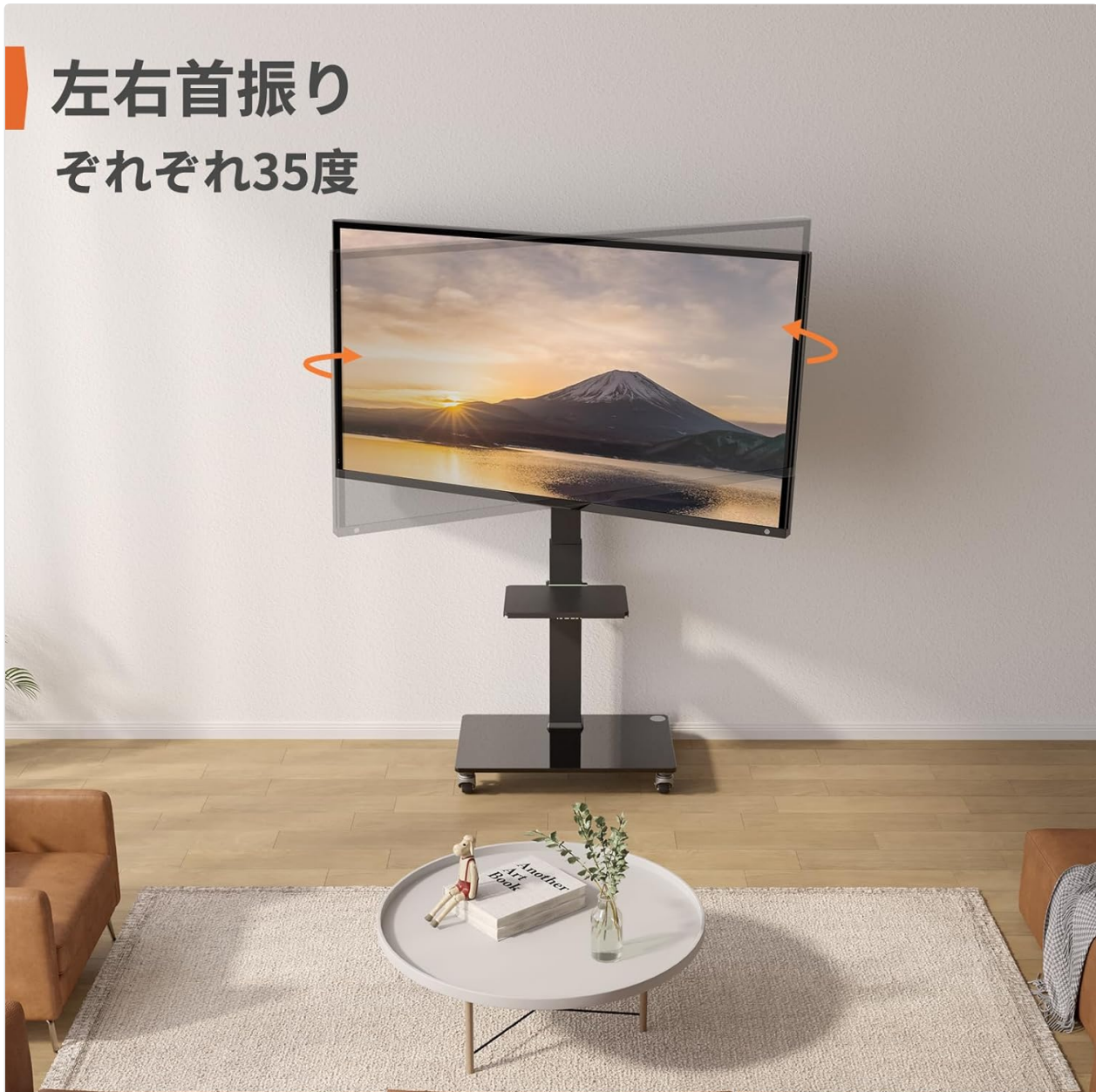
Figure 5.2: Swivel function. The TV stand features a \pm 35 -degree swivel function, enabling you to adjust the viewing angle for comfortable viewing from various positions in the room.