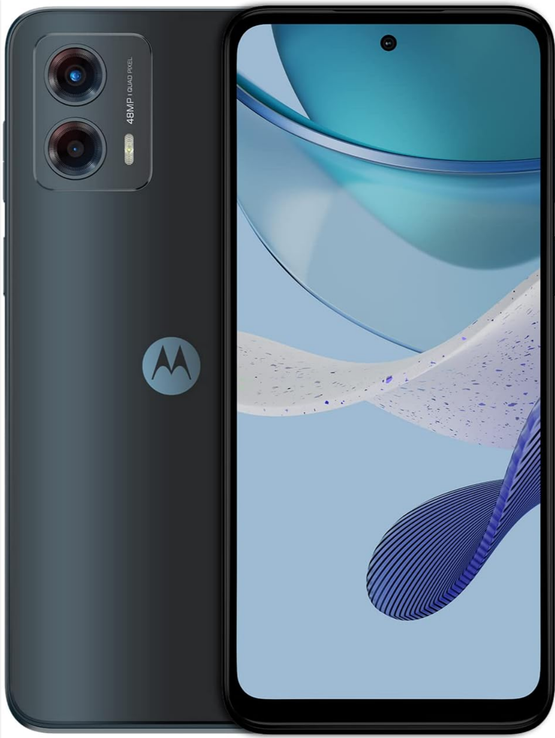
Image 1.1: Front and back view of the Motorola Moto G 5G (2023) smartphone.