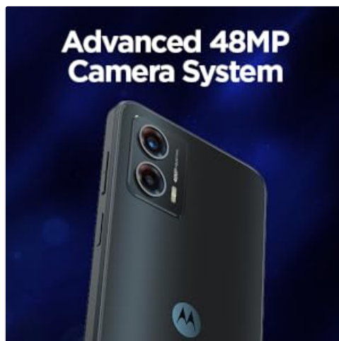
Image 2.3: Close-up of the 48MP camera system on the rear of the device.