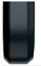
Image 2.1: Bottom view of the device, highlighting the USB-C port and 3.5mm audio jack.